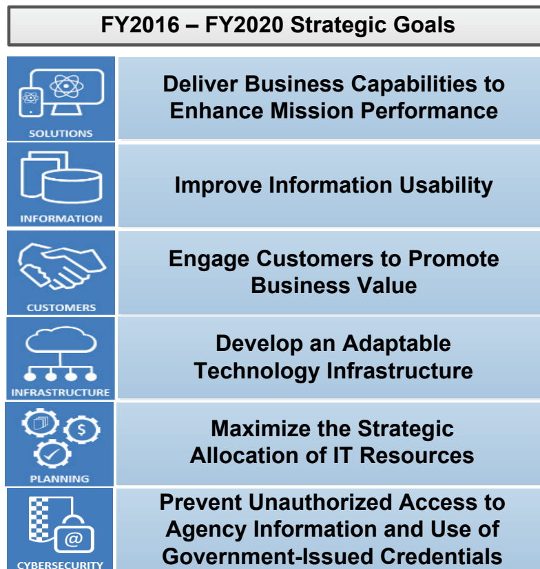
Figure 1 IT/IM Strategic Goals

The agency has worked with its stakeholders to develop goals, as well as the supporting strategies to achieve them. The NRC is committed to carrying out innovative IT/IM capabilities that deliver cost and performance improvements. As illustrated in the diagram below and the text that follows, six IT/IM goals encompassing both mission and corporate IT needs have been identified.