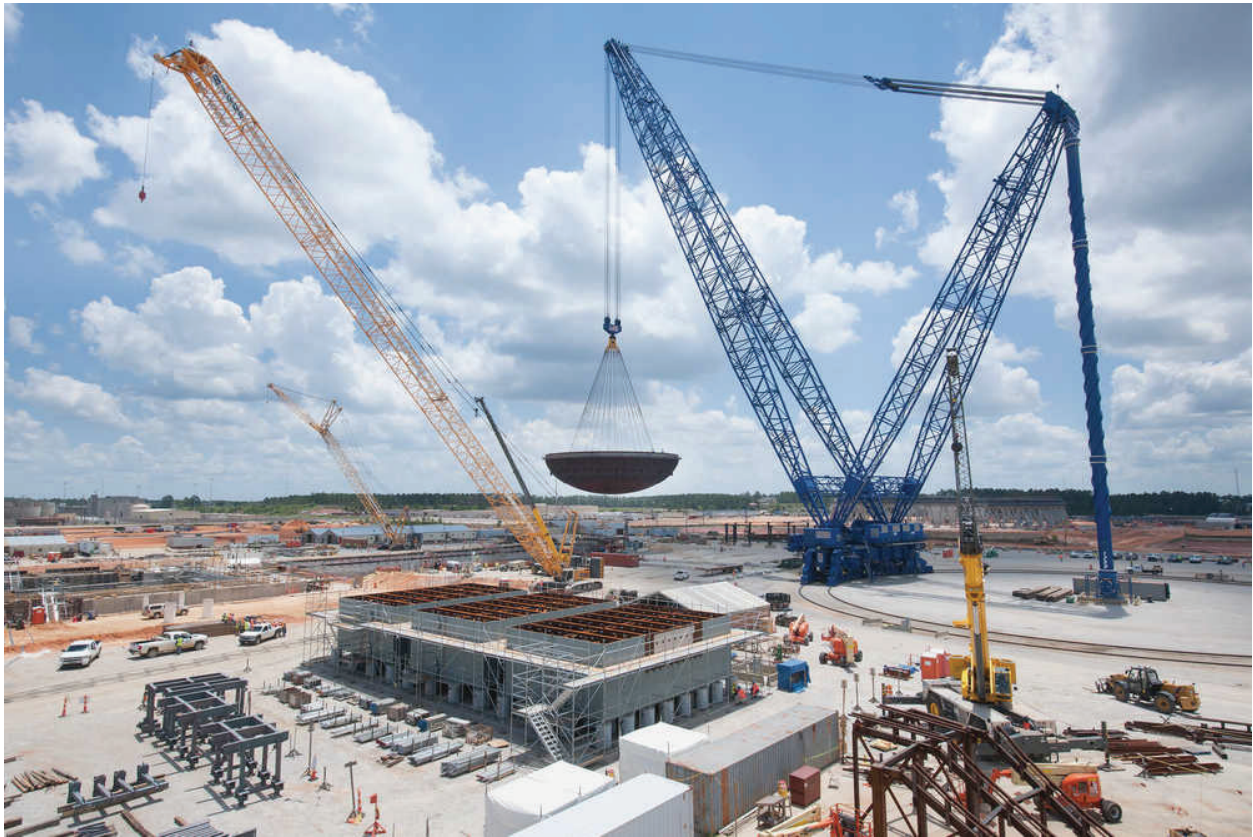
Containment vessel bottom head for Plant Vogtle's Unit 3 reactor

The NRC has developed performance indicators for tracking progression of the goals and strategies. The agency will then carry out the activities outlined in the enterprise roadmap, using the results of the performance indicators as input for the next iteration of the strategic planning process.