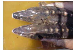
Atlantic sturgeon (top) and Shortnose sturgeon (bottom)

Behavior: they migrate upriver in spring in spawn