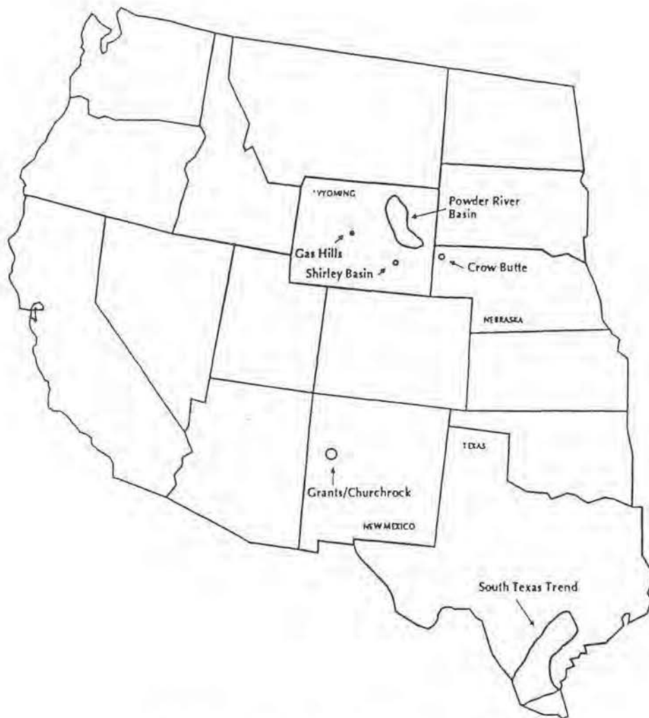
FIG. 2. In situ leach uranium mining districts.

kilometers and has been a prolific uranium producer. In the past several open pit and a few underground mines produced uranium, while today only the Highland and Christensen-Irigaray ISL mines are in production.