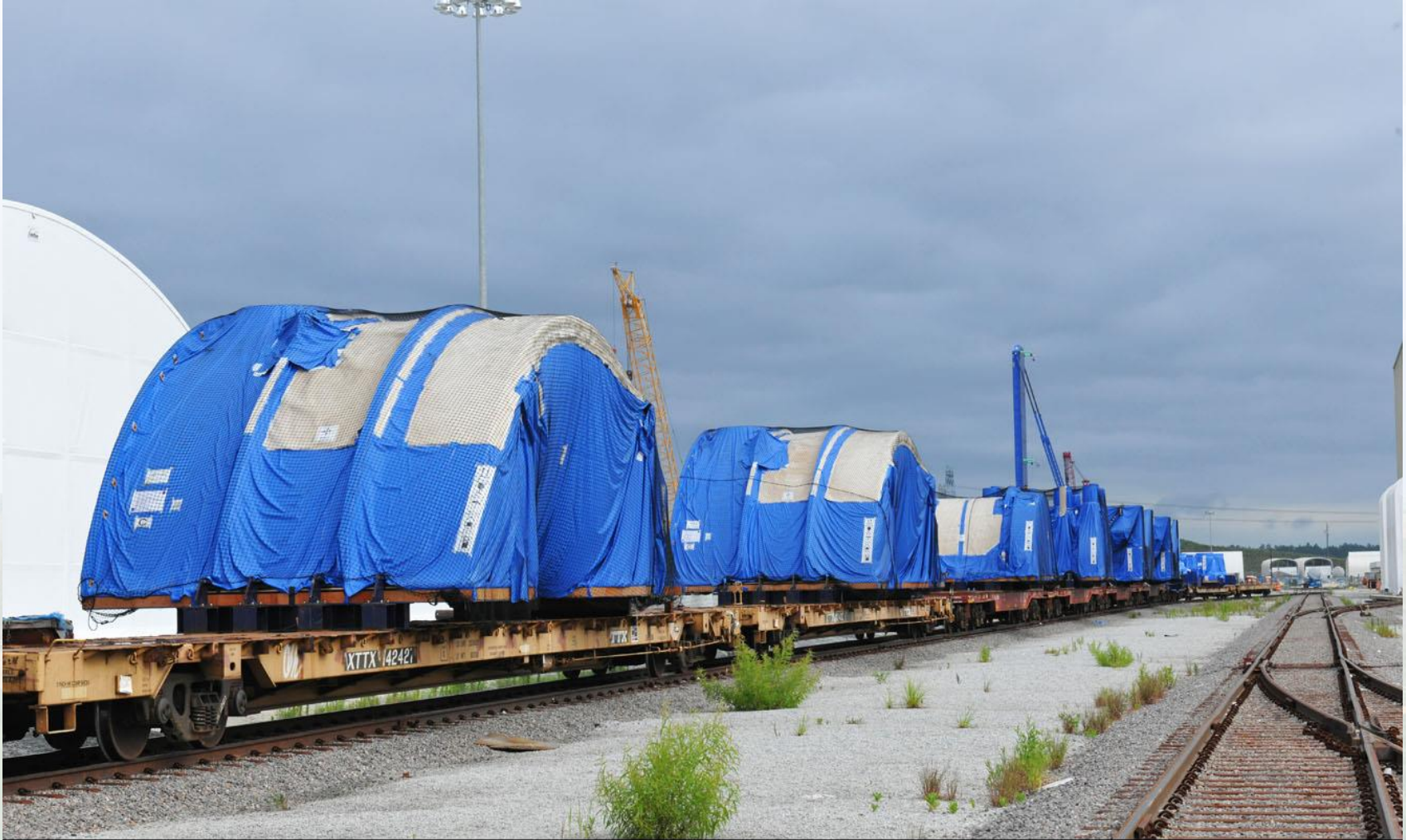
Vogtle Unit 4 turbine generator equipment arrives onsite.