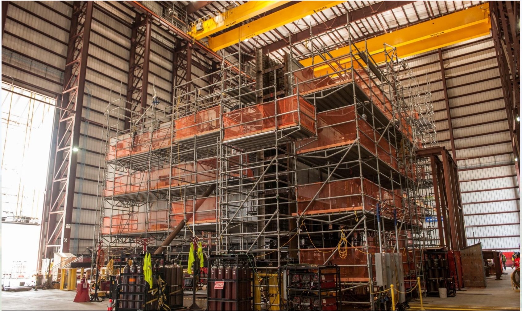
Vogtle Unit 3 CA01 module in the Module Assembly Building.