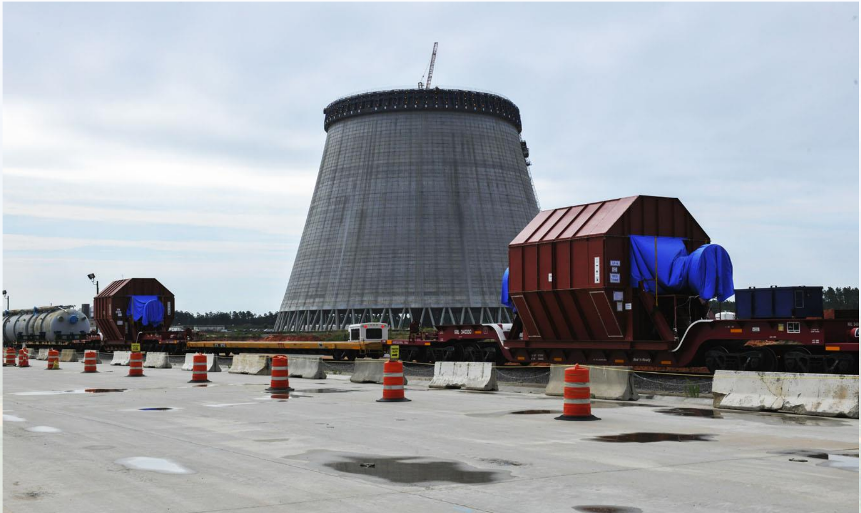
Vogtle Unit 4 turbine generator equipment arrives onsite, with Unit 3 cooling tower in background.