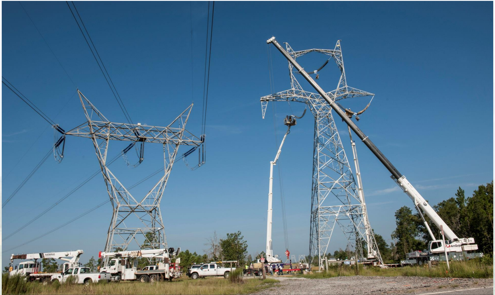
Vogtle 500-kV transmission line construction.