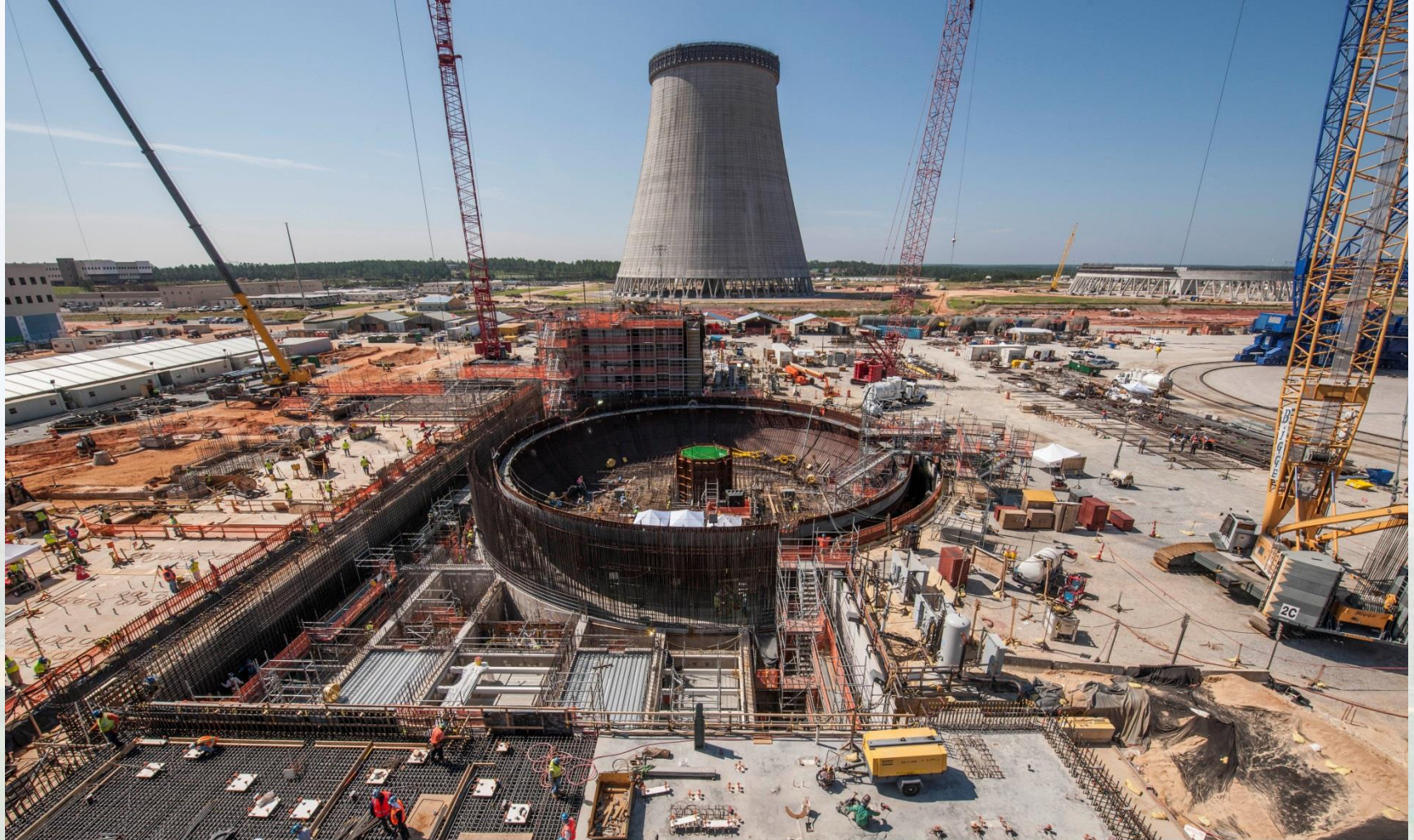
Vogtle Unit 3 nuclear island, with Unit 3 cooling tower in background.