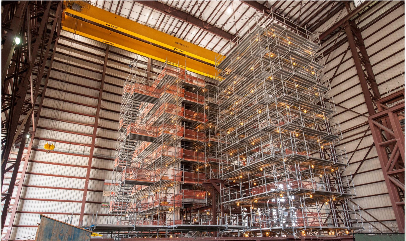
Vogtle Unit 3 CA01 module inside Module Assembly Building.