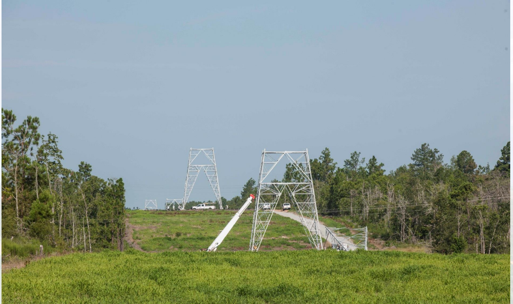
Vogtle 500-kV transmission line construction.