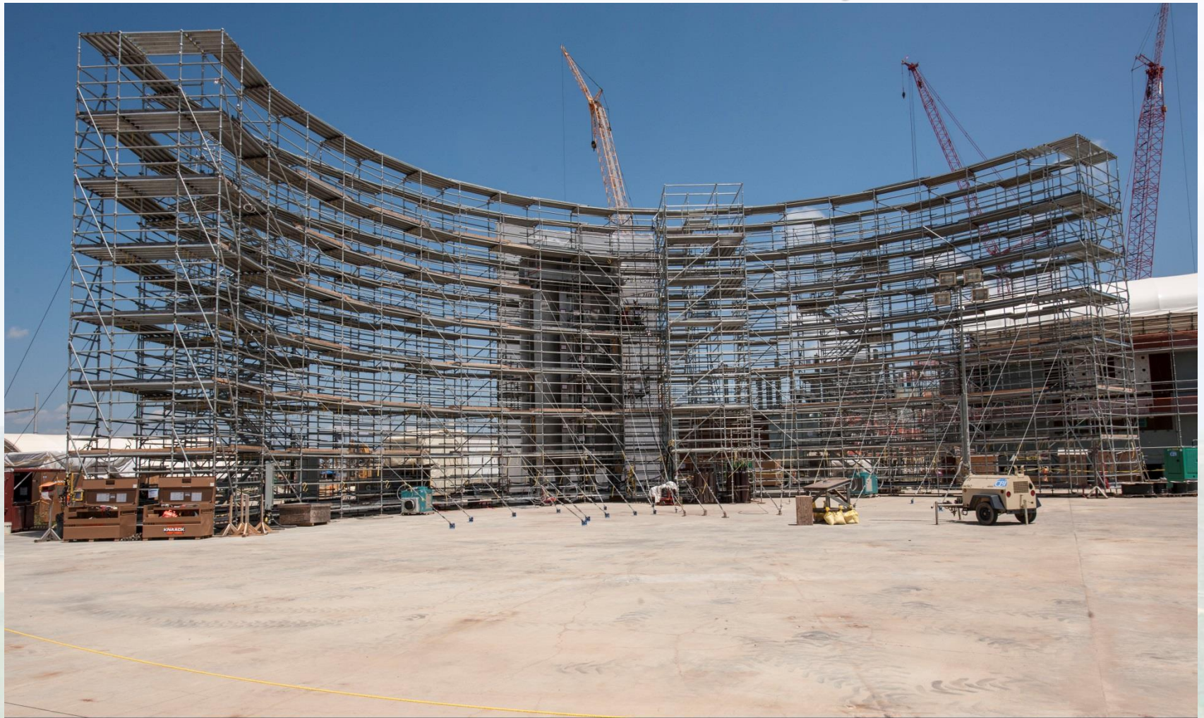
Vogtle Unit 3 CA03 module construction.