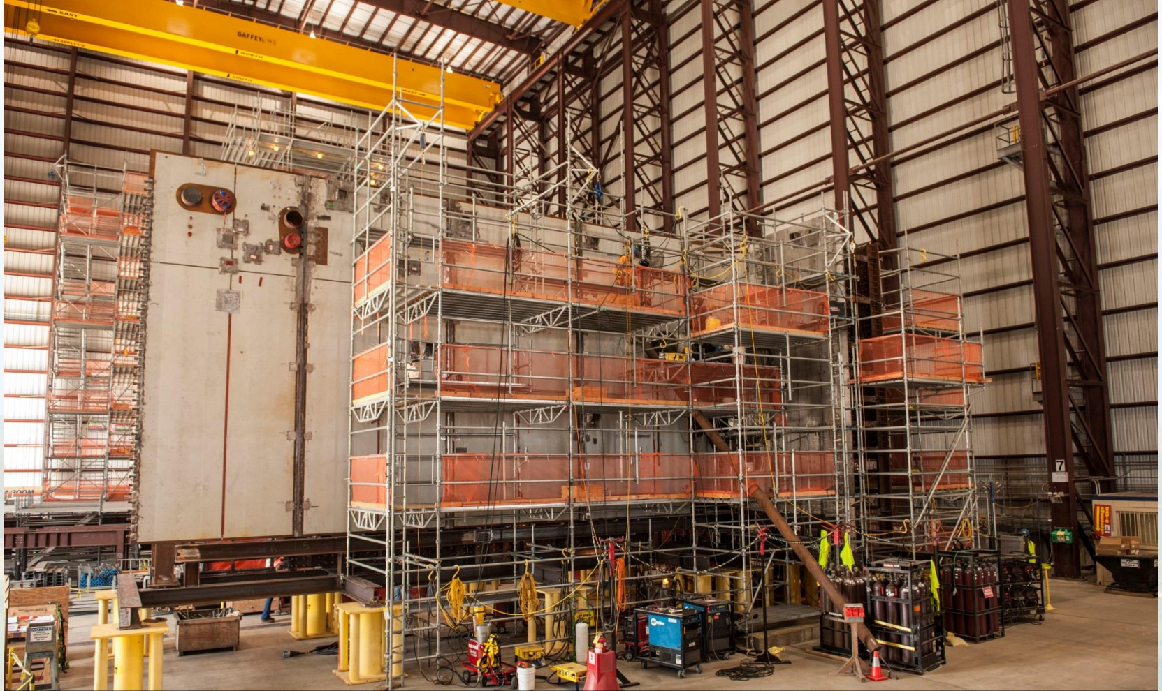
Vogtle Unit 3 CA05 module in the Module Assembly Building.