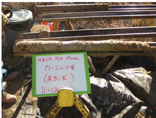
Pond 1 CC08 2.5-5' 11/12/13