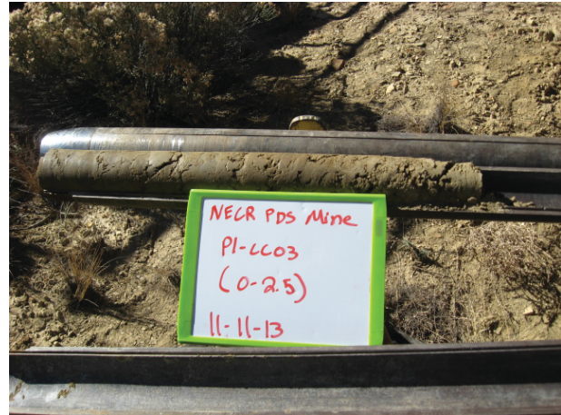
Pond 1 CC03 0-2.5' 11/11/13