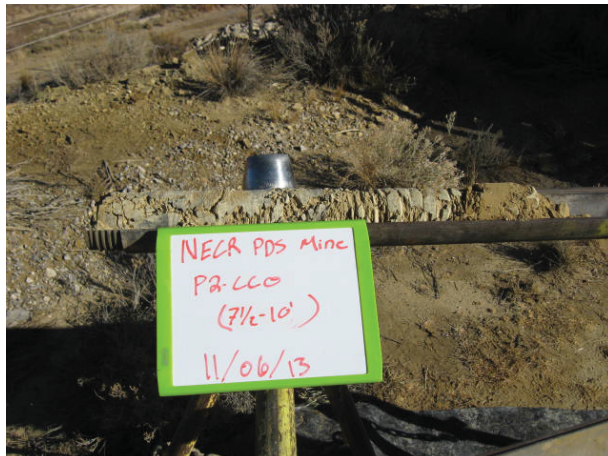
Pond 2 CC02 7.5-10' 11/6/13