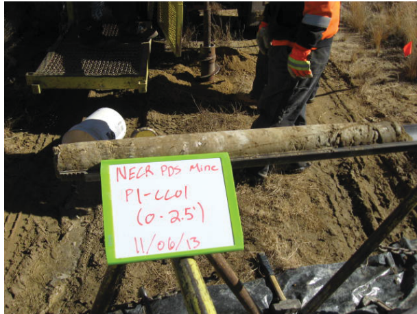
Pond 1 CC01 0-2.5' 11/6/13