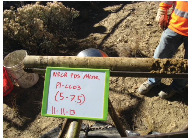
Pond 1 CC03 5-7.5' 11/11/13