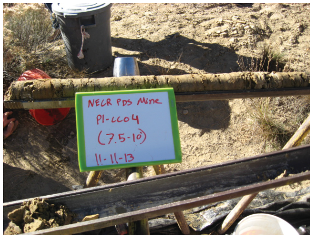
Pond 1 CC04 7.5-10' 11/11/13