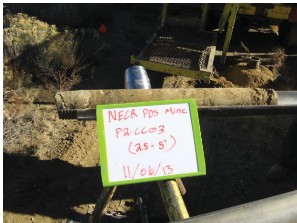
Pond 2 CC03 2.5-5' 11/6/13