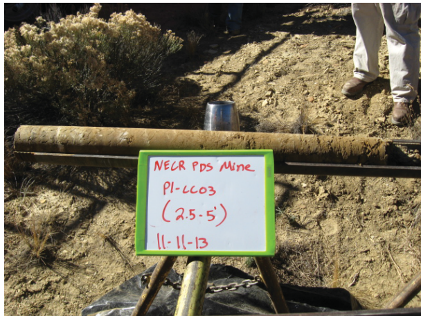
Pond 1 CC03 2.5-5' 11/11/13