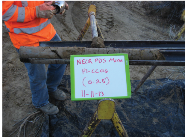
Pond 1 CC06 0-2.5' 11/11/13