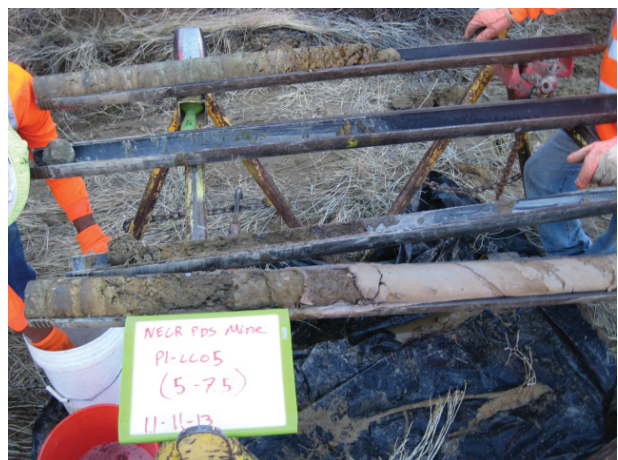
Pond 1 CC05 5-7.5' 11/11/13