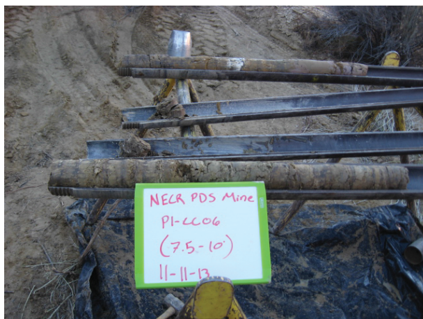
Pond 1 CC06 7.5-10' 11/11/13