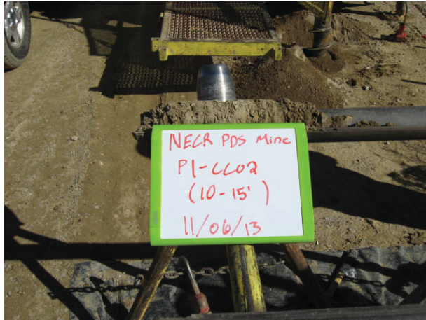
Pond 1 CC02 10-15' 11/6/13