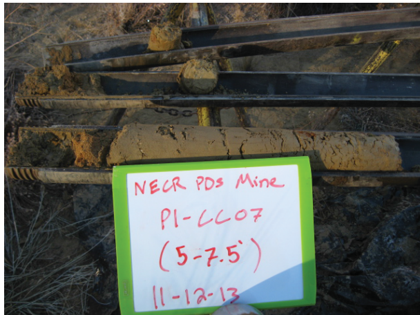
Pond 1 CC07 5-7.5' 11/12/13