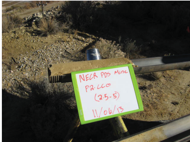
Pond 2 CC02 2.5-5' 11/6/13