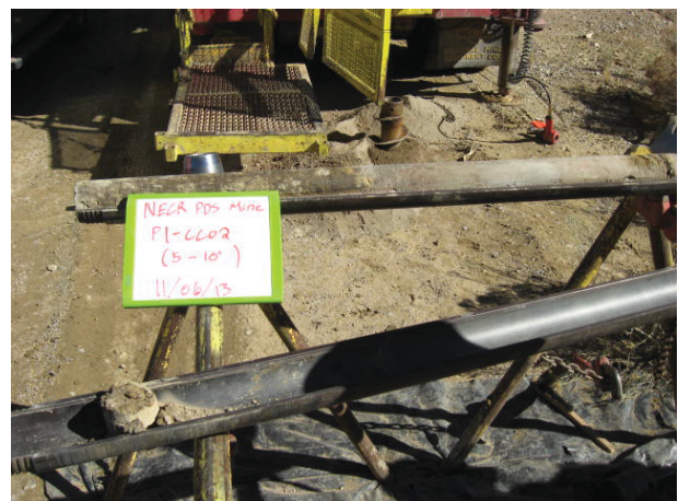
Pond 1 CC02 5-10' 11/6/13