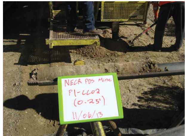
Pond 1 CC02 0-2.5' 11/6/13