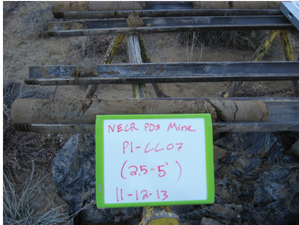
Pond 1 CC07 2.5-5' 11/12/13