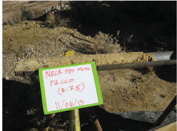
Pond 2 CC02 5-7.5' 11/6/13