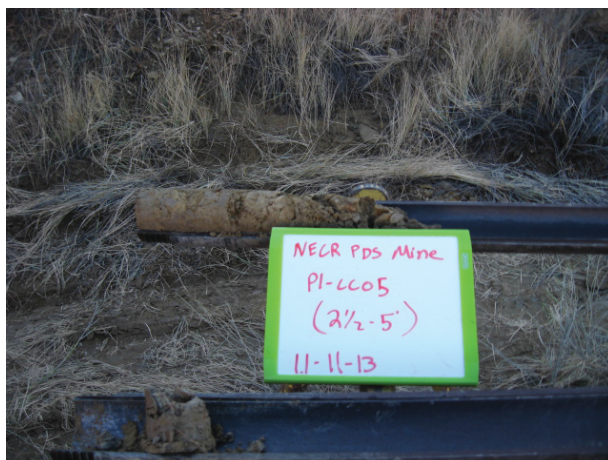
Pond 1 CC05 2.5-5' 11/11/13