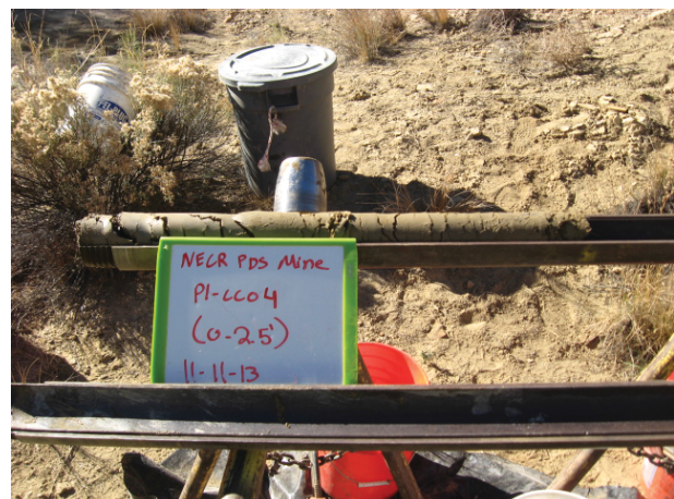
Pond 1 CC04 0-2.5' 11/11/13