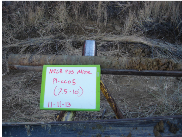
Pond 1 CC05 7.5-10' 11/11/13