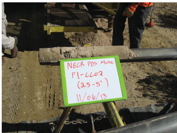
Pond 1 CC02 2.5-5' 11/6/13