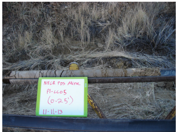
Pond 1 CC05 0-2.5' 11/11/13