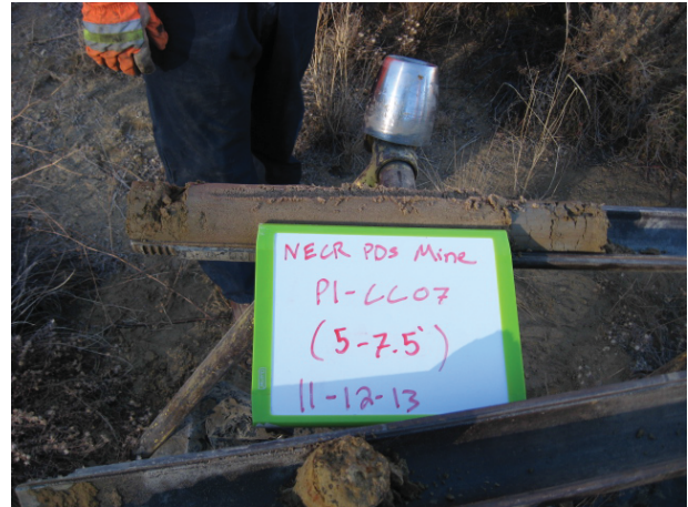
Pond 1 CC07 5-7.5' 11/12/13