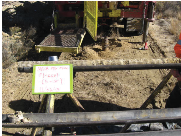
Pond 1 CC01 5-10' 11/6/13