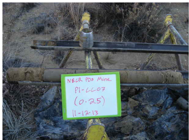
Pond 1 CC07 0-2.5' 11/12/13