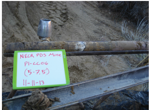
Pond 1 CC06 5-7.5' 11/11/13