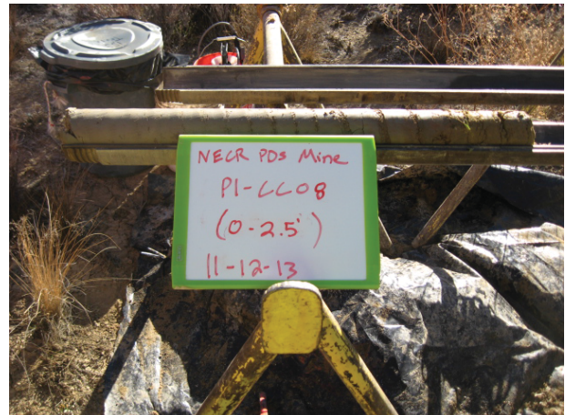
Pond 1 CC08 0-2.5' 11/12/13