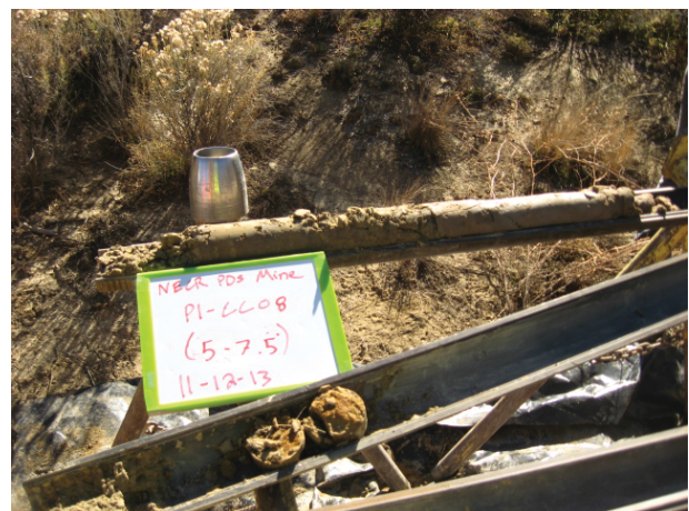
Pond 1 CC08 5-7.5' 11/12/13