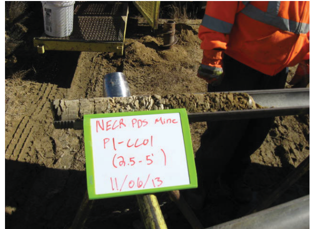
Pond 1 CC01 2.5-5' 11/6/13