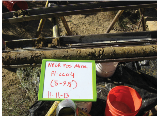
Pond 1 CC04 5-7.5' 11/11/13