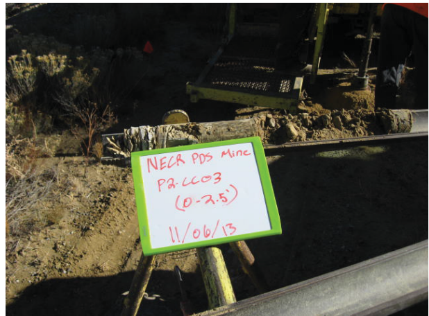
Pond 2 CC03 0-2.5' 11/6/13