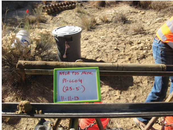
Pond 1 CC04 2.5-5' 11/11/13