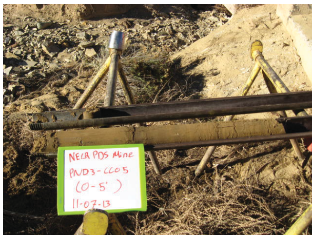
Pond 3 CC05 0-5' 11/7/13