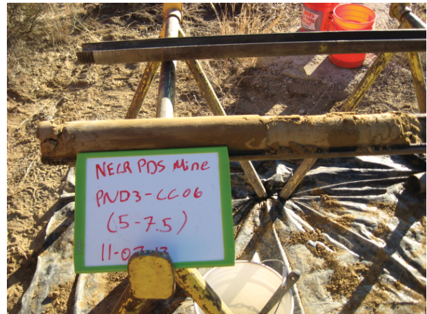
Pond 3 CC06 5-7.5' 11/7/13