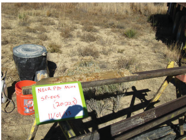
Sediment Pad CC05 20-22.5' 11/1/13