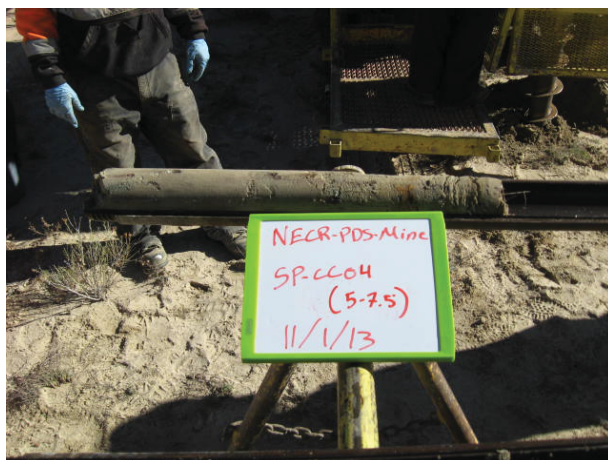
Sediment Pad CC04 5-7.5' 11/1/13