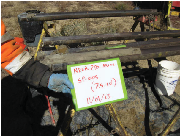
Sediment Pad CC05 7.5-10' 11/1/13