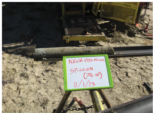
Sediment Pad CC04 7.5-10' 11/1/13