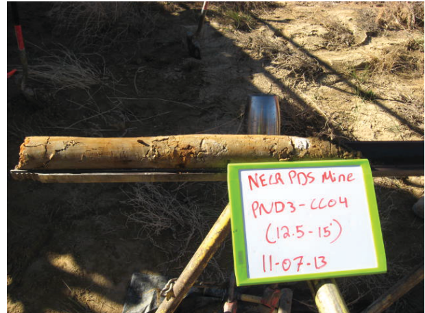
Pond 3 CC04 12.5-15' 11/7/13