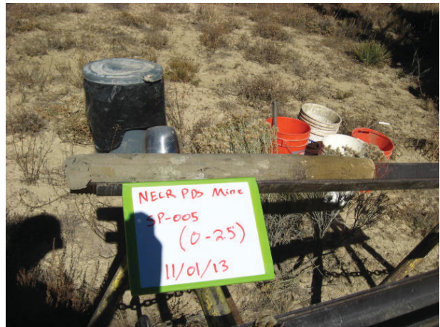
Sediment Pad CC05 0-2.5' 11/1/13