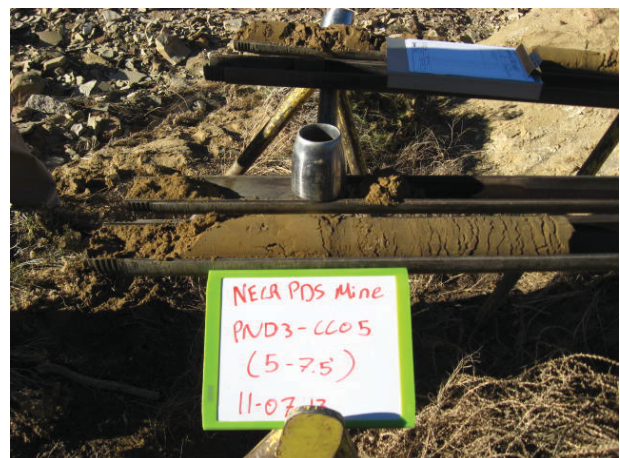
Pond 3 CC05 5-7.5' 11/7/13