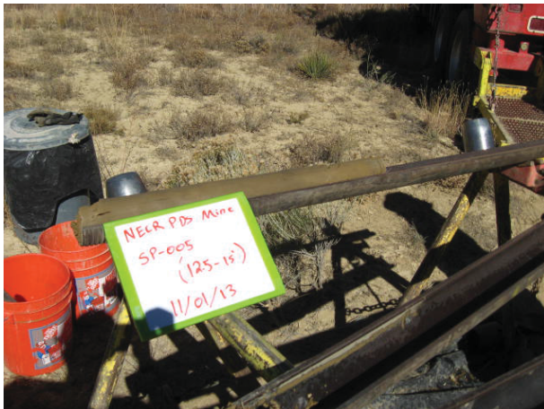
Sediment Pad CC05 12.5-15' 11/1/13