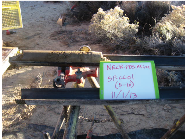
Sediment Pad CC01 5-10' 11/1/13