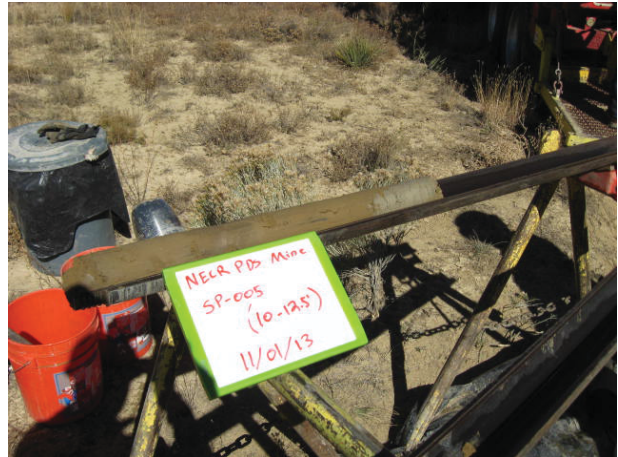
Sediment Pad CC05 10-12.5' 11/1/13