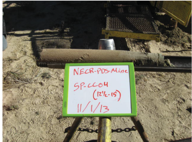
Sediment Pad CC04 12.5-15' 11/1/13