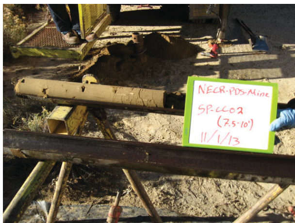
Sediment Pad CC02 7.5-10' 11/1/13