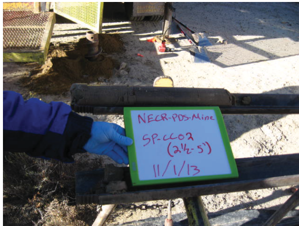
Sediment Pad CC02 2.5-5' 11/1/13