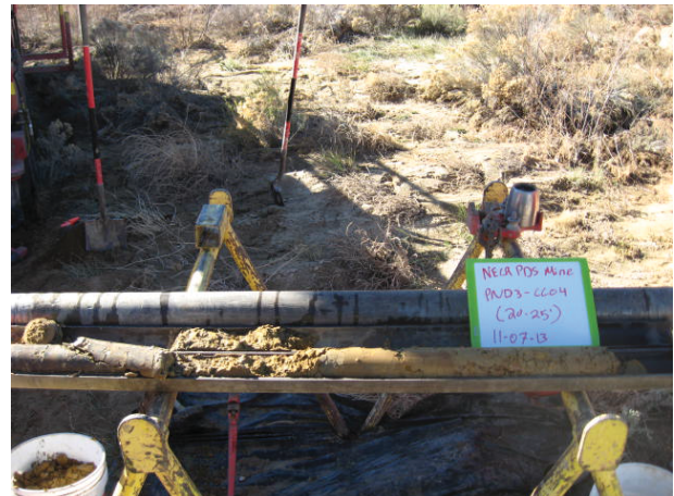
Pond 3 CC04 20-25' 11/7/13