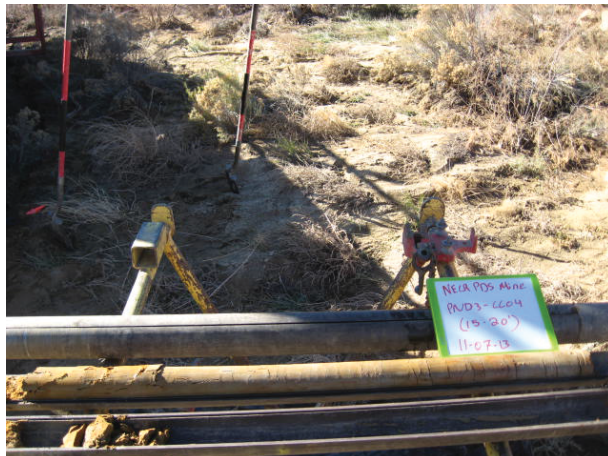
Pond 3 CC04 15-20' 11/7/13