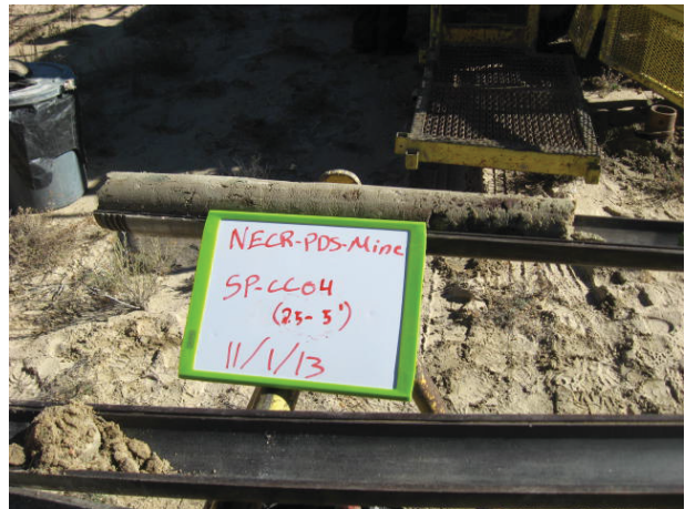
Sediment Pad CC04 2.5-5' 11/1/13