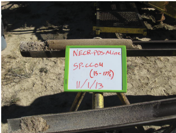
Sediment Pad CC04 15-17.5' 11/1/13