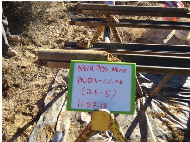
Pond 3 CC06 2.5-5' 11/7/13