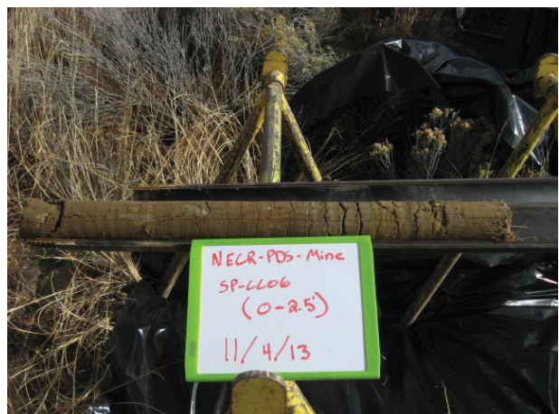
Sediment Pad CC06 0-2.5' 11/4/13