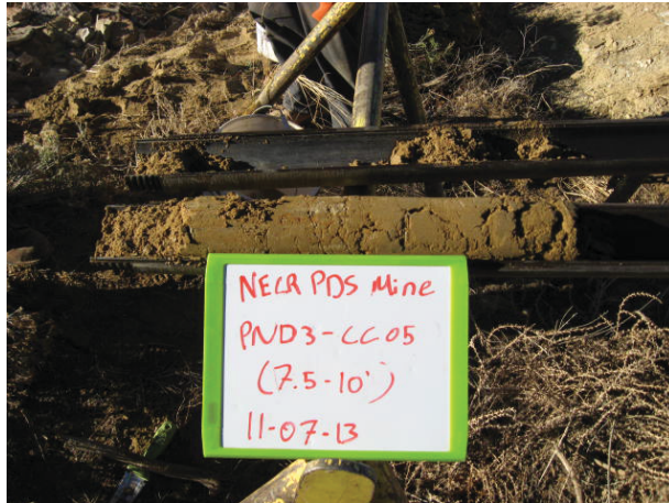
Pond 3 CC05 7.5-10' 11/7/13