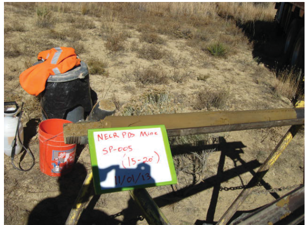
Sediment Pad CC05 15-20' 11/1/13