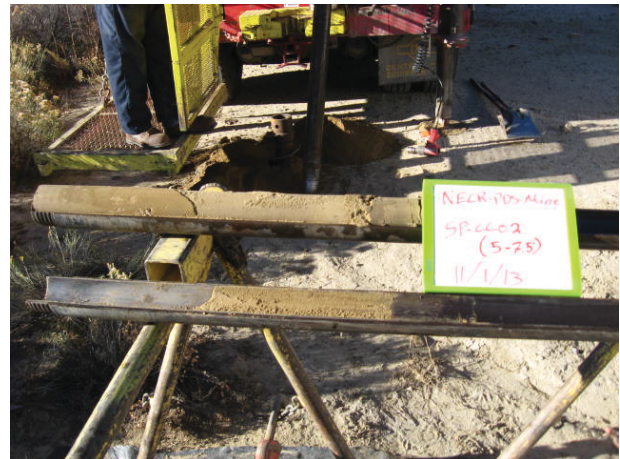
Sediment Pad CC02 5-7.5' 11/1/2013