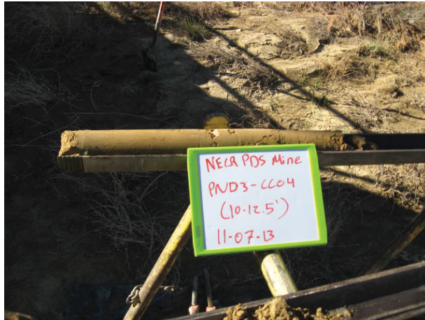
Pond 3 CC04 10-12.5' 11/7/13