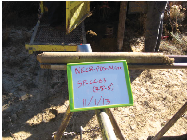
Sediment Pad CC03 2.5-5' 11/1/13