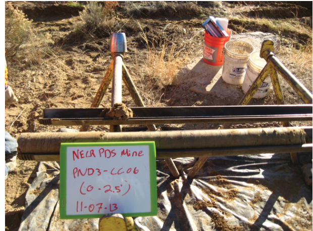
Pond 3 CC06 0-2.5' 11/7/13