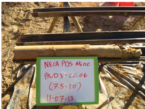
Pond 3 CC06 7.5-10' 11/7/13