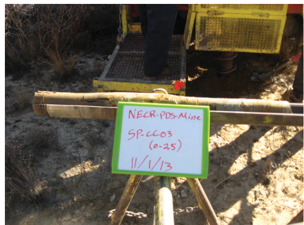
Sediment Pad CC03 0-2.5' 11/1/13