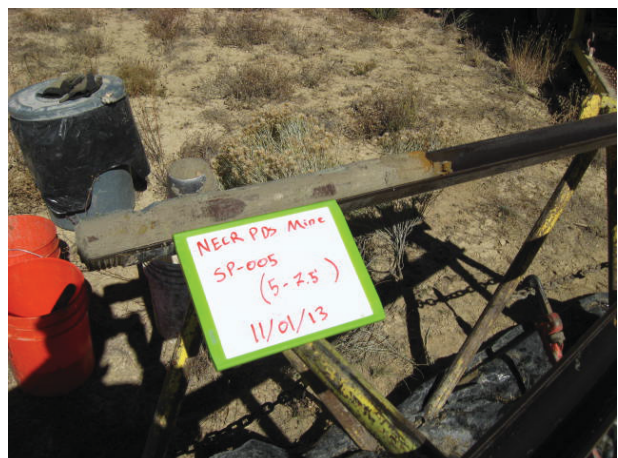
Sediment Pad CC05 5-7.5' 11/1/13