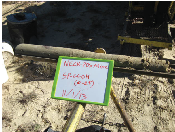
Sediment Pad CC04 0-2.5' 11/1/13