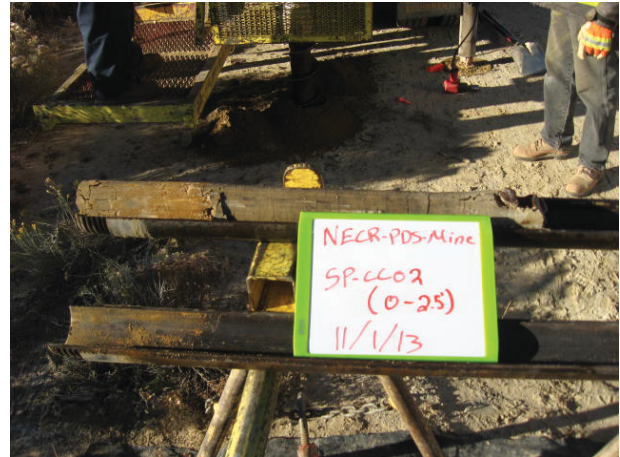
Sediment Pad CC02 0-2.5' 11/1/13