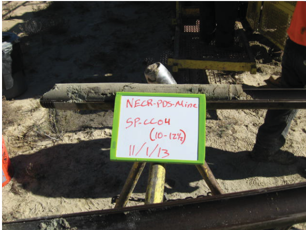
Sediment Pad CC04 10-12.5' 11/1/13