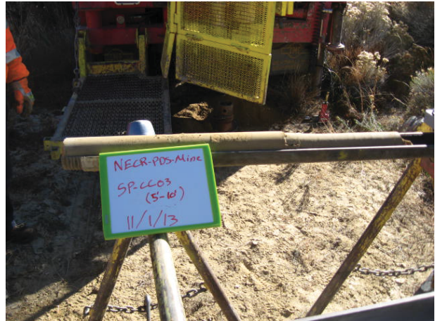
Sediment Pad CC03 5-10' 11/1/13