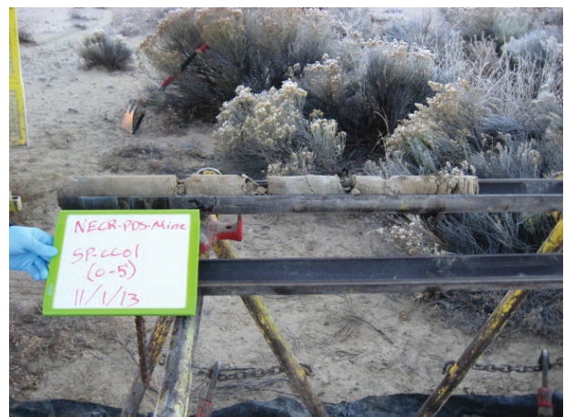
Sediment Pad CC01 0-5' 11/1/13