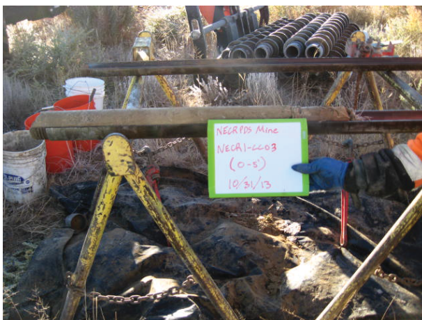
NECR1-CC03 0-5' 10/31/13