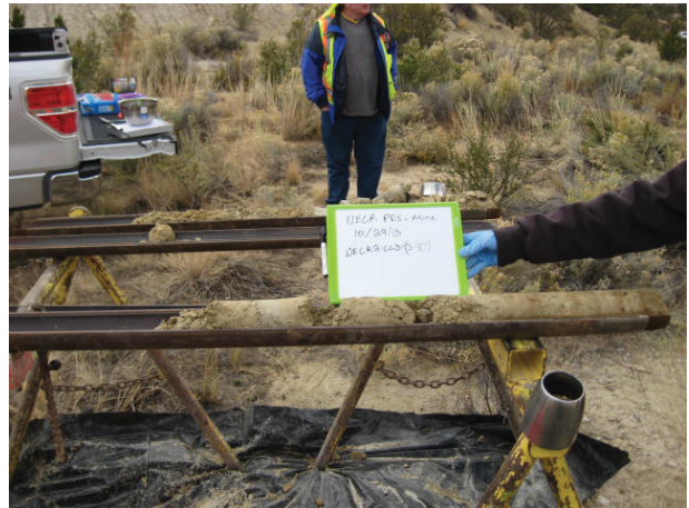
NECR2-CC03 5-10' 10/29/13