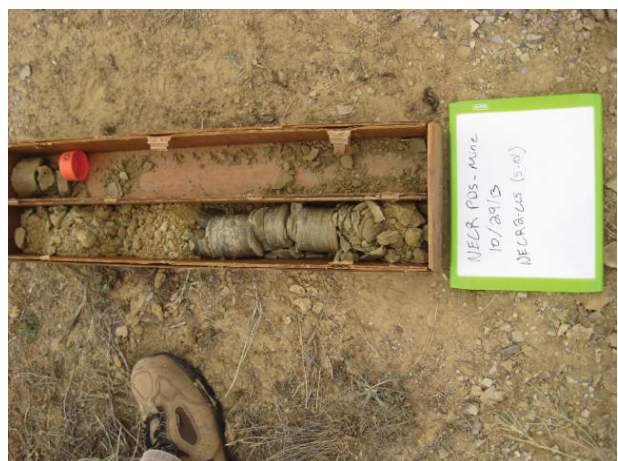
NECR2-CC05 5-10' 10/29/13