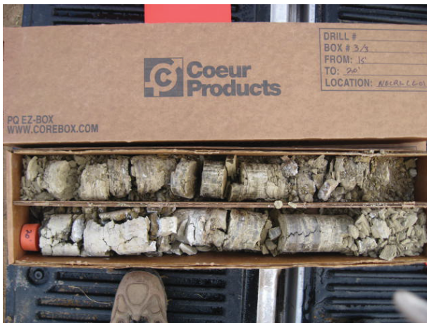
NECR1-CC01 15-20' 10/30/13