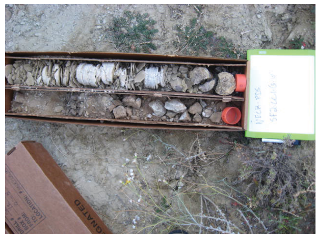
Sand Fill 2 CC01 5-10' 10/29/13