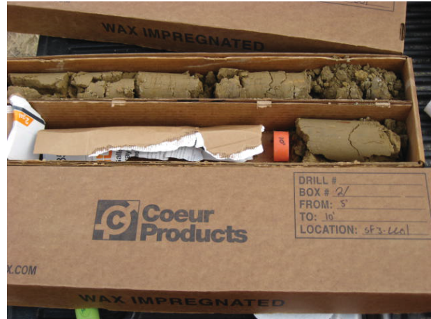
Sand Fill 3 CC01 5-10' 10/30/13