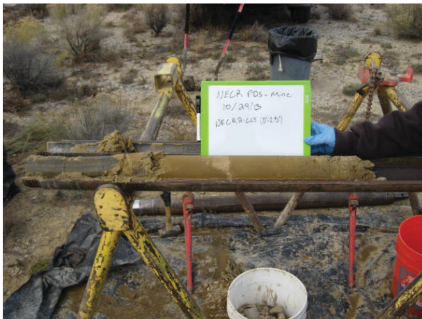
NECR2-CC05 0-2.5' 10/29/13