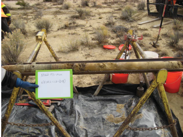
NECR2-CC02 0-5' 10/29/13