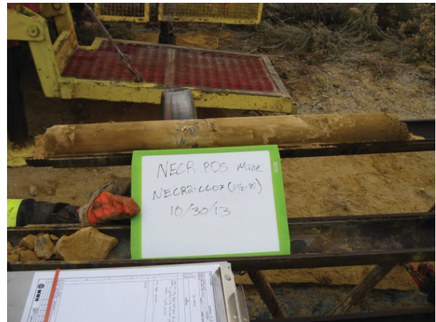
NECR2-CC07 6.5-10' 10/30/13