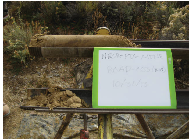
Road-CC03 5-10' 10/30/13