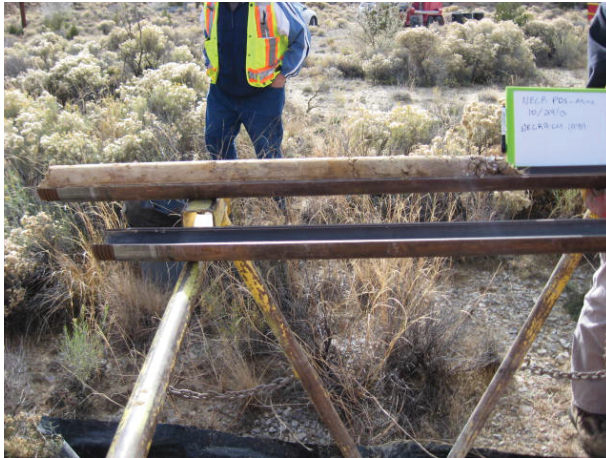
NECR2-CC04 0-5' 10/29/13