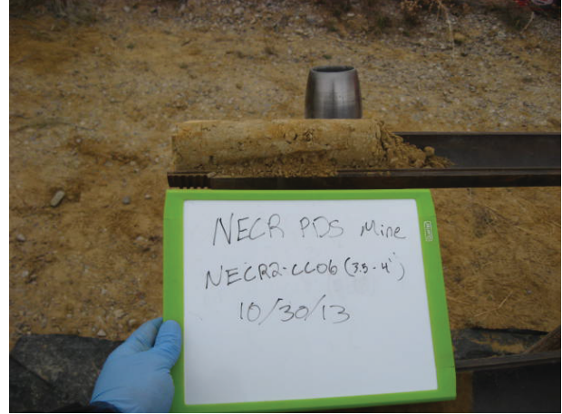
NECR2-CC06 3.5-4' 10/30/13