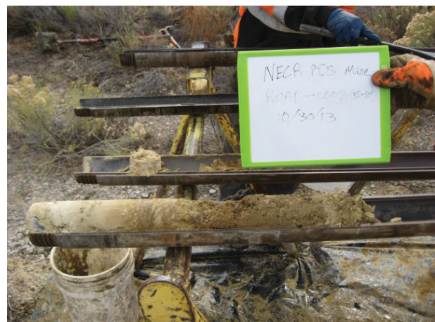
Road-CC02 5-10' 10/30/13