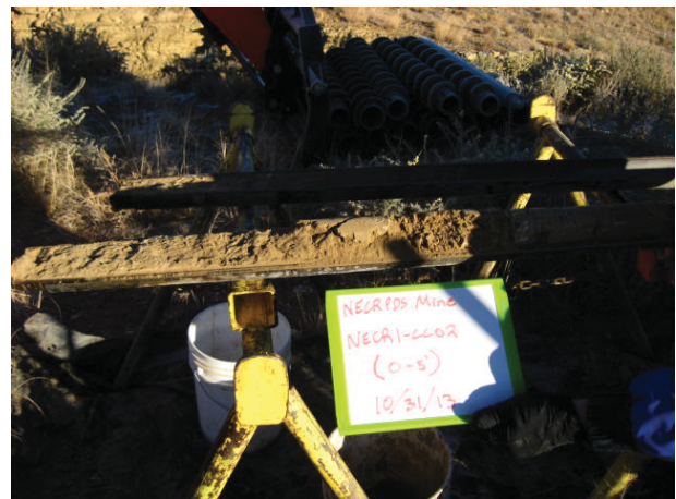
NECR1-CC02 0-5' 10/31/13