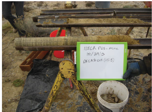
NECR2-CC05 2.5-5' 10/29/13