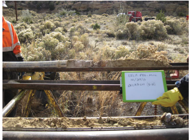
NECR2-CC04 5-10' 10/29/13