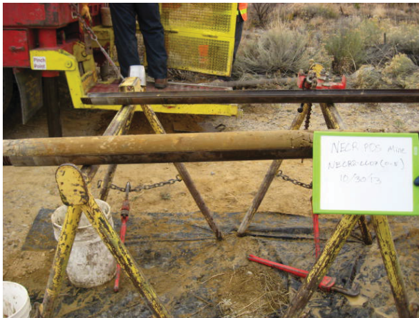
NECR2-CC07 0-5' 10/30/13