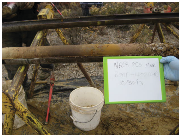
Road-CC02 0-5' 10/30/13