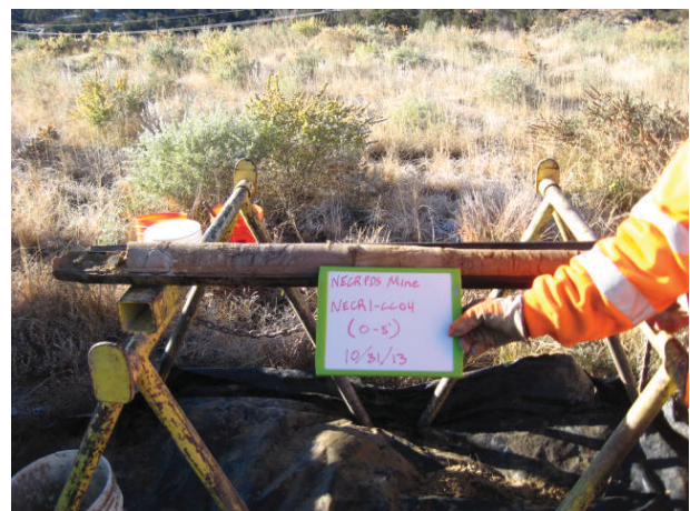
NECR1-CC04 0-5' 10/31/13