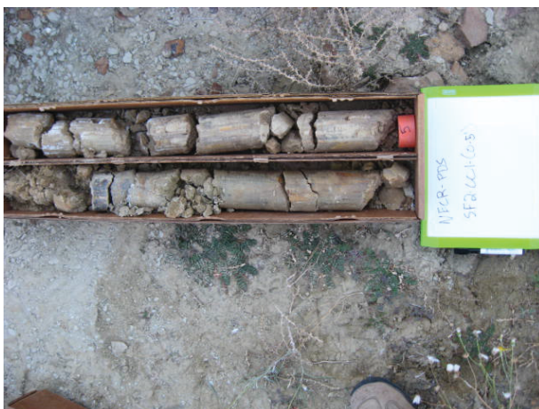
Sand Fill 2 CC01 0-5' 10/29/13