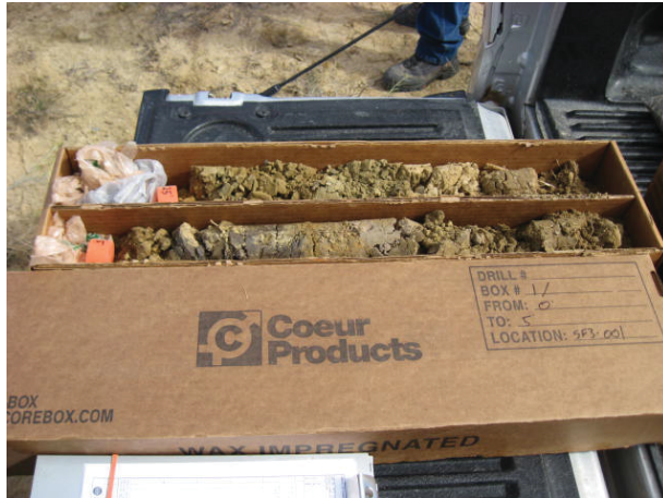
Sand Fill 3 CC01 0-5' 10/30/13