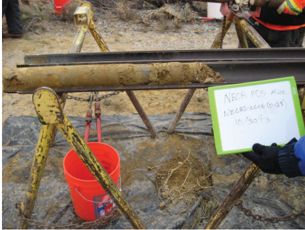
NECR2-CC06 0-2.5' 10/30/13