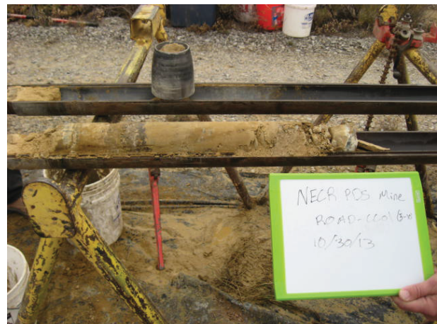
Road-CC01 5-10' 10/30/13