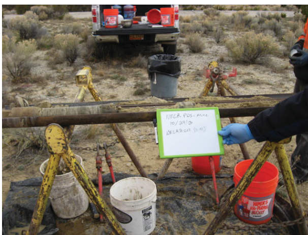
NECR2-CC05 5-10' 10/29/13