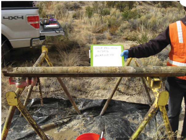
NECR2-CC03 0-5' 10/29/13