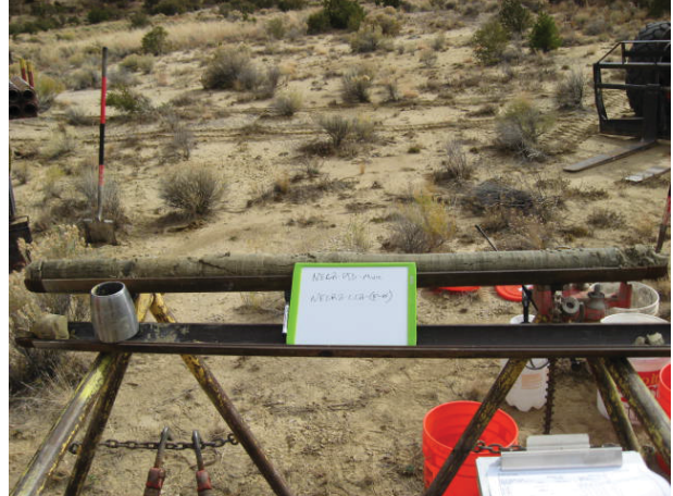
NECR2-CC02 5-10' 10/29/13