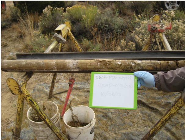
Road-CC03 0-5' 10/30/13