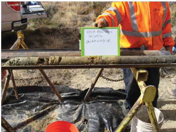
NECR2-CC03 10-15' 10/29/13