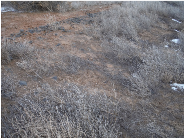
Branch Swale H, Section H-1 Typical Condition of Bottom of Swale (12/7/13)