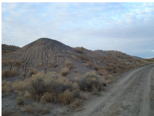
Stockpile 1 11/13/13