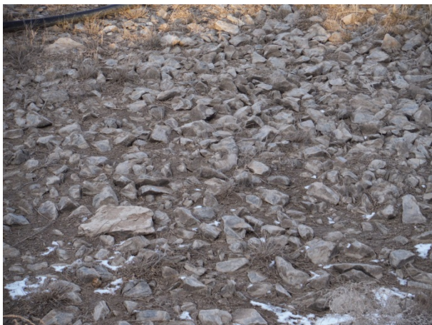
Branch Swale H, Section H-2 Typical Condition of Bottom of Swale (12/7/13)