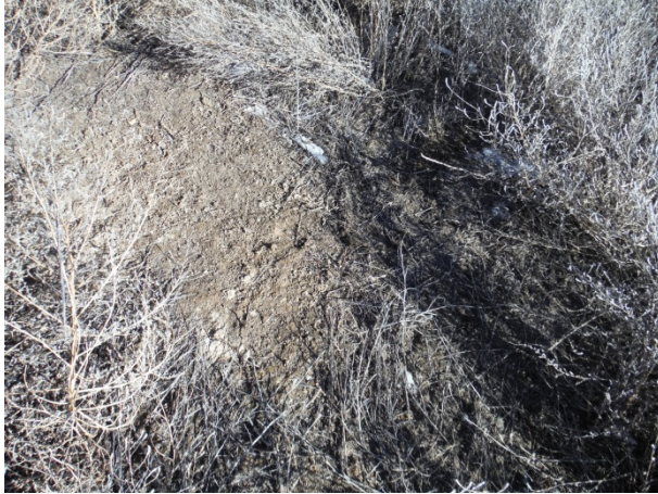
Branch Swale D, Section D-2 Sediment on Bottom of Swale (12/7/13)