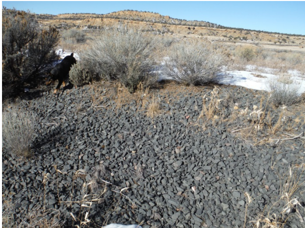
Branch Swale F, Section F-2 Typical Condition of Side of Swale (12/14/13)