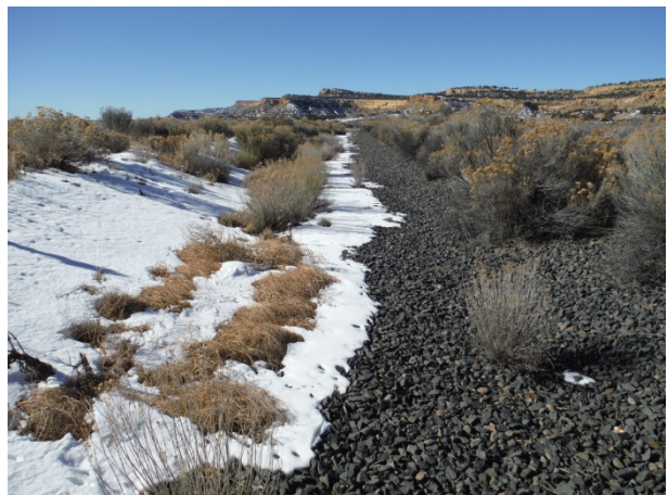
Branch Swale G, Section G-2 Typical Swale Condition (looking W) (12/14/13)