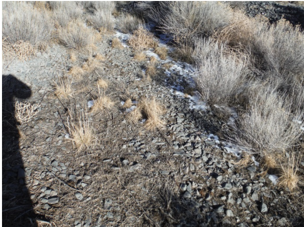
Branch Swale D, Section D-3 Rock on Bottom of Swale (12/7/13)