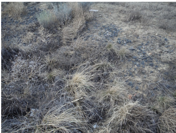
Branch Swale E, Section E-2 Typical Condition of Side of Swale (12/7/13)