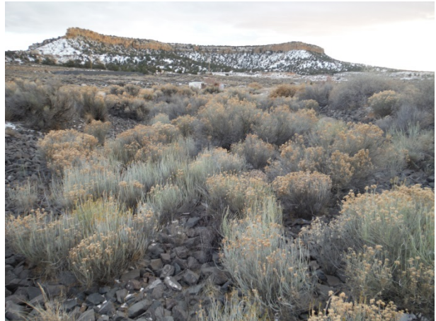
Branch Sale H, Section H-2 Typical Swale Condition (looking SE) (12/7/13)