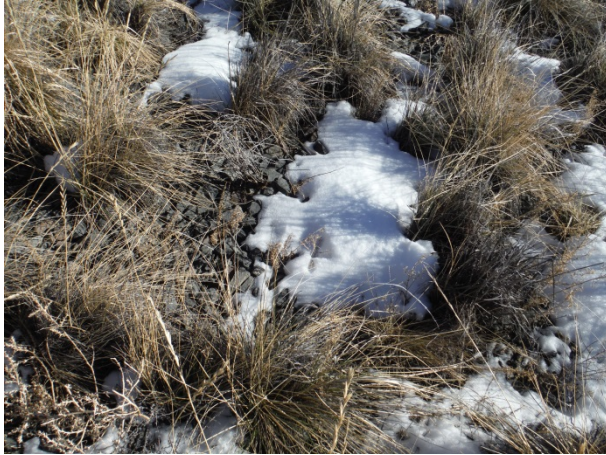
Branch Swale F, Section F-1 Typical Condition of Bottom of Swale (12/14/13)