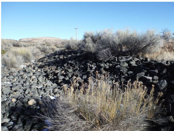
North Diversion Channel, Section NDC-2 Typical East Slope Condition (12/14/13)