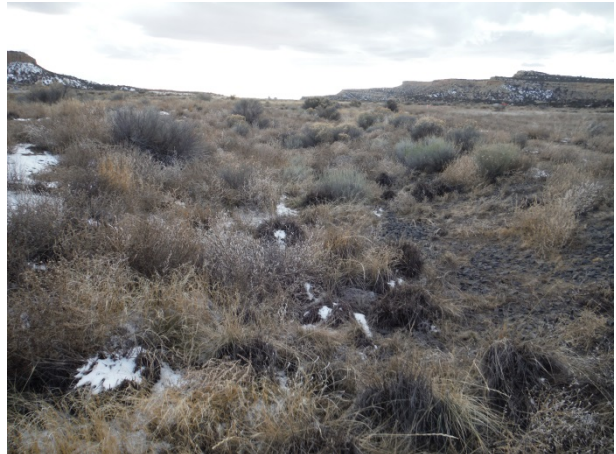
Branch Swale E, Section E-2 Typical Swale Condition (looking SW) (12/7/13)