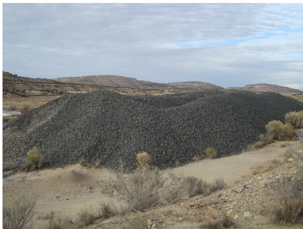
Stockpile 4 11/13/13