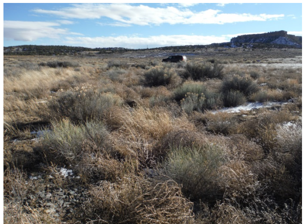
Branch Swale D, Section D-6 Typical Swale Condition (looking SE) (12/7/13)