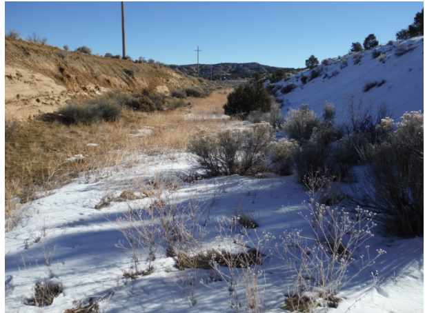
North Diversion Channel, Section NDC-5 Typical Channel Condition (looking N) (12/14/13)