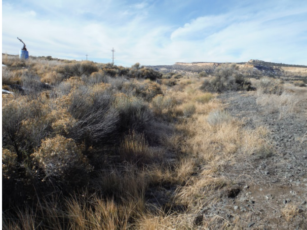
Branch Swale A, Section A-1 Typical Swale Condition (looking SW) (11/27/13)