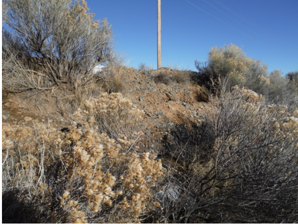
North Diversion Channel, Section NDC-3 Typical Roadway Berm Condition (12/14/13)