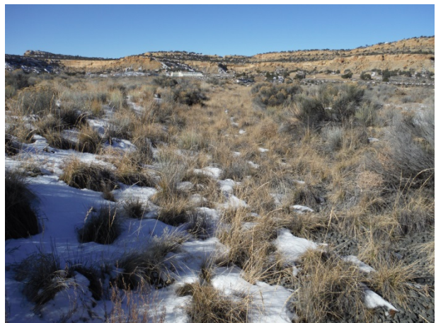
Branch Swale F, Section F-1 Typical Swale Condition (looking W) (12/14/13)