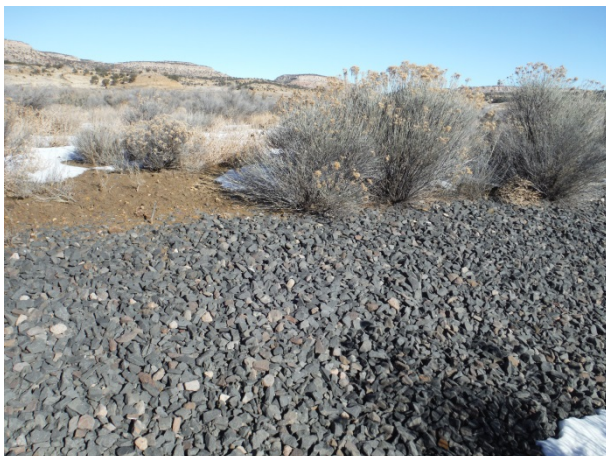
Branch Swale G, Section G-1 Typical Condition of Side of Swale (12/14/13)