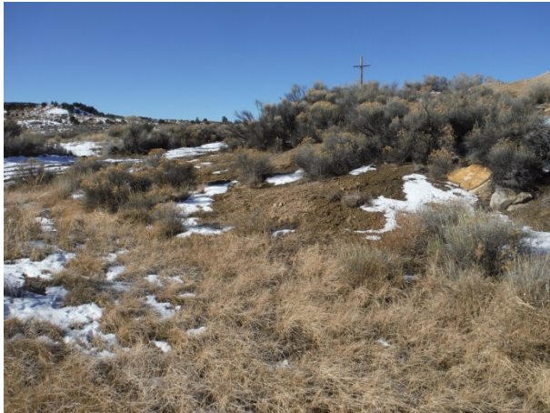
North Diversion Channel, Section NDC-6 Roadway Berm North of Road Crossing (12/14/13)