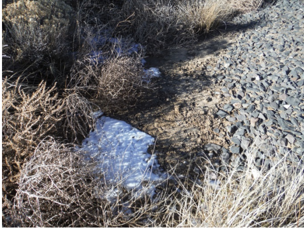
Branch Swale D, Section D-6 Sediment on Bottom of Swale (12/7/13)