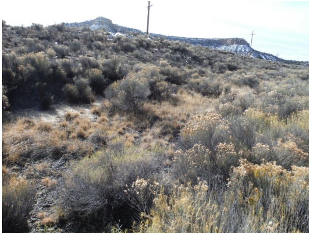
Branch Swale B, Section B-1 Typical Swale Condition (looking SW) (11/27/13)