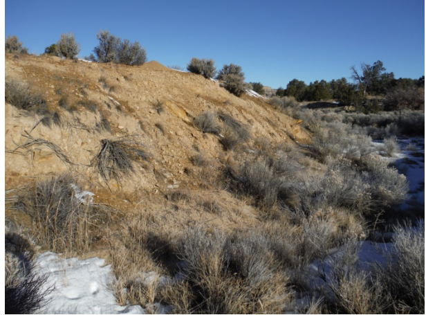
North Diversion Channel, Section NDC-1 Typical Roadway Berm Condition (12/14/13)