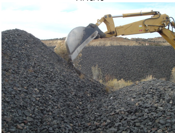
Stockpile 3 Sampling 11/13/13