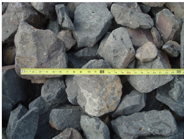
Stockpile 5 11/13/13