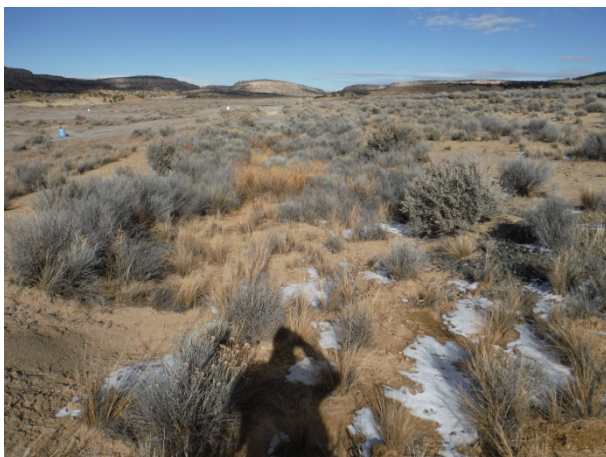
Branch Swale D, Section D-1 Typical Swale Condition (looking NE) (12/7/13)