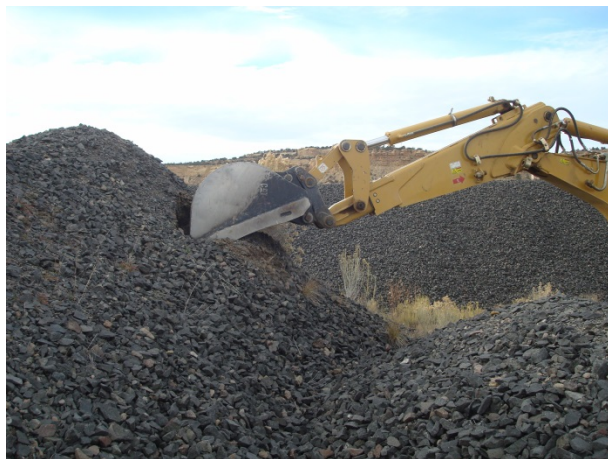
Stockpile 3 Sampling 11/13/13