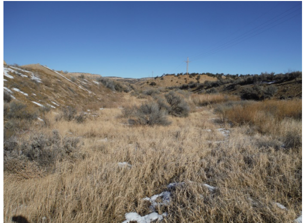
North Diversion Channel, Section NDC-7 Typical Channel Condition (looking N) (12/14/13)