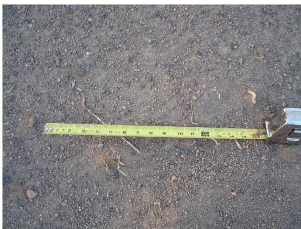
Stockpile 1 11/13/13