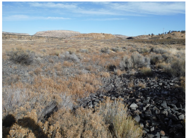
Branch Swale A, Section A-3 Typical Swale Condition (looking N) (11/27/13)