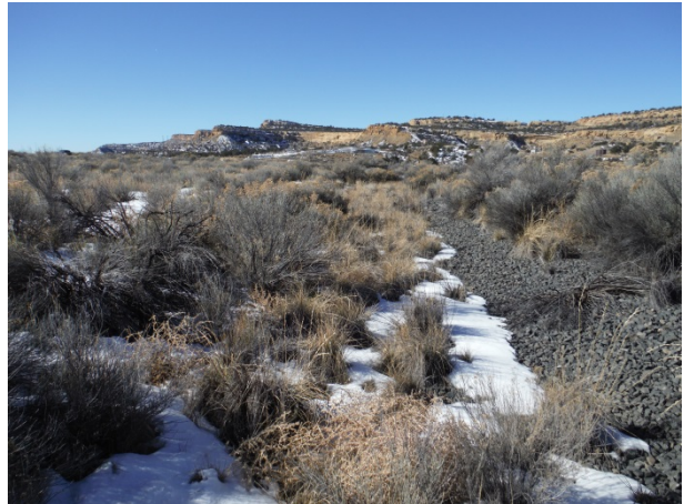
Branch Swale G, Section G-1 Typical Swale Condition (looking W) (12/14/13)