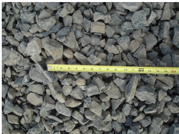
Stockpile 4 11/13/13