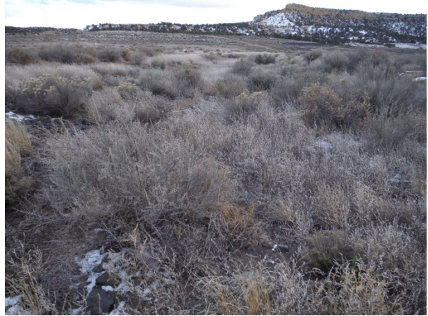
Branch Swale H, Section H-1 Typical Swale Condition (looking SE) (12/7/13)