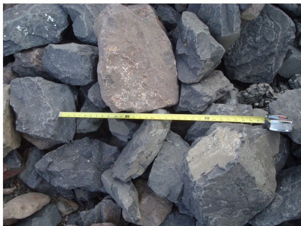
Stockpile 7 11/13/13