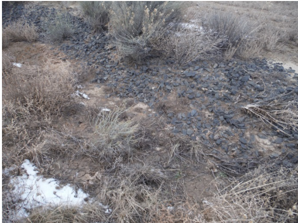
Branch Swale E, Section E-1 Typical Condition Side of Swale (12/7/13)