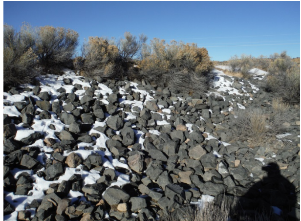
North Diversion Channel, Section NDC-2 Typical Roadway Berm Condition (12/14/13)