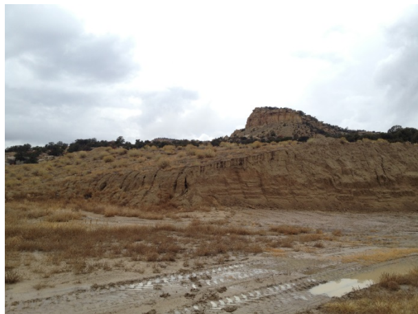
Topsoil Stockpile, South End 11/21/13