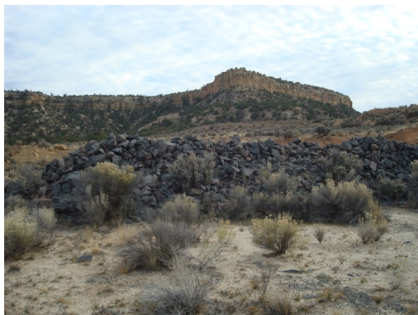
Stockpile 7 11/13/13