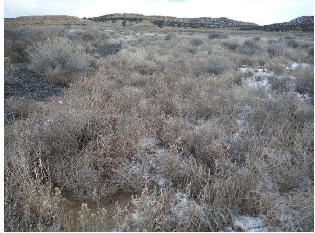
Branch Swale E, Section E-1 Typical Swale Condition (looking E) (12/7/13)