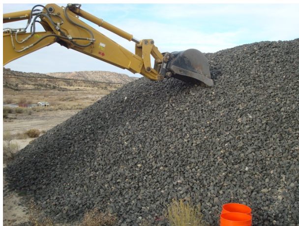
Stockpile 2 Sampling 11/13/13