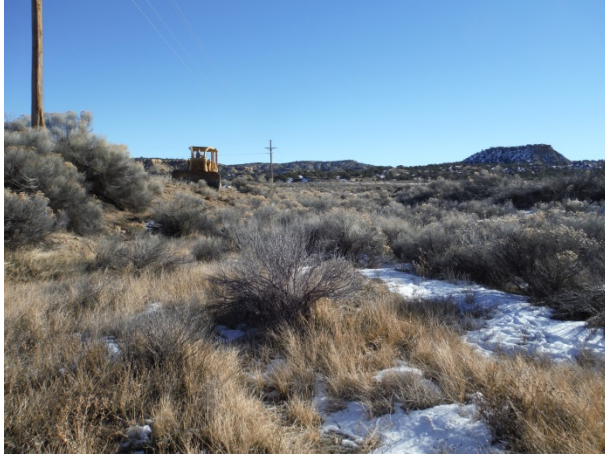
North Diversion Channel, Section NDC-6 Typical Channel Condition (looking E) (12/14/13)