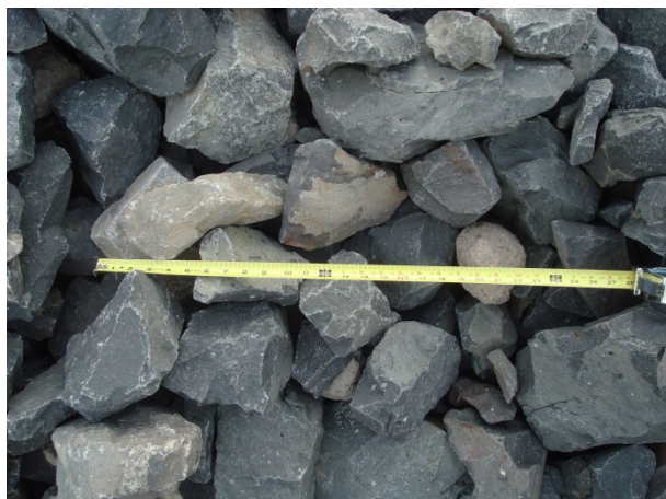
Stockpile 6 11/13/13