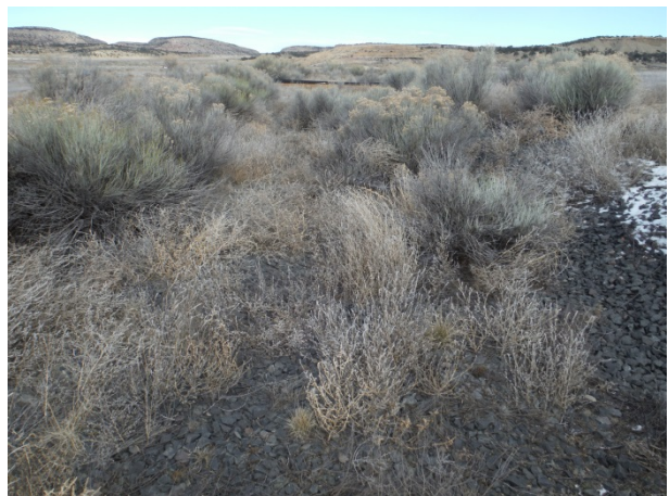
Branch Swale C, Section C-2 Typical Swale Condition (looking N) (12/7/13)