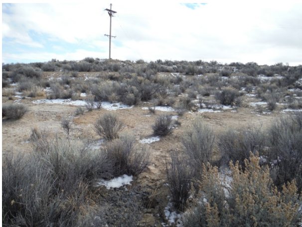
Branch Swale C, Section C-1 Soil Erosion from South Slope (12/7/13)