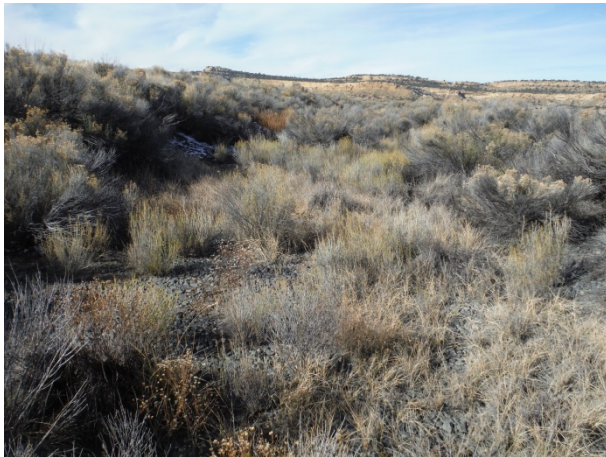
Branch Swale B, Section B-2 Typical Swale Condition (looking W) (11/27/13)