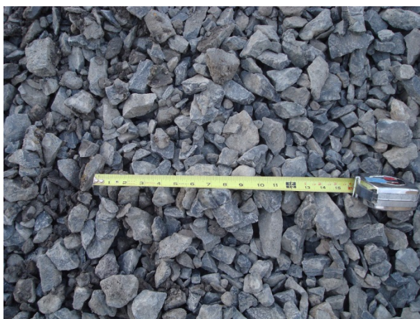
Stockpile 2 11/13/13