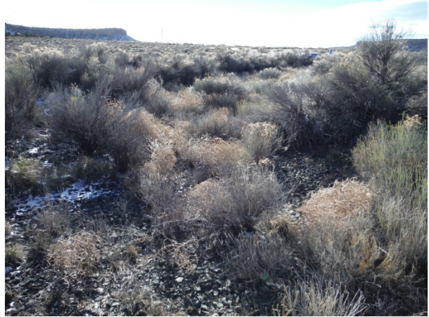
Branch Swale D, Section D-3 Typical Swale Condition (looking SW) (12/7/13)