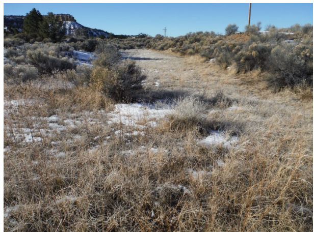
North Diversion Channel, Section NDC-3 Typical Channel Condition (looking S) (12/14/13)