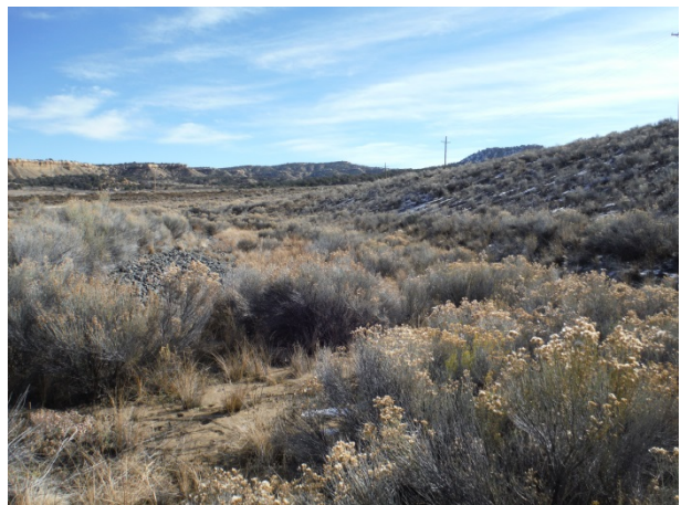
Branch Swale A, Section A-5 Typical Swale Condition (looking W) (12/7/13)