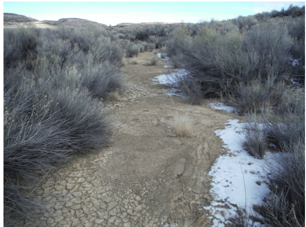
Branch Swale C, Section C-1 Typical Swale Condition (looking N) (12/7/13)