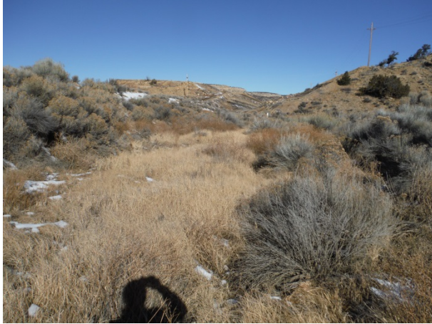
North Diversion Channel, Section NDC-8 Typical Channel Condition (looking N) (12/14/13)