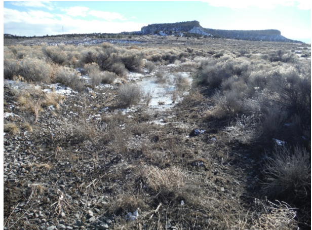
Branch Swale D, Section D-4 Typical Swale Condition (looking S) (12/7/13)