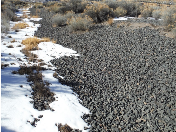
Branch Swale G, Section G-2 Typical Condition of Side of Swale (12/14/13)