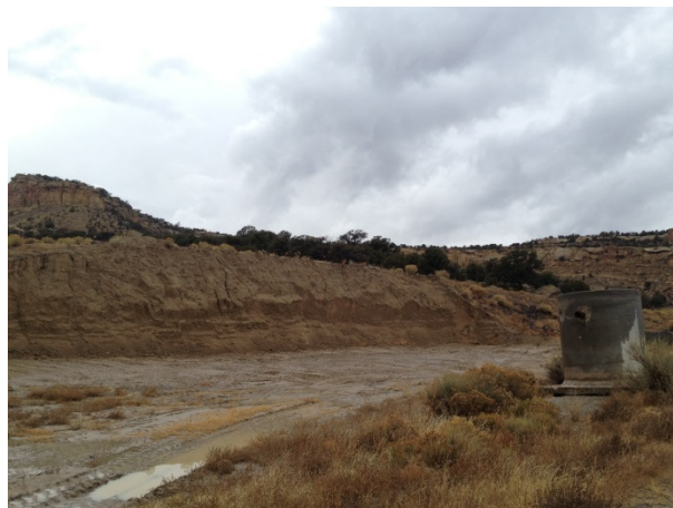
Topsoil Stockpile, North End 11/21/13