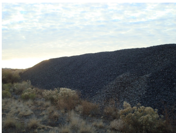
Stockpile 2 11/13/13