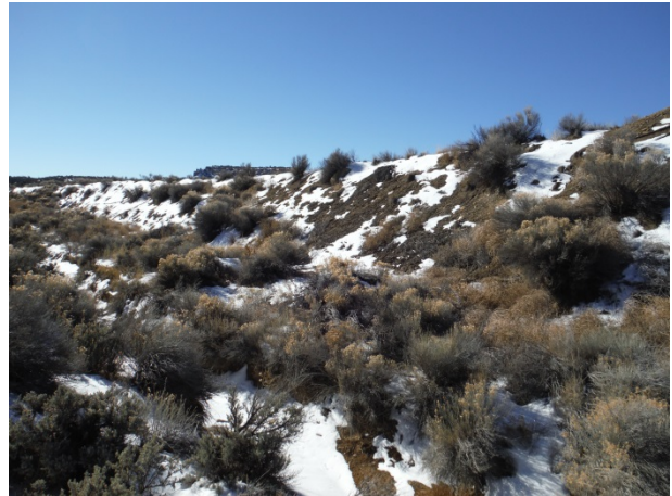
North Diversion Channel, Section NDC-9 Typical Roadway Berm Condition (12/14/13)