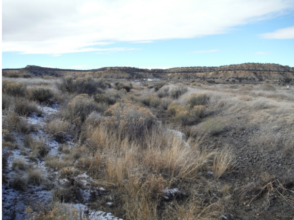
Branch Swale C, Section C-3 Typical Swale Condition (looking W) (12/7/13)