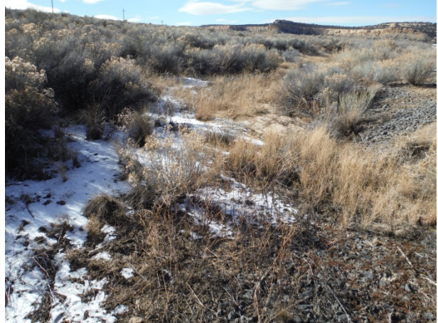
Branch Swale C, Section C-4 Typical Swale Condition (looking SW) (12/7/13)