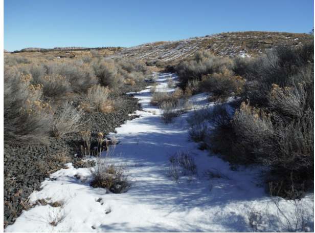
Branch Swale F, Section F-2 Typical Swale Condition (looking E) (12/14/13)