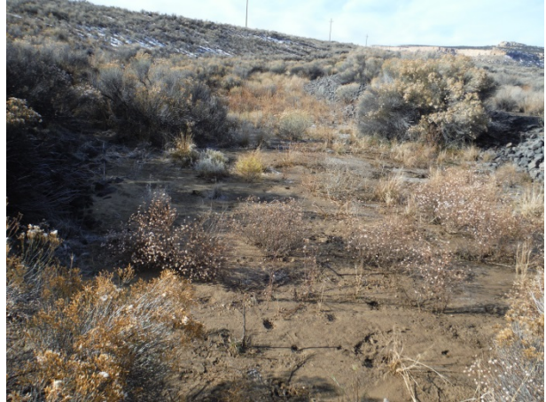
Branch Swale A, Section A-2 Typical Swale Condition (looking SW) (11/27/13)