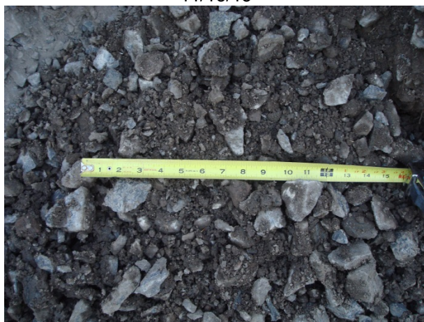
Stockpile 3 11/13/13