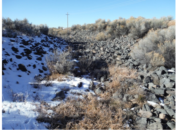
North Diversion Channel, Section NDC-4 Typical Channel Condition (looking S) (12/14/13)