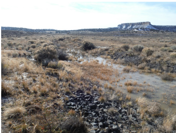
Branch Swale A, Section A-4 Typical Swale Condition (looking SE) (11/27/13)