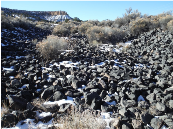
North Diversion Channel, Section NDC-2 Typical Channel Condition (looking S) (12/14/13)