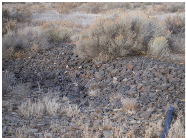
Branch Swale H, Section H-2 Typical Condition of Side of Swale (12/7/13)