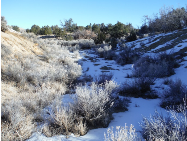
North Diversion Channel, Section NDC-1 Typical Channel Condition (looking N) (12/14/13)