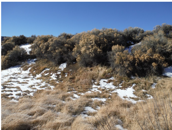
North Diversion Channel, Section NDC-7 Typical Roadway Berm Condition (12/14/13)