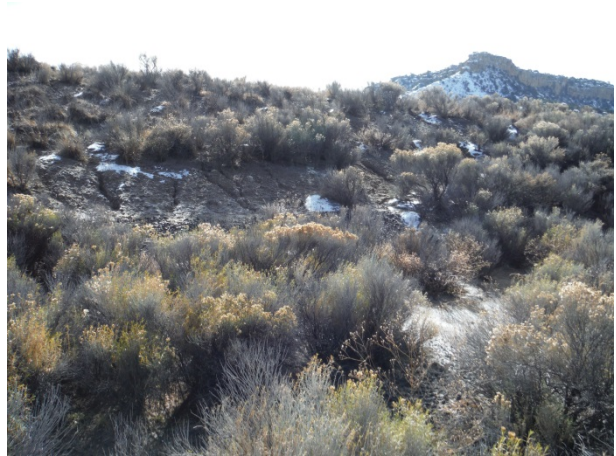
Branch Swale B, Section B-1 Erosion Rills on South Slope (11/27/13)