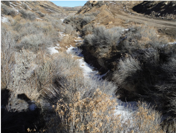
North Diversion Channel, Section NDC-9 Typical Channel Condition (looking N) (12/14/13)