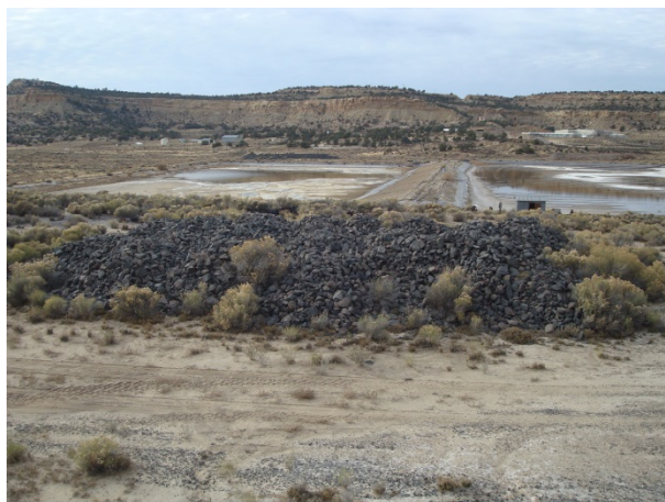
Stockpile 5 11/13/13