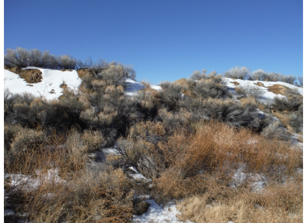
North Diversion Channel, Section NDC-8 Typical Roadway Berm Condition (12/14/13)