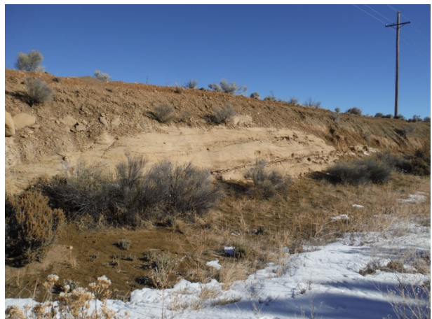
North Diversion Channel, Section NDC-5 Typical Roadway Berm Condition (12/14/13)