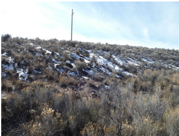
Branch Swale A, Section A-2 Erosion Rills on South Slope (11/27/13)