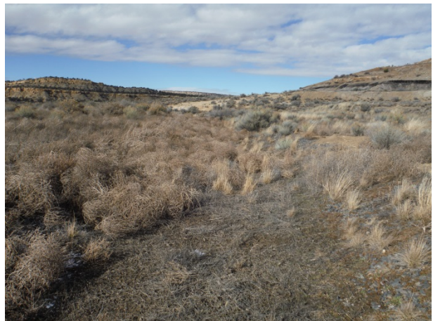
Branch Swale C, Section C-6 Typical Swale Condition (looking NW) (12/7/13)