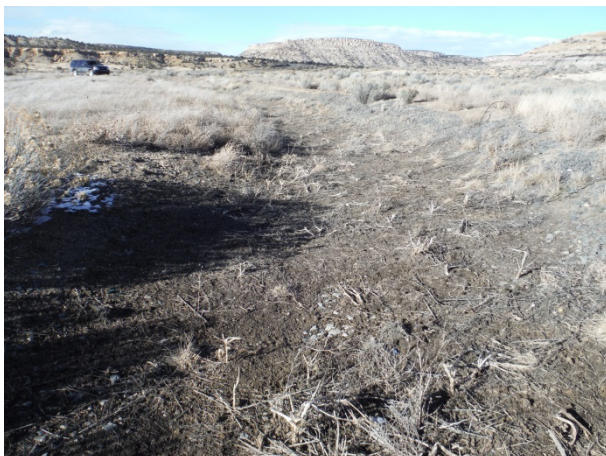
Branch Swale D, Section D-5 Typical Swale Condition (looking NW) (12/7/13)