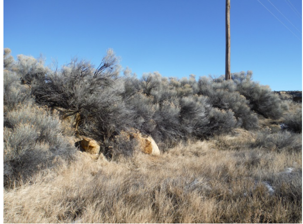
North Diversion Channel, Section NDC-6 Roadway Berm West of Road Crossing (12/14/13)