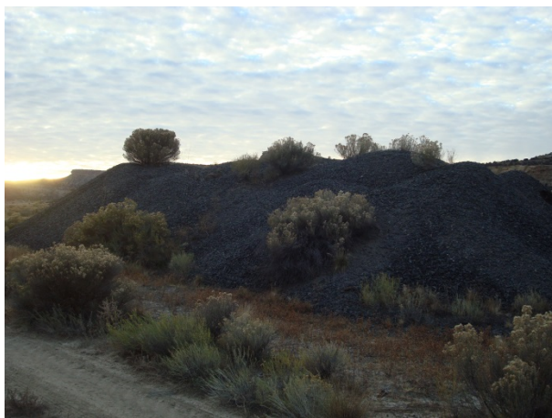
Stockpile 3 11/13/13