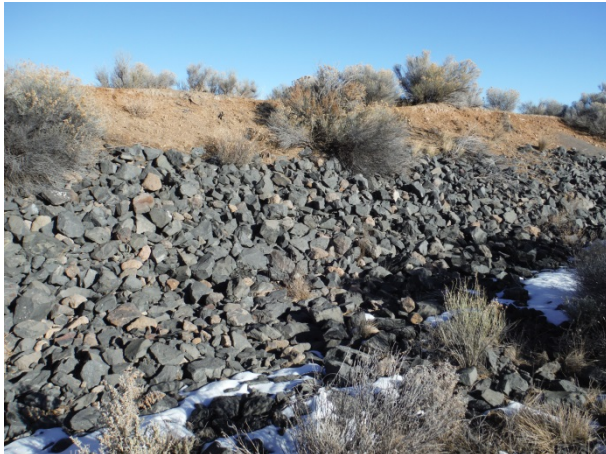
North Diversion Channel, Section NDC-4 Typical Roadway Berm Condition (12/14/13)