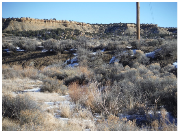
North Diversion Channel, Section NDC-7 Typical East Slope Condition (12/14/13)