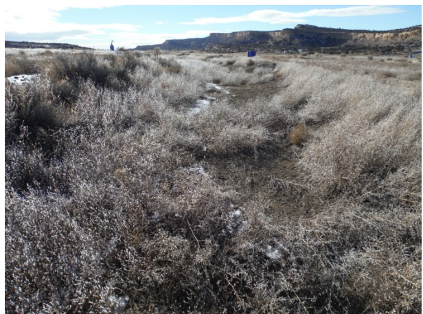
Branch Swale D, Section D-2 Typical Swale Condition (looking SW) (12/7/13)