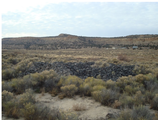
Stockpile 6 11/13/13