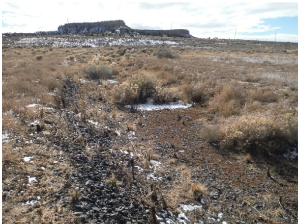
Branch Swale C, Section C-5 Typical Swale Condition (looking SW) (12/7/13)