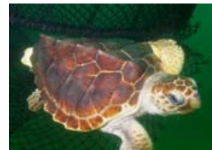
Loggerhead Turtle escaping a net equipped with turtle excluder device (TED) ( Caretta caretta )

Loggerheads were named for their relatively large heads, which support powerful jaws and enable them to feed on hard-shelled prey, such as whelks and conch. The top shell (carapace) is slightly heart-shaped and reddish-brown in adults and sub-