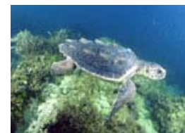
Loggerhead turtle ( Caretta caretta )