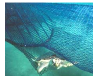
Loggerhead Turtle escaping a trawl net equipped with turtle excluder device (TED) ( Caretta caretta )

Loggerheads face threats on both nesting beaches and in the marine environment. The greatest cause of decline and the continuing primary threat to loggerhead turtle populations worldwide is incidental capture in fishing gear, primarily in longlines and gillnets, but also in trawls, traps and pots, and dredges.