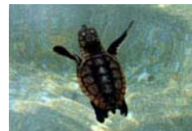
Loggerhead turtle hatchling ( Caretta caretta )