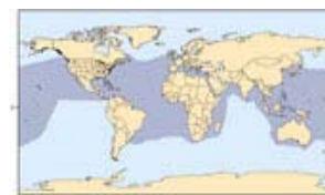
Loggerhead Range Map (click for larger view PDF)

Loggerheads are circumglobal, occurring throughout the temperate and tropical regions of the Atlantic, Pacific, and Indian Oceans. Loggerheads are the most abundant species of sea turtle found in U.S. coastal waters.