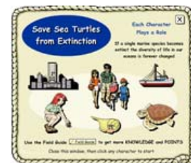
Game: Loggerhead Turtle Quest to Nest (click to play)

• Natural Resource Damage Assessment (NRDA)