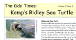
Kids' Times: Kemp's Ridley [pdf]

This video has also served to measure the species' collapse. In the late 1960s, twenty years after the video was filmed, the largest arribada measured was just 5,000 individuals. Between the years of 1978 and 1991, only 200 Kemp's ridleys nested annually. Today the Kemp's ridley population appears to be in the early stages of recovery. Nesting has increased steadily over the past decade.