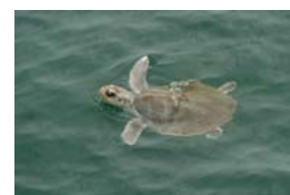
Kemp's Ridley Turtle ( Lepidochelys kempii )

The Kemp's ridley has experienced a historical, dramatic decrease in arribada size. An amateur video from 1947 documented an extraordinary Kemp's ridley arribada near Rancho Nuevo. It has been estimated that approximately 42,000 Kemp's ridleys nested during that single day! The video also provided evidence of Kemp's ridley egg collection. Dozens of villagers are seen on the beach excavating the nests and subsequent interviews have suggested that 80% of the nests, about 33,000, were collected and transported to local villages (Hildebrand, 1963).