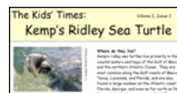
Kids' Times: Kemp's Ridley [pdf]

In the U.S., NOAA Fisheries and the U.S. Fish and Wildlife Service (USFWS) have joint jurisdiction for marine turtles, with NOAA having the lead in the marine environment and USFWS having the lead on the nesting beaches. Both federal agencies, and a number of state agencies, have promulgated regulations to eliminate or reduce threats to sea turtles. In the Atlantic and Gulf of Mexico, We have required measures (for example, gear modifications, changes to fishing practices, and time/area closures) to reduce sea turtle bycatch in mid-Atlantic gillnet, Chesapeake Bay pound net, and southeast shrimp and flounder trawl fisheries.