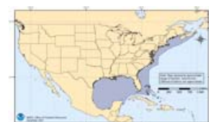
Kemp's Ridley Range Map (click for larger view PDF)