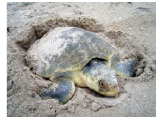
Kemp's Ridley Turtle ( Lepidochelys kempii )

• Natural Resource Damage Assessment (NRDA)