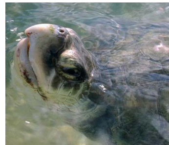
Kemp's Ridley Turtle ( Lepidochelys kempii )

Kingdom: Animalia Phylum: Chordata Class: Reptilia Order: Testudines Family: Cheloniidae Genus: Lepidochelys Species: kempii