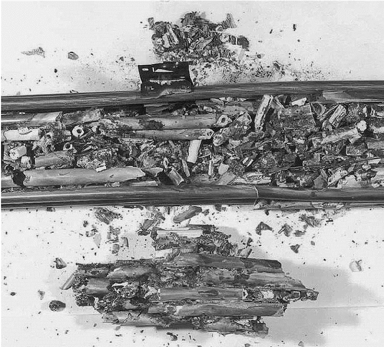
Figure 1. Zirconium Fuel Rod Simulators that Incurred Runaway Oxidation

(2192°F); and to commence in air at lower local fuel-cladding temperatures of 827°C (1520°F) 10 or 900°C (1652°F). 11 ) (See Figure 1.)