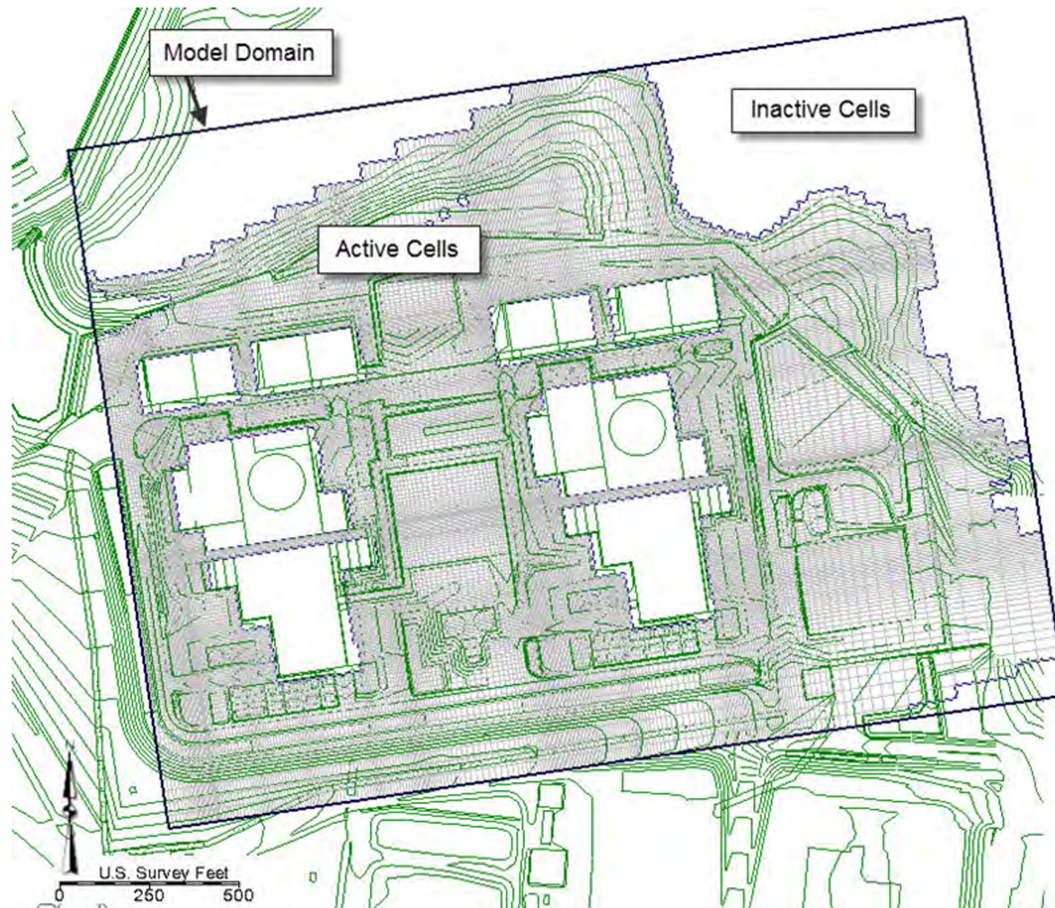
Figure 2.4.12-219 MODFLOW Model Grid - Horizontal Pathway Analysis (Sheet 1 of 2)