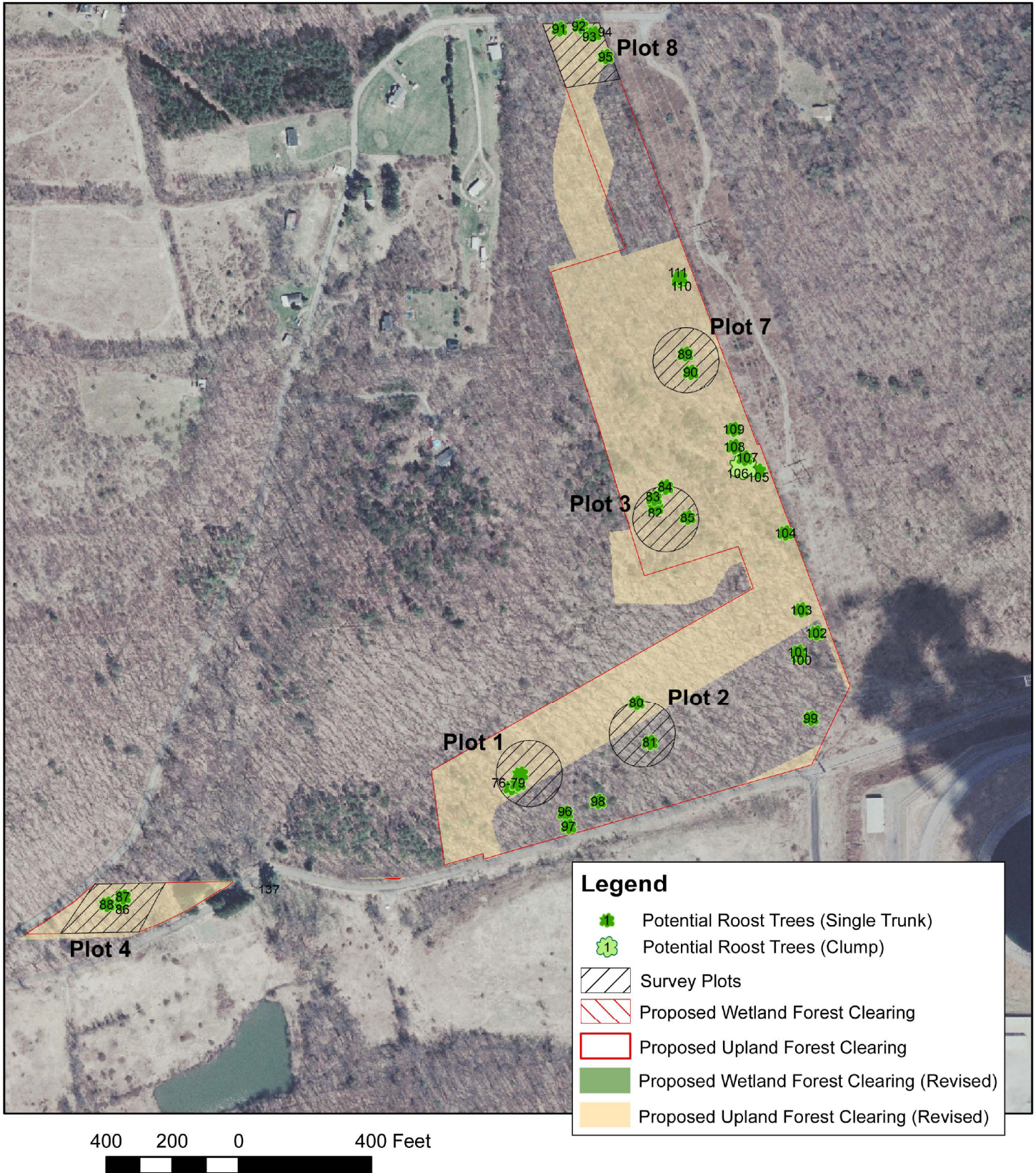
Figure D-4. BBNPP Forest Area 7 Potential Roost Tree Locations