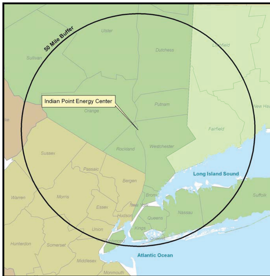
Figure 1.1 US counties within 50-miles of IPEC.