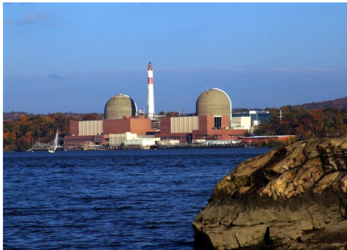
Figure 2: Indian Point Nuclear Power Plant, Buchanan, New York

NRC management and staff provided two occupational training needs assessments in response to Office of the Inspector General (OIG) requests. One of the assessments, an update to an earlier assessment, focused on the Reactor Oversight Process. 6 NRC's implementation of the revised Reactor Oversight Process significantly changed the jobs of the site-based and regional office-based reactor inspectors. A variety of tasks were eliminated while other tasks remained but were modified. In early 2000, a contractor 7 updated the inspector task lists from the existing needs assessment. The updated lists reflected changes to those positions resulting from implementation of the Reactor Oversight Process. This reactor inspector occupational needs assessment was completed in 2001 and has not been formally reviewed since. Completed in 2006, the other needs assessment provided to OIG auditors was for a supervisory curriculum course design (not specifically for safety related training).