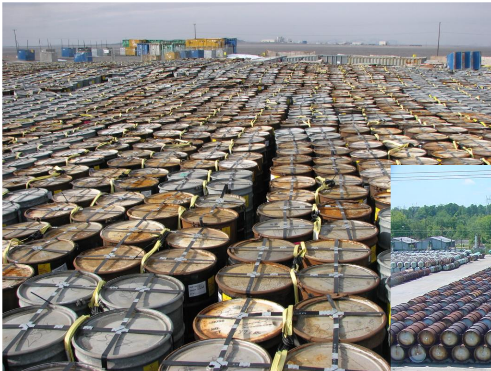
DU trioxide from the Savannah River Site

gaseous diffusion plant DU “deconverted” to oxides