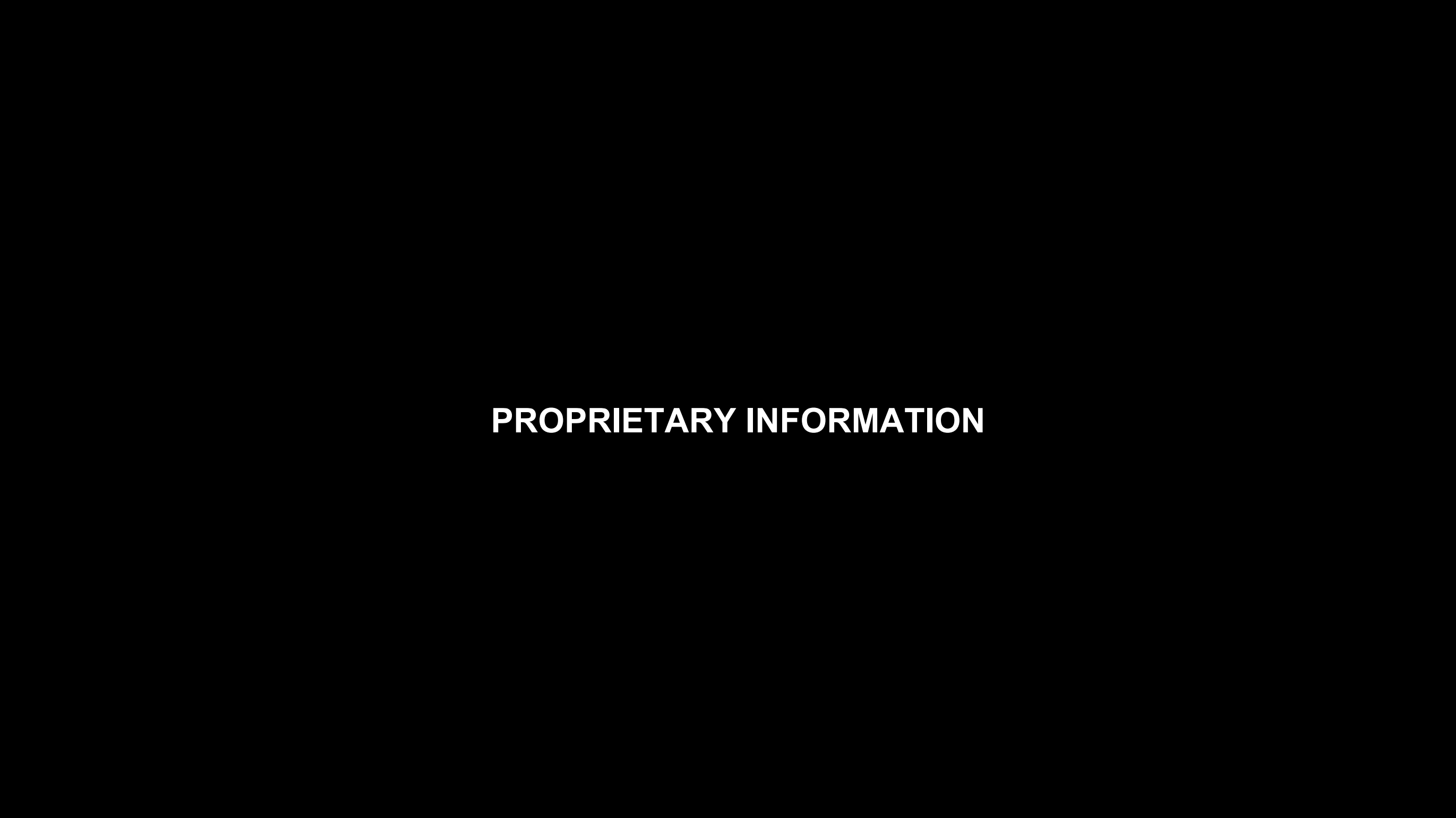
Figure 12.3-72 – Turbine BUilding 3F Floor Level, Area Radiation Monitors, Elevation 27800 mm