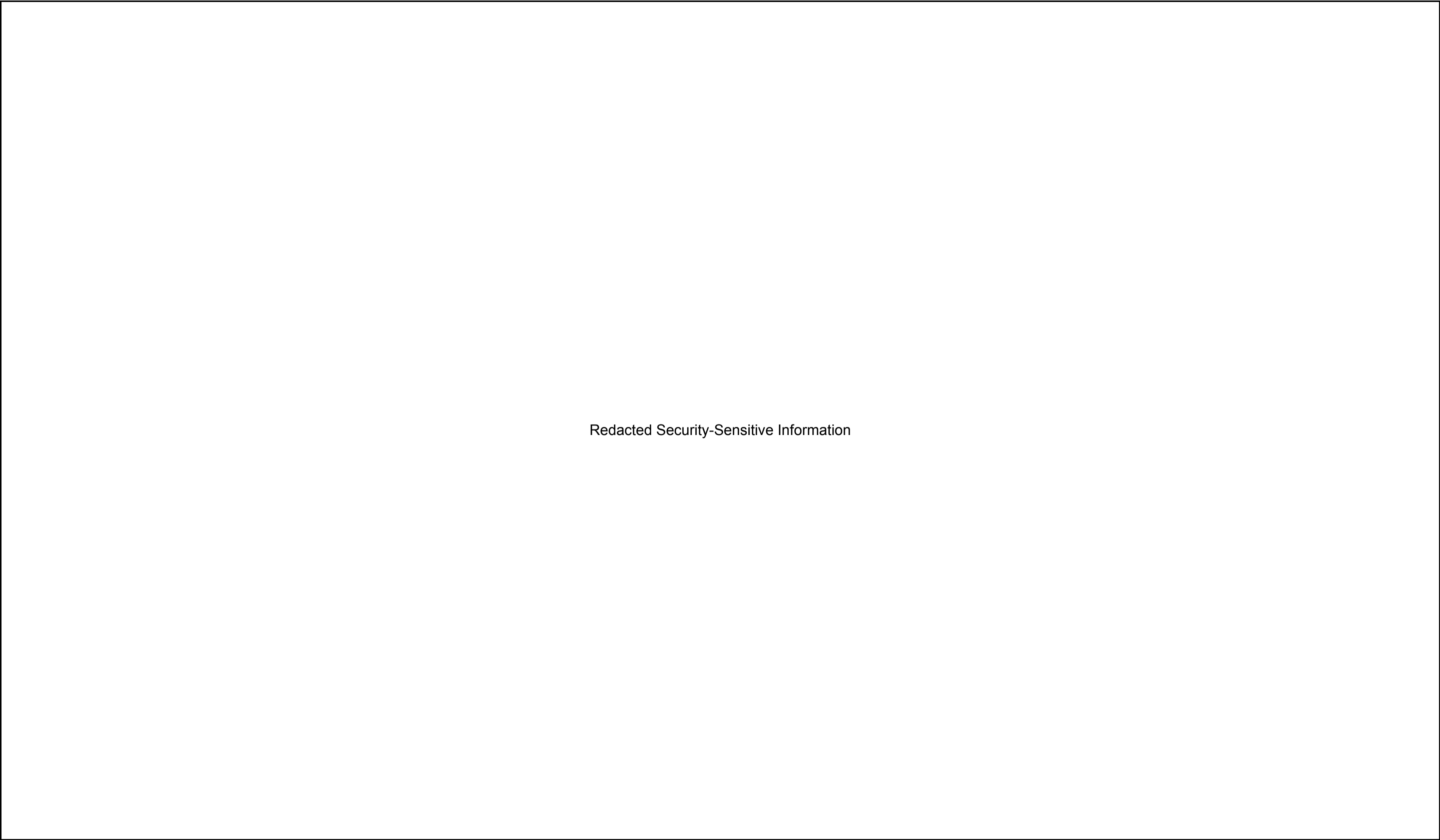
Figure 12.3-69 Turbine Building MB1F Floor Level, Area Radiation Monitors, Elevation 6300 mm