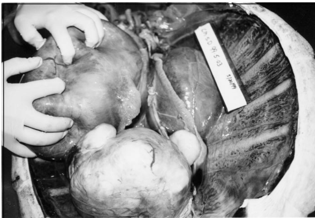
Figure 2. Necropsy of a green sea turtle ( Chelonia mydas ) from Florida's Upper Keys, where minimally-treated effluent injected into deep and shallow aquifers appears to be discharging into nearshore surface waters. The large white mass is a tumor engulfing both kidneys.

There are at least two significant differences between the dispersal/discharge of microbes in effluent via groundwater flow channels and disposal via ocean outfall pipes. The first is the cooler, more stable temperature of groundwater transport of effluent. The second is the potential for longer periods of incubation in the absence of light. Both conditions can