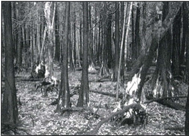
Figure 2. This photo depicts charred remains of pond-cypress in a depressional wetland after the July 4, 1998, wildfire in Flagler County, Florida. As in figure 3, the light areas are Chrysonilia , the conidial state of the fungus Neurospora .