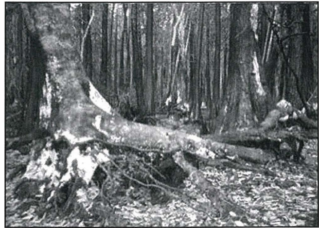
Figure 3. This photograph, also taken shortly after the July 4, 1998, wildfire in Flagler County, Florida, shows the charred remains of pond-cypress (background) and roots of other wetland trees in another depressional wetland.

the Reserve not intended for burning (Brantley 2006). Historically, natural wildfires were ignited by lightning and occurred frequently throughout Florida. Fires are essential for maintaining Florida's natural communities and reducing accumulated leaf litter. Hence, prescribed burns have been used as a management tool to mimic beneficial natural wildfires. Groundwater alterations and resulting hydroperiod alterations have changed the beneficial effects of natural and prescribed fires. Prolonged smoldering and re-ignition are characteristic where the natural hydroperiod is altered by mechanical and/or nonmechanical dewatering of the aquifer system. The artificially lowered water table allows normally saturated organic soils in wetlands and forested hammocks to subside, smolder, and ignite tree roots and trunks (Fig. 2 and 3).