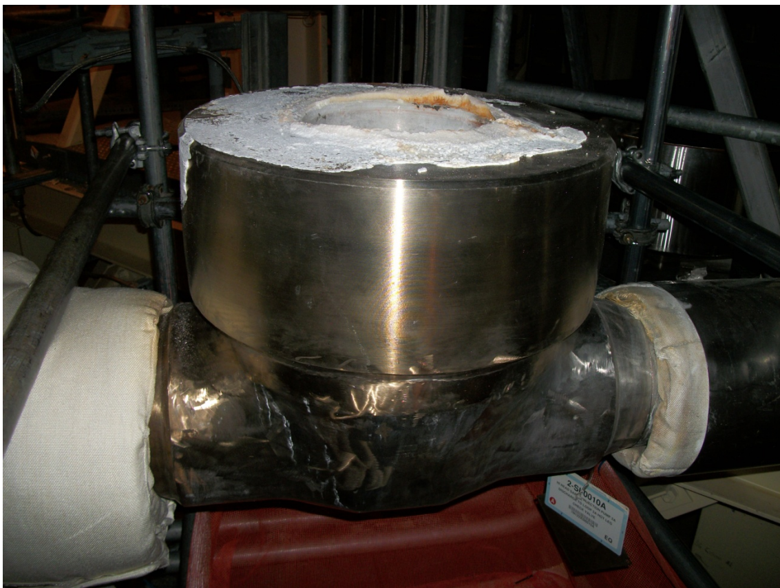
Figure 2: Photo of the enclosure