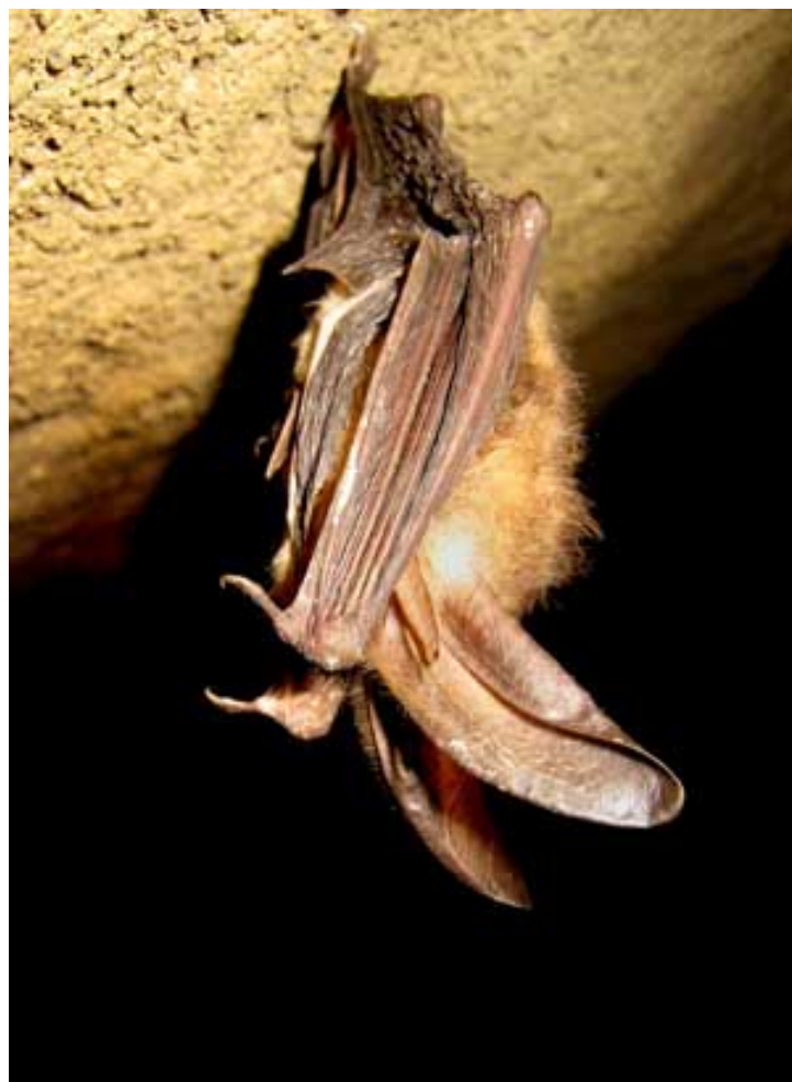
Healthy Virginia big-eared bat in Hellhole, Pendleton County, WV.

Bat Conservation International News release (pdf)