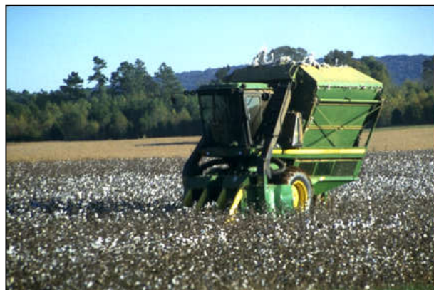
Cotton is a major crop grown in northern Alabama.

The main land use in the study unit is forested land, which covers about 55 percent of the study unit (1992 land cover data from the Tennessee Valley Authority). Additional land uses include row crops and pasture land (41 percent), urban (1 percent), and other land uses (3 percent), such as wetlands, water, and barren land. Row crops occur predominantly along the main stem and small tributaries of the Tennessee River in northern Alabama and along the western edge of the study unit. Cotton, corn, and soybeans are the primary row crops. Confined animal operations are concentrated primarily in northern Alabama.