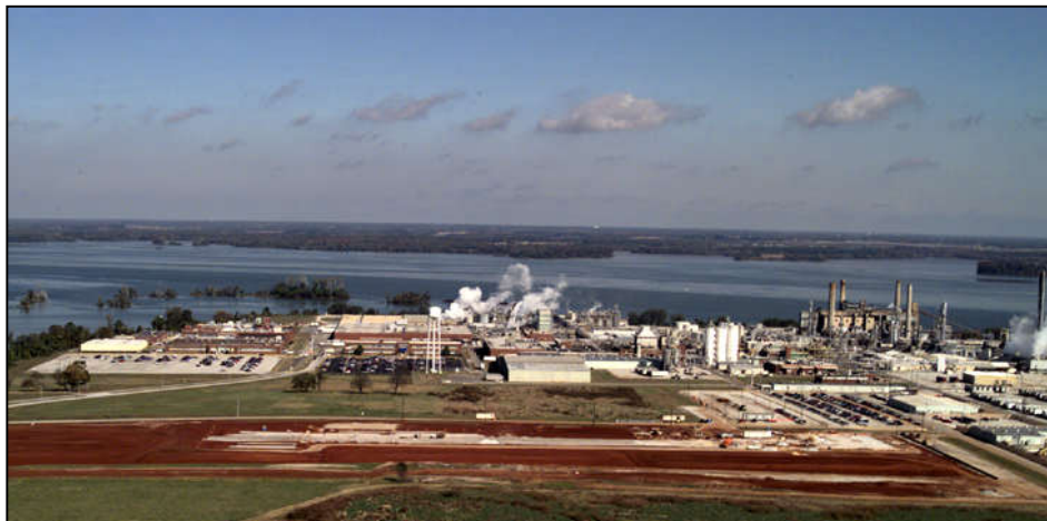
There are numerous industries along the main stem of the Tennessee River in northern Alabama. These industries manufacture and produce a variety of products, such as missiles and rockets, electronics, pulp and paper, synthetic fiber, terephthalic acid, alkalis, chlorine, steering gears, polyester film, refrigerators, aluminum, and nickel-plated foam.

The mean annual discharge at the outlet of the Tennessee River near Paducah, Kentucky, is 65,600 cubic feet per second ( \text{ft}^3/\text{s} ). The mean annual discharge of the Tennessee River at the upstream boundary of the study unit at Chattanooga, Tennessee, is 35,900 \text{ft}^3/\text{s} , thus the lower Tennessee River Basin contributes about 29,700 \text{ft}^3/\text{s} on an annual basis. The two largest basins in the study unit are the Duck River Basin, draining 2,700 \text{mi}^2 , and the Elk River Basin, draining 2,250 \text{mi}^2 . The combined mean annual discharge of the Duck and