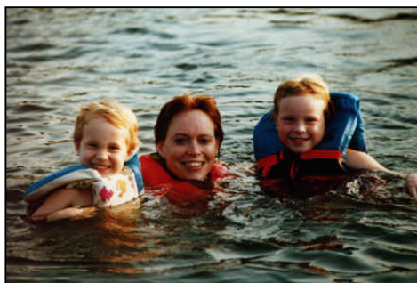
Nine reservoirs in the study unit are used extensively for water recreation.

The main stem of the Tennessee River is highly regulated with few free-flowing stream reaches. Six major reservoirs constructed primarily by the Tennessee Valley Authority from the 1920's through the 1940's for purposes of power generation, navigation, and flood control are located along the lower Tennessee River. Three additional reservoirs are located on major tributaries. Reservoirs along the Tennessee River are also used extensively for drinking water and recreational activities such as fishing, swimming, and boating. Water-resource managers and the public are extremely interested in maintaining the high quality of these reservoirs.