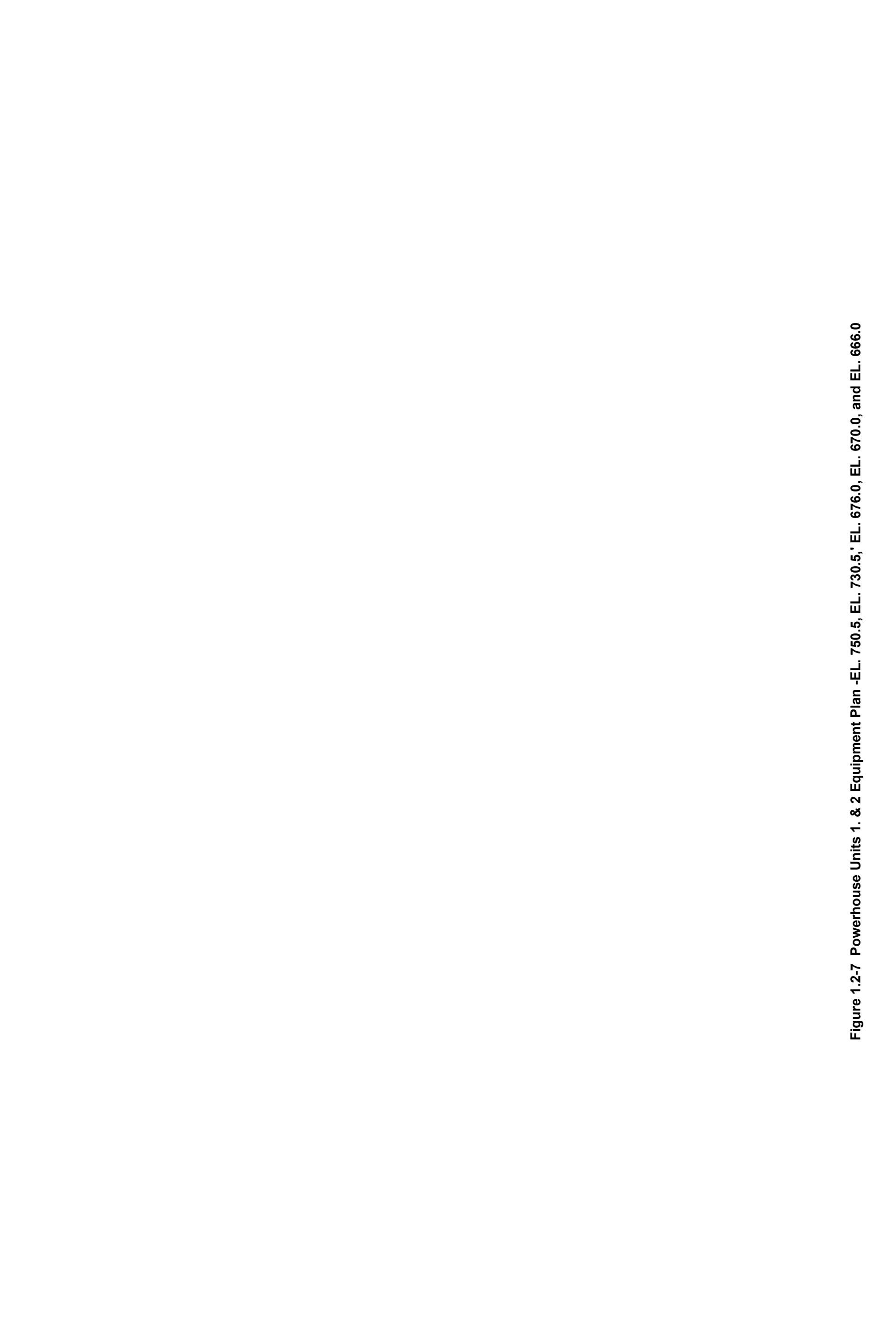
Figure 1.2-7 Powerhouse Units 1. & 2 Equipment Plan -EL. 750.5, EL. 730.5,' EL. 676.0, EL. 670.0, and EL. 666.0