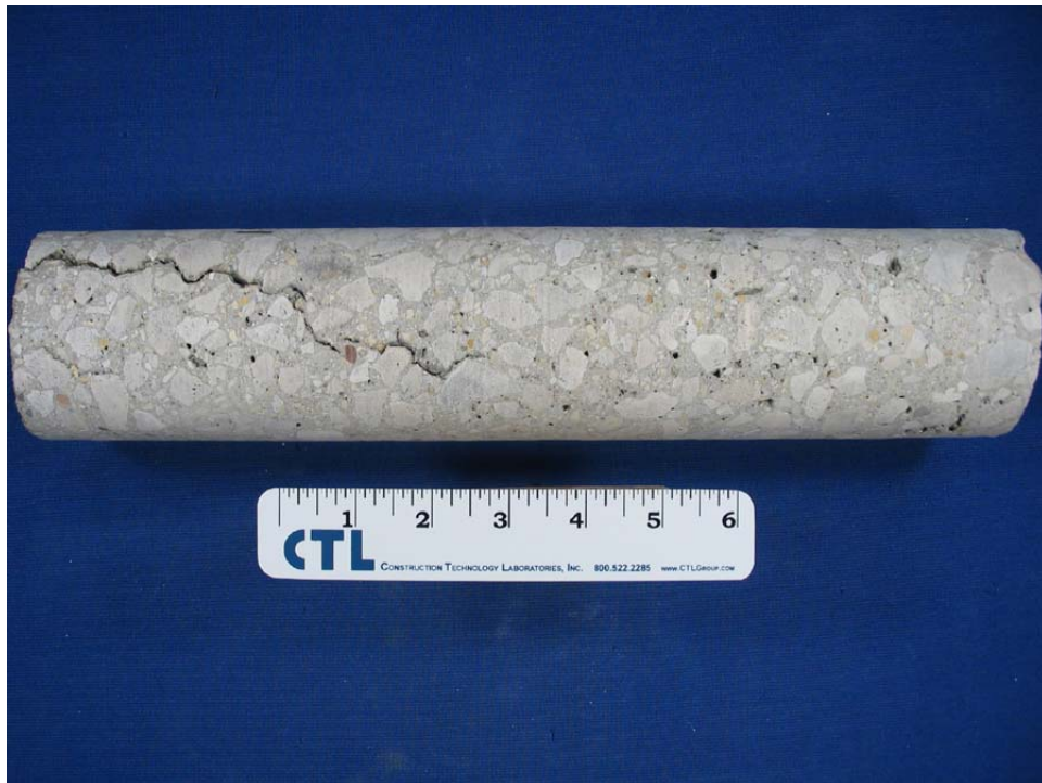
Fig. 2 Side view of core sample, as received. Top surface is to the left.