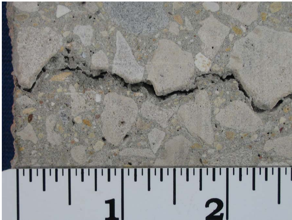
3b. Cored cylindrical surface