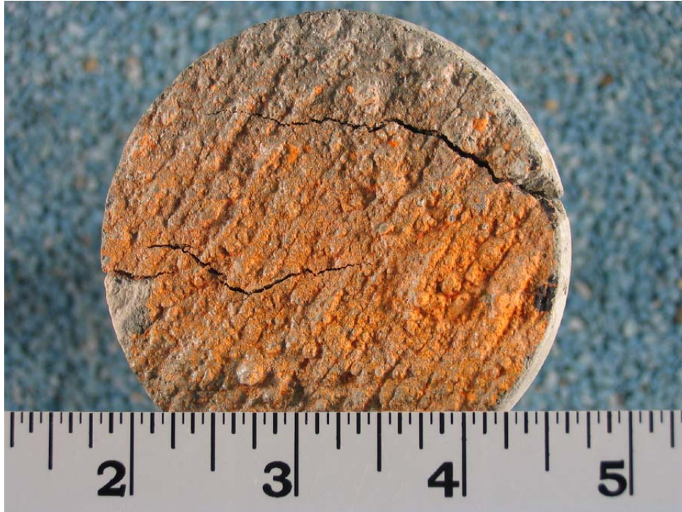
Fig. 1 Top surface of core sample, as received.