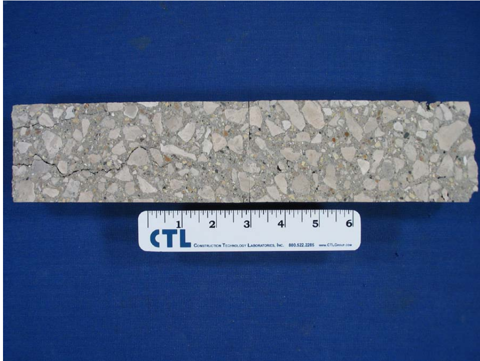
Fig. 4 Lapped cross-section of the core sample showing the general appearance and condition of the concrete. Top surface is to the left.