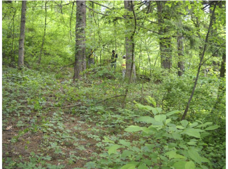
GAI Site 13: Overview Showing Line of Pine Trees on Slope, Facing North