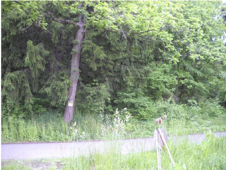
GAI Site 13: Overview from Beach Grove Rd Showing Pine Trees, Facing Northeast

We encourage the inclusion of as many illustrations as possible.