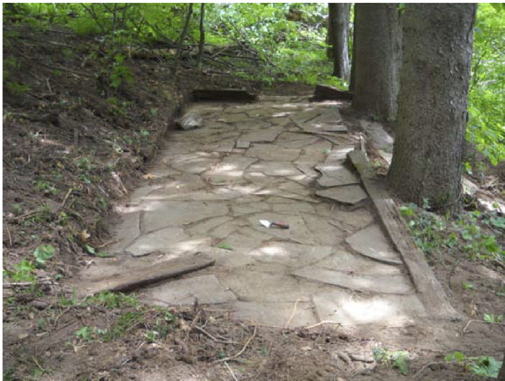
GAI Site 13: Feature 1 (Flagstone Patio), Facing East