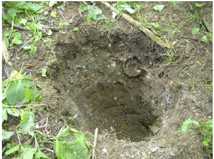
GAI Site 13: Feature 2 (ash/refuse pit) in shovel test, Facing North