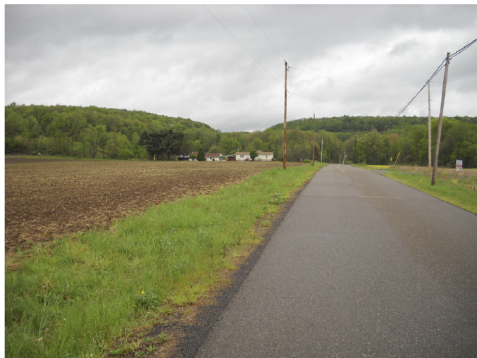
Photograph 1. Western Section: Overview of Cultivated Field (Lot 41) West of North Market Street, Facing North

The Second Supplemental project area consists of 13 lots, predominantly representing new project localities. It includes a series of nine lots north of the initial BBNPP project area (the Northern Section—Lots 54, 6, 6A, 6B, 7, 8, 31, 23, and 0), two lots to the west (the Western Section—Lots 3 and 41), and one lot to the south (Lot 93D), as well as the previously-surveyed Rail Spur Corridor, which was reevaluated due to a redefinition of proposed project impacts (Photographs 1 and 2). The project area identified by AREVA also encompasses the 39-acre (15.7 hectare) previously-surveyed Switchyard 2 parcel (located within portions of Lots 7, 8, 31, 23 and 0 in the Northern Section) which was excluded from further investigation. Accordingly, GAI conducted Second Supplemental Phase Ib investigations of an approximately 176-acre (71-hectares) area for the proposed BBNPP Power Block Relocation. Proposed construction activities will result in both temporary and permanent impacts (e.g., grading, fill, construction lay down, parking, buildings, and roadway construction) within portions of the supplemental project area.