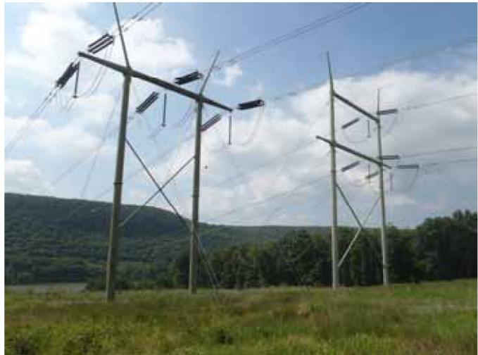
Photograph 1. Transmission Corridor in Area 13 East (Excess Cut Disposal Area), Facing Southwest

The Third Supplemental project area consists of five parcels including Area 1, Area 7 North, Area 12, Area 13 East (Excess Cut Disposal Area), and Area 14 (Photographs 1, 2, and 3). Area 12, Area 13 East, and Area 14 occupy upland settings near the south edge of the BBNPP project area. Area 13 East, situated between US Route 11 and the Susquehanna River, is a largely wooded parcel crossed by an existing transmission corridor and bordered by previously-surveyed Lots 93 D and 93 F. Area 14 includes a residential lot bordering the north edge of US Route 11, as well as a section of this roadway; it lies east of the transmission corridor, adjacent to previously-surveyed Lot 93D. Area 12 consists of a section of US Route 11, west of the transmission corridor. Area 1 and Area 7 North are both located on the low terrace/floodplain of the Susquehanna River in the northeast portion of the BBNPP project area. Area 1 consists of a portion of a paved access road adjacent to the south edge of previously-surveyed Area 7, while Area 7 North borders the northwest edge of this test area. Proposed construction activities will result in both temporary and permanent impacts (e.g., timbering, grading, fill, construction lay down, and roadway construction) within portions of the supplemental project area.