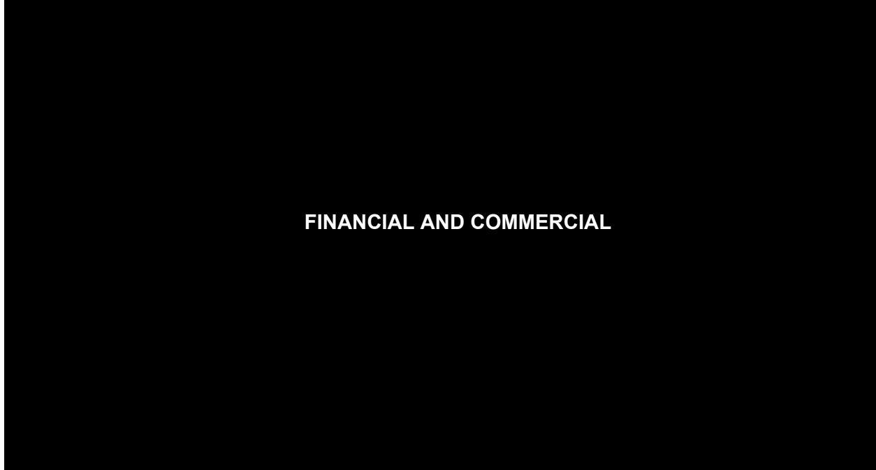
Table 1.3-1 Projected Total Project Costs for STP Units 3 and 4 (Proprietary) [s5]