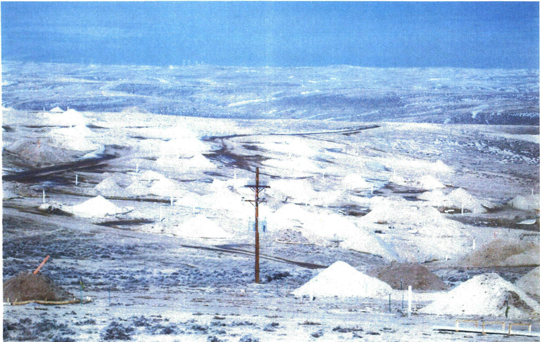
Figure 2 MU-10 wellfield development; topsoil stockpiles placed away from drilling activities and clearly marked, routes for vehicle use are clear, areas without disturbance can be identified, sediment control placed around stockpiles