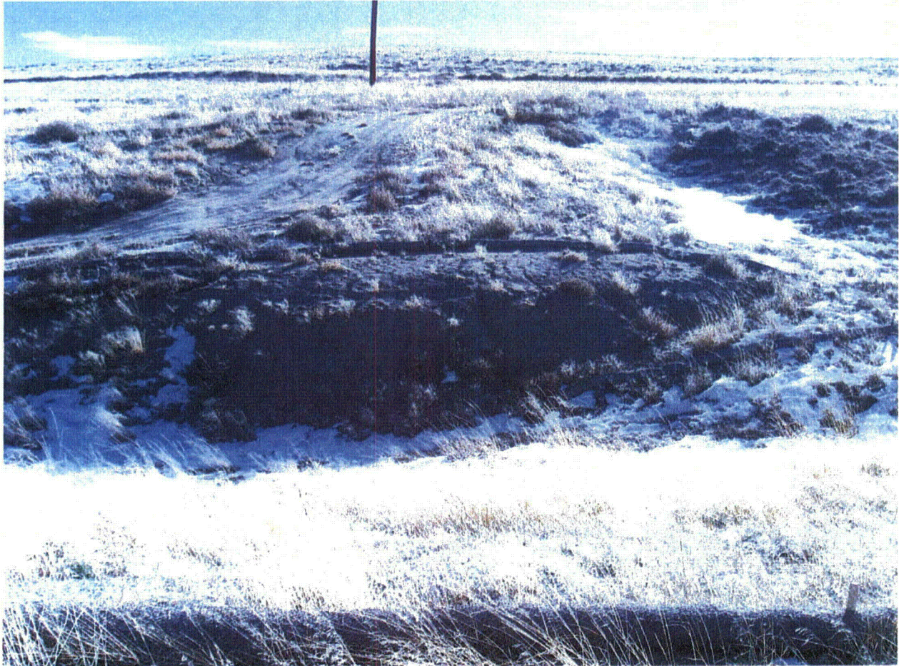
Figure 1 South slope of drainage in MU-9; straw waddles used to control sedimentation; steep slope without vegetation likely to continue to erode