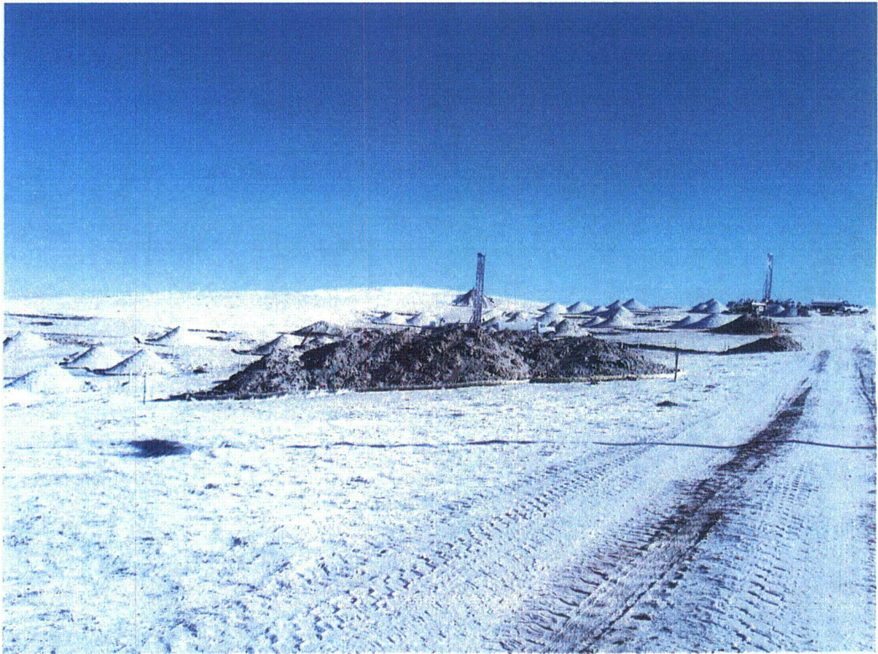
Figure 3 MU-10 development drilling, view of road used to access drill sites, undisturbed area topsoil stockpile with straw waddle protection at base of pile