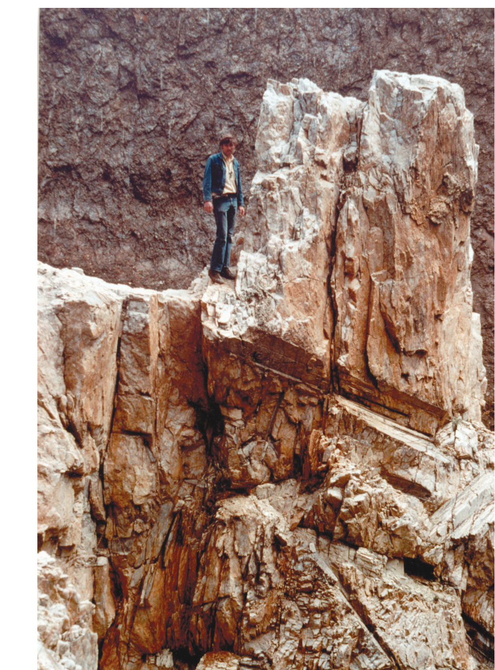
Article coverages and a PDF for this map are available at http://pubs.usgs.gov