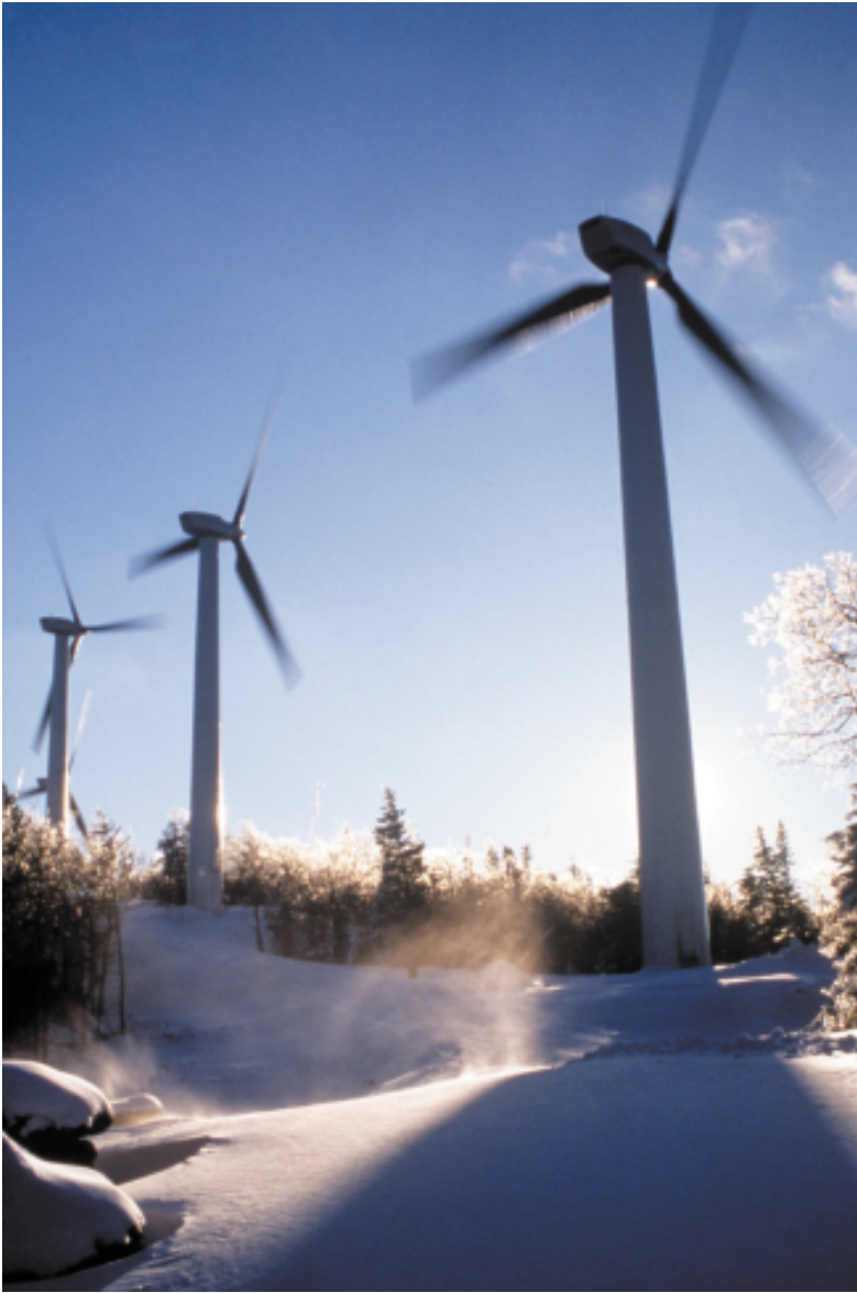
Prepared by the NWCC Siting Subcommittee August 2002