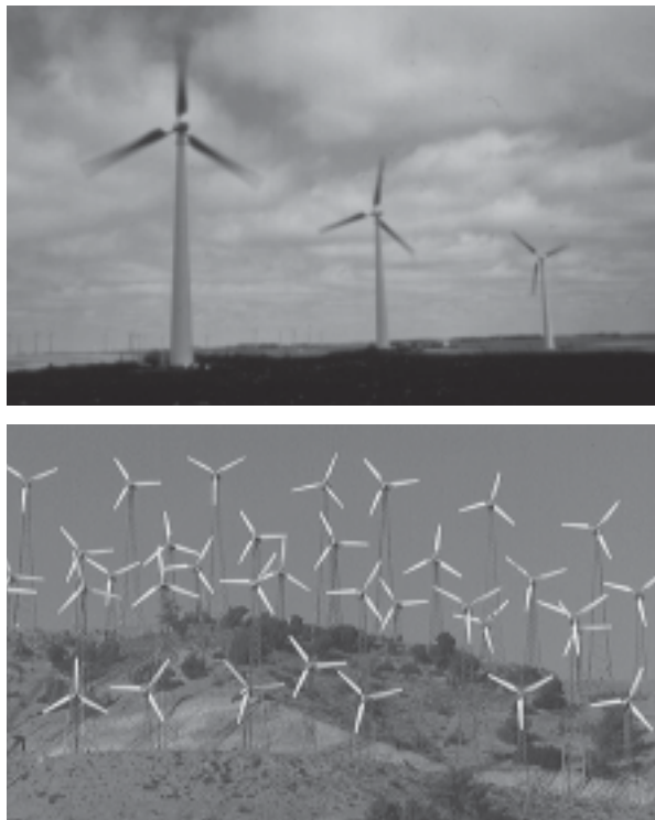
Figure 9. Compare the visual effect of widely-spaced turbines at a wind facility in Lake Benton, Minnesota (top) with the visual impact of a more densely-spaced array in California's Tehachapi Pass (bottom).

als; and non-functional turbines that are awaiting repair or removal, or have been disposed of on-site.