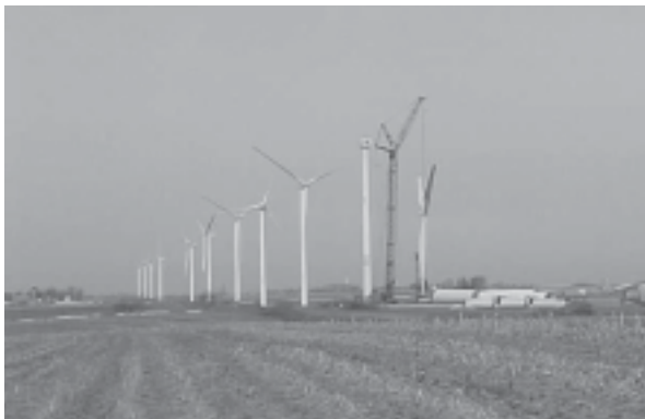
Figure 6. A large crane is used to raise a rotor into position.

Whether the permitting jurisdiction is state or local, wind projects may be subject to local and state environmental policy acts. These laws generally adhere closely to the language of the National Environmental Policy Act (see below). The content requirements of these laws parallel those of federal law, except where specific language narrows the scope of the impact statements.