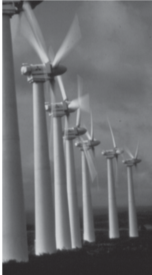
Figure 3. Tubular towers in a linear array in South Point, Hawaii.

According to AWEA, today's large wind turbines produce as much as 120 times the amount of electricity as early turbine designs with operations and maintenance (O&M) costs that are only modestly higher, thus dramatically cutting O&M costs per kWh. Improvements in turbine technology and maintenance programs have produced highly reliable, efficient machines. According to AWEA, the turbines used in the early 1980s were available for operation 60% of the time. Today's state-of-the-art wind turbines have an availability rating averaging 98% (NREL, 1999).