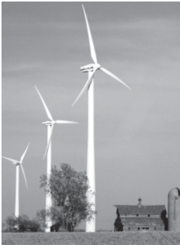
Figure 2. Today's utility-scale (900 kW) wind turbines feed clean energy to utility grids from rural areas.

wind, in front of the generator and tower. The blades on “downwind” turbines are located behind the generator and tower as viewed from the direction of the prevailing wind. Increasingly rare, but still occasionally seen, are the Darrieus (or “egg-beater”) wind turbines, whose rotors spin about a vertical axis. New turbine manufacturers enter the market from time to time with a variety of other designs, but to date, none of these machines has achieved significant commercial sales.