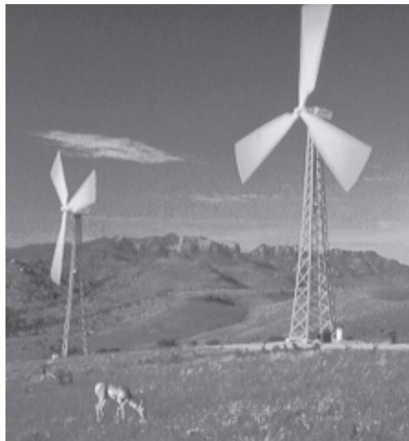
Figure 8. Unconcerned with the rotating blades, a Pronghorn Antelope grazes near these wind turbines in Fort Davis, Texas.

Site topography and the layout of access roads will affect the extent of vegetation disturbance and loss. Construction in steep areas can produce greater disturbance because these facilities require more extensive "cut and fill" as well as longer, more complex road systems. The establishment of invasive, weedy (noxious) plant species that thrive in disturbed areas may compound these losses. These