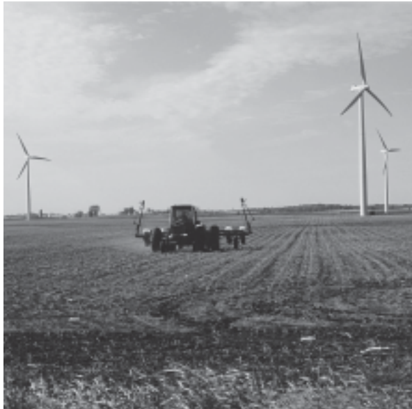
Figure 7. Agriculture is one example of a wind energy-compatible land use. Here a farmer plows the Earth and will raise crops almost to the foot of the turbines.

other sources in the area of the project, or to provide sound levels associated with common activities and situations (see Table 3.1). For regulatory purposes, noise limits often are specified at the nearest receptor (property line or residence) to the noise source, or at a given distance from the source.