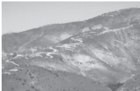
Figure 10. Roads on slopes can have a distinct visual impact, even from a great distance.

Developing an area for energy generation facilities changes site and surrounding area runoff and drainage characteristics and may adversely impact resources on and off-site. Uncontrolled runoff from construction sites can cause short-term increases in turbidity and siltation in nearby watercourses. Deposition of this sediment in nearby watercourses may adversely affect sensitive habitats, contribute to flooding, induce stream bank erosion, and alter downstream flow patterns. The costs associated with removing sediment from waterways, culverts