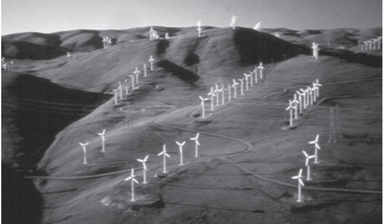
Figure 1. Rows of wind turbines in the Altamont Pass, sited to take advantage of strong summer winds.