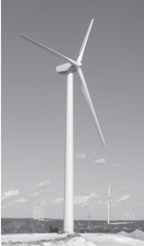
Figure 5. A large 1.5-MW wind turbine towers over a service car in Trent Mesa, Texas. The hub height for this turbine model varies from 65 to 80 meters.