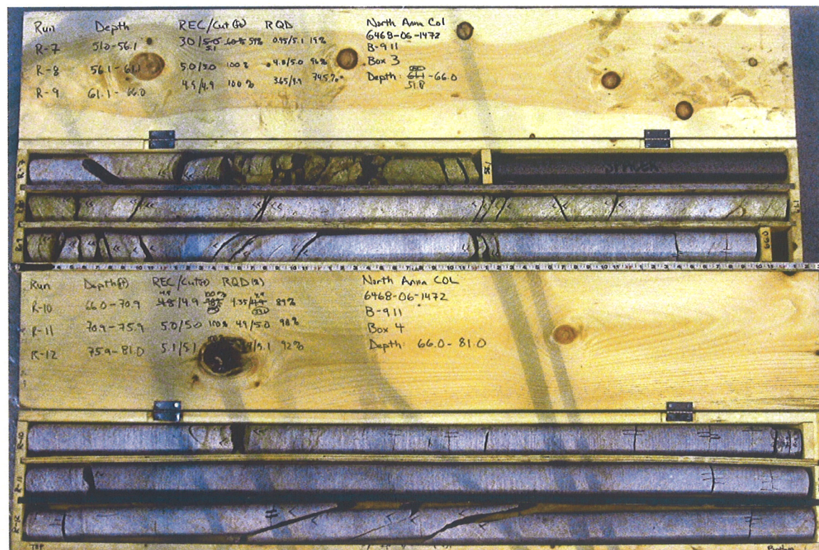
B-911 - Box 3