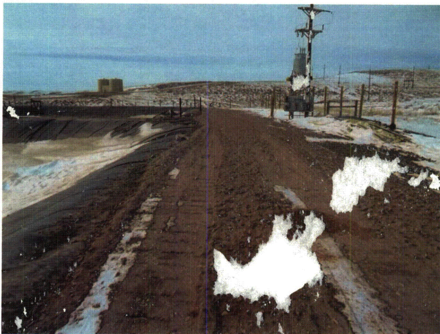
North side of pond looking West