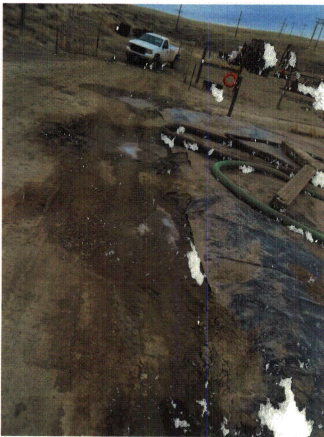
North side of pond looking East