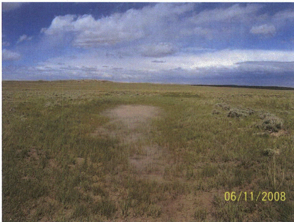
Photo 62 - WL-27a. Emergent wetland in Sage Creek Tributary 4 S. Looking northeast.