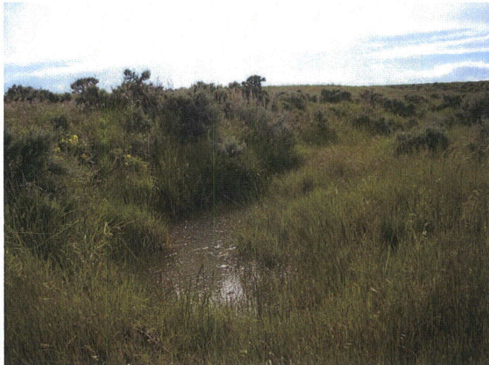
Photo 58 - WL-21e. Emergent wetland in Sage Creek Tributary 4 NW. Looking west.