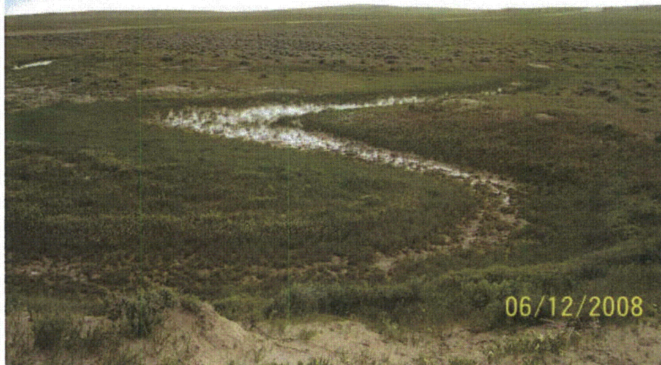
Photo 66 – WL-29dd. Emergent wetland in Sage Creek Tributary 4 S. Looking northwest.