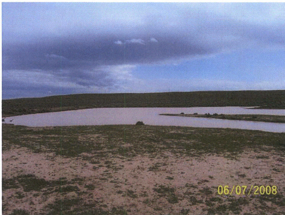
Photo 92 - WB-98. Diked waterbody in Sage Creek Tributary 4W. Looking southeast.