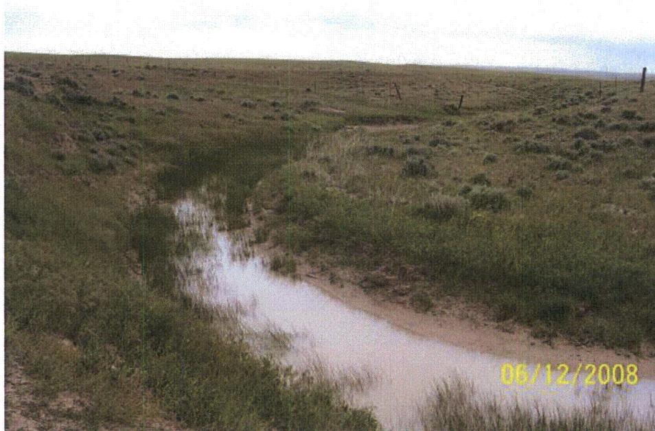
Photo 68 – WL-32a. Emergent wetland in Sage Creek Tributary 4. Looking northeast.