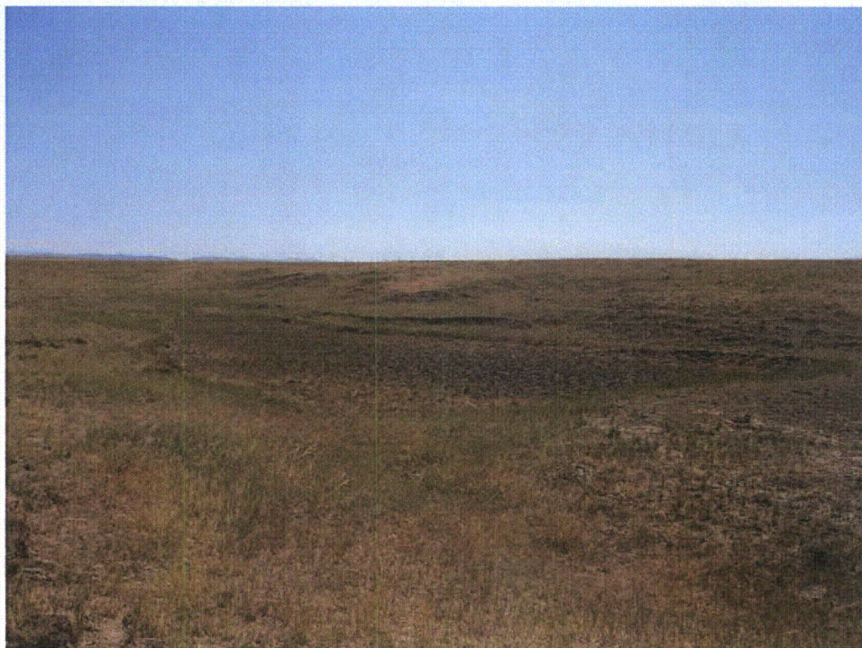
Photo 82 – WL-43a. Emergent wetland in Sage Creek Tributary 6. Looking southwest.