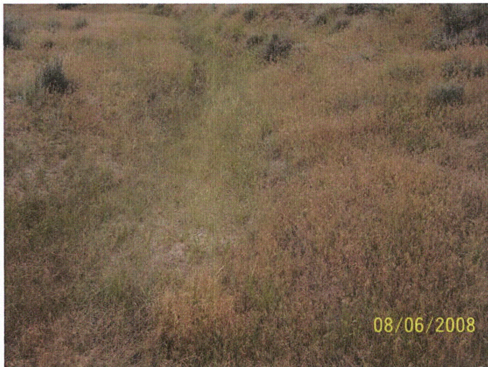
Photo 79 – WL-41c. Emergent wetland in Sage Creek Tributary 7. Looking south.