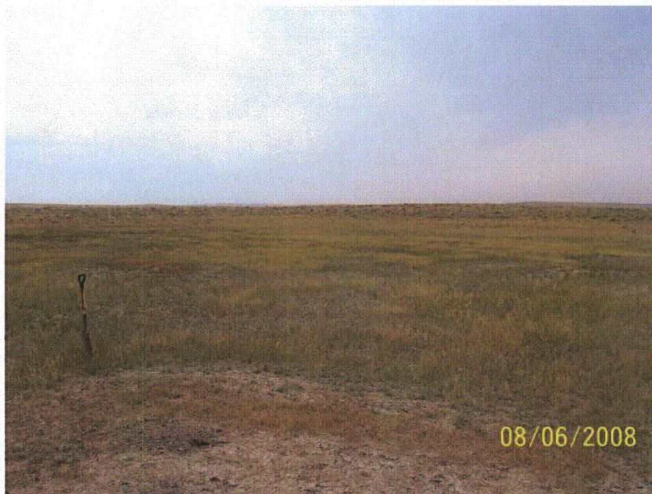
Photo 81 – WL-42. Isolated depression. Emergent wetland in Sage Creek Tributary 7 drainage area. Looking east.