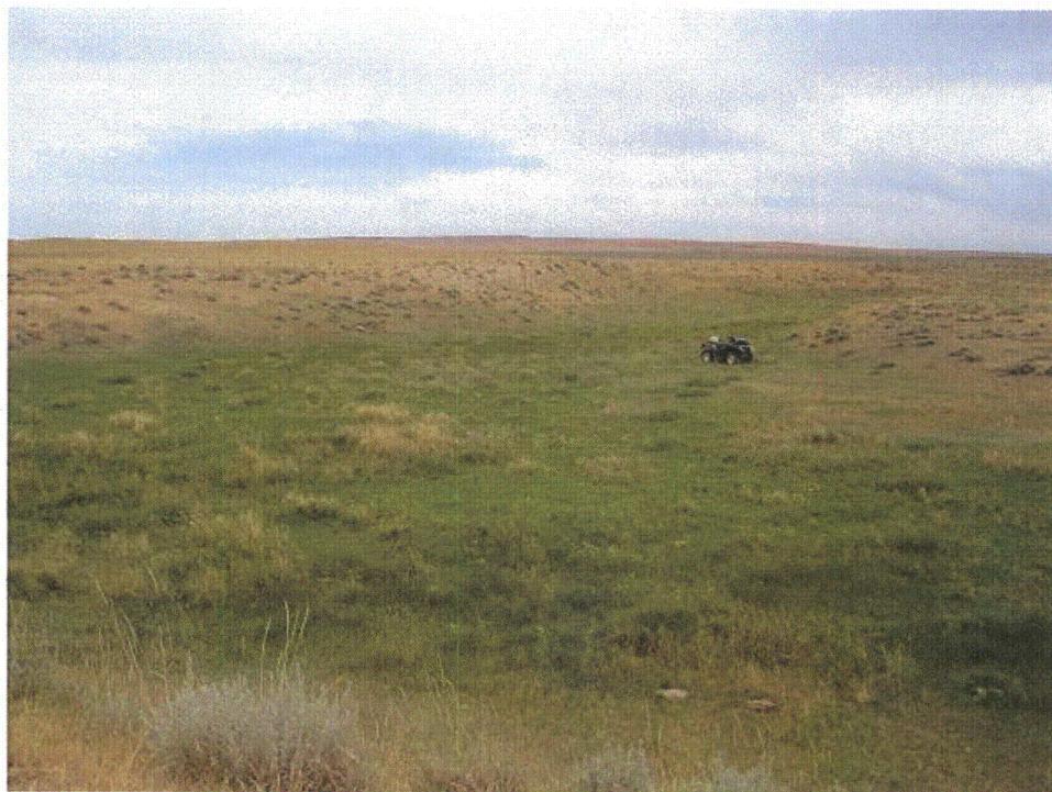
Photo 69 – WL-33a. Emergent wetland in Sage Creek Tributary 4. Looking southeast.