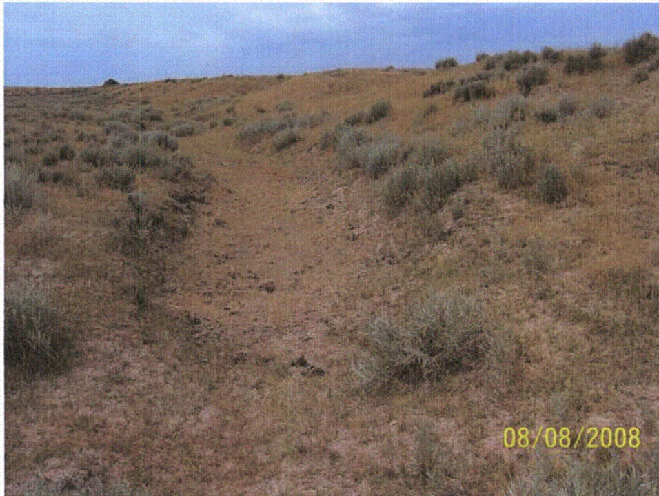
Photo 70 – WL-34c. Emergent wetland in Sage Creek Tributary 4. Looking north.