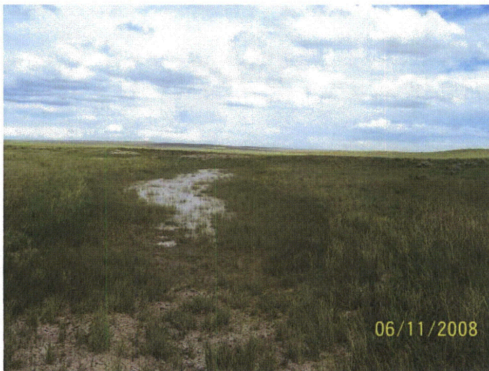
Photo 60 - WL-26f. Emergent wetland behind diked channel in Sage Creek Tributary 4. Looking east.