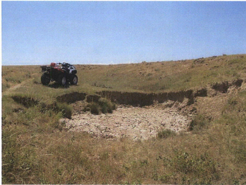
Photo 102 - WB-172. Waterbody in depression in Sage Creek Tributary 6. Looking south.