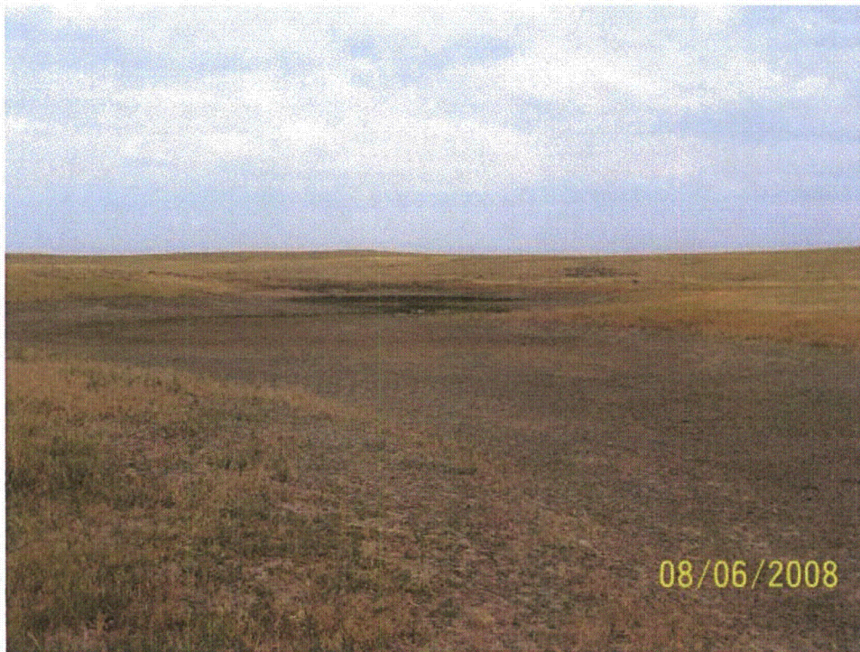
Photo 83 – WB-67. Diked waterbody in Sage Creek Tributary 3. Looking west.