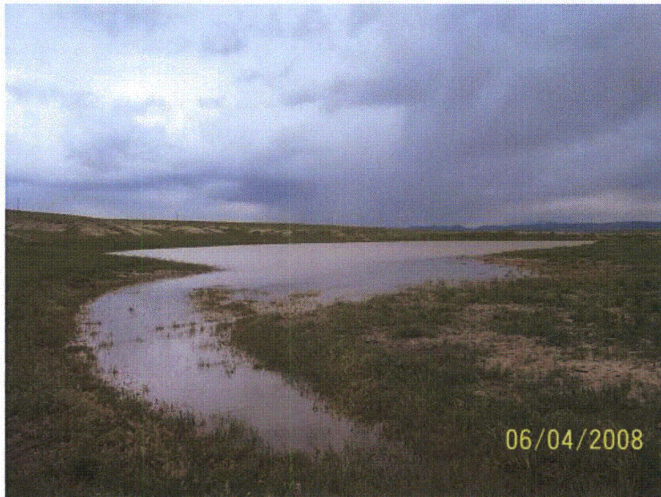
Photo 89 – WB-85. Diked waterbody in depression in Sage Creek Tributary 4. Looking south.