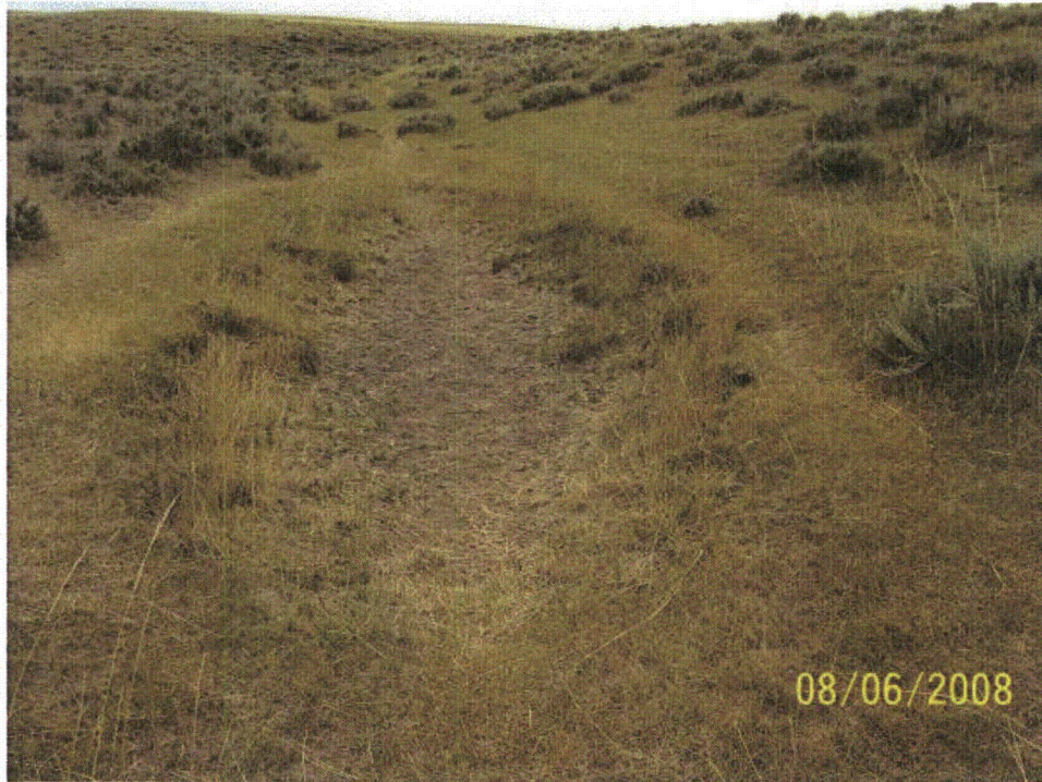
Photo 84 – WB-73. Waterbody in depression in Sage Creek Tributary 3. Looking west.