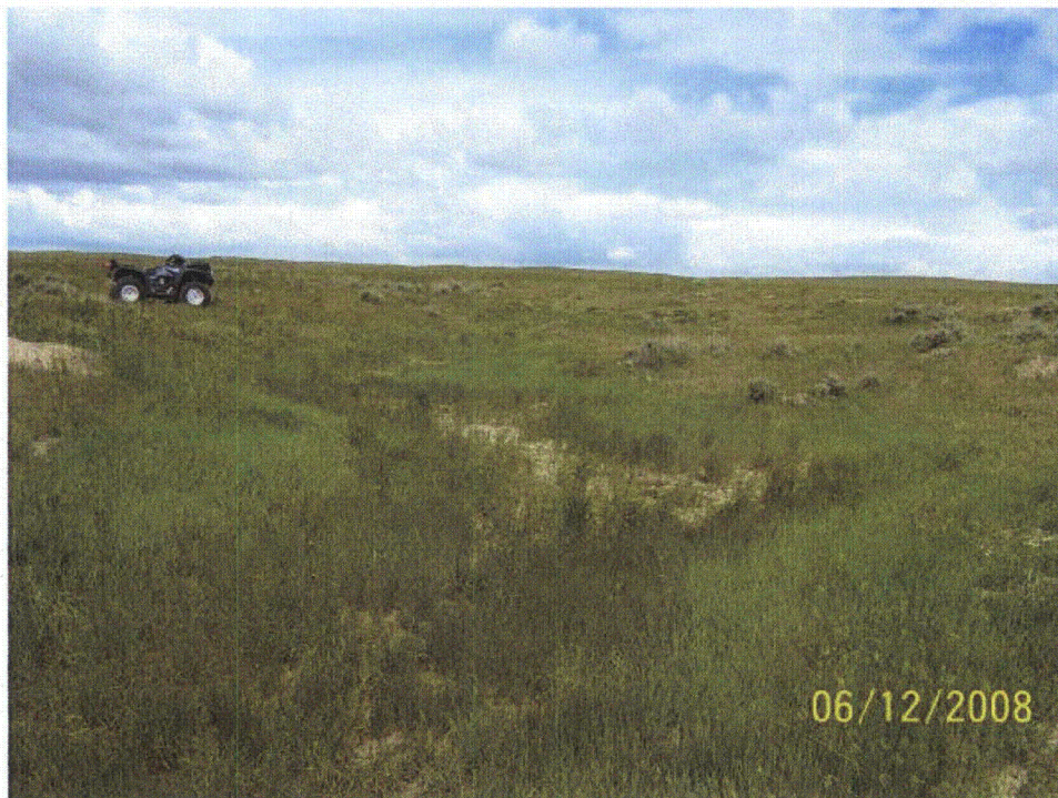
Photo 63 – WL-29h. Emergent wetland in Sage Creek Tributary 4 S. Looking east.