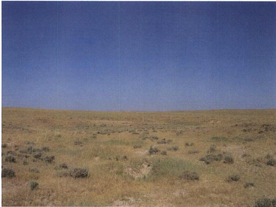
Photo 101 - WB-162. Waterbody in depression in Sage Creek Tributary 6. Looking west.