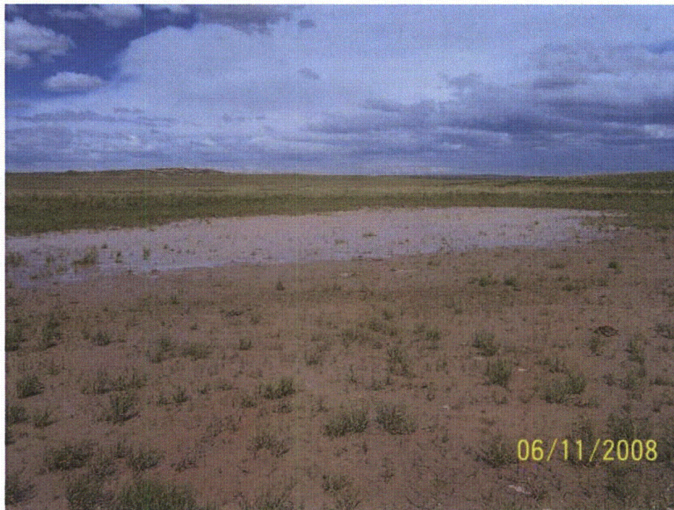
Photo 94 - WB-103. Isolated waterbody in depression in Sage Creek Tributary 4 W drainage area. Looking northeast.