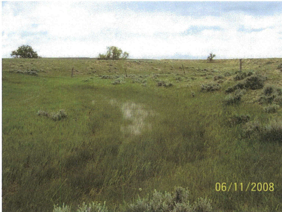
Photo 67 – WL-31o. Emergent wetland in Sage Creek Tributary 4. Looking northeast.