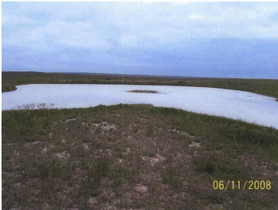
Photo 93 - WB-102. Diked waterbody in Sage Creek Tributary 4W. Looking east.