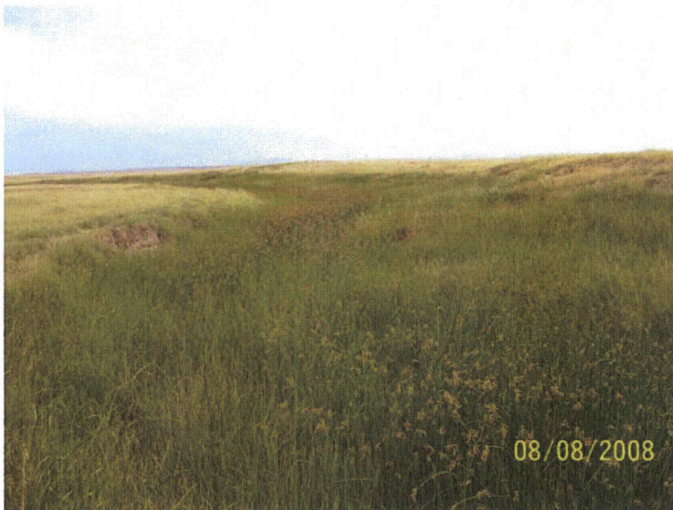
Photo 74 – WL-37s. Emergent wetland in Sage Creek. Looking southeast.