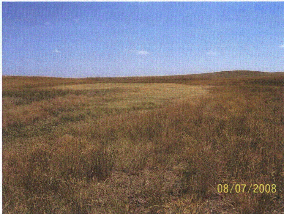
Photo 59 – WL-22. Emergent wetland behind diked channel in Sage Creek Tributary 4 NW. Looking southeast.