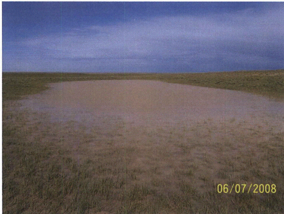
Photo 87 – WB-80. Isolated waterbody in depression in Sage Creek Tributary 4 N. Looking northeast.