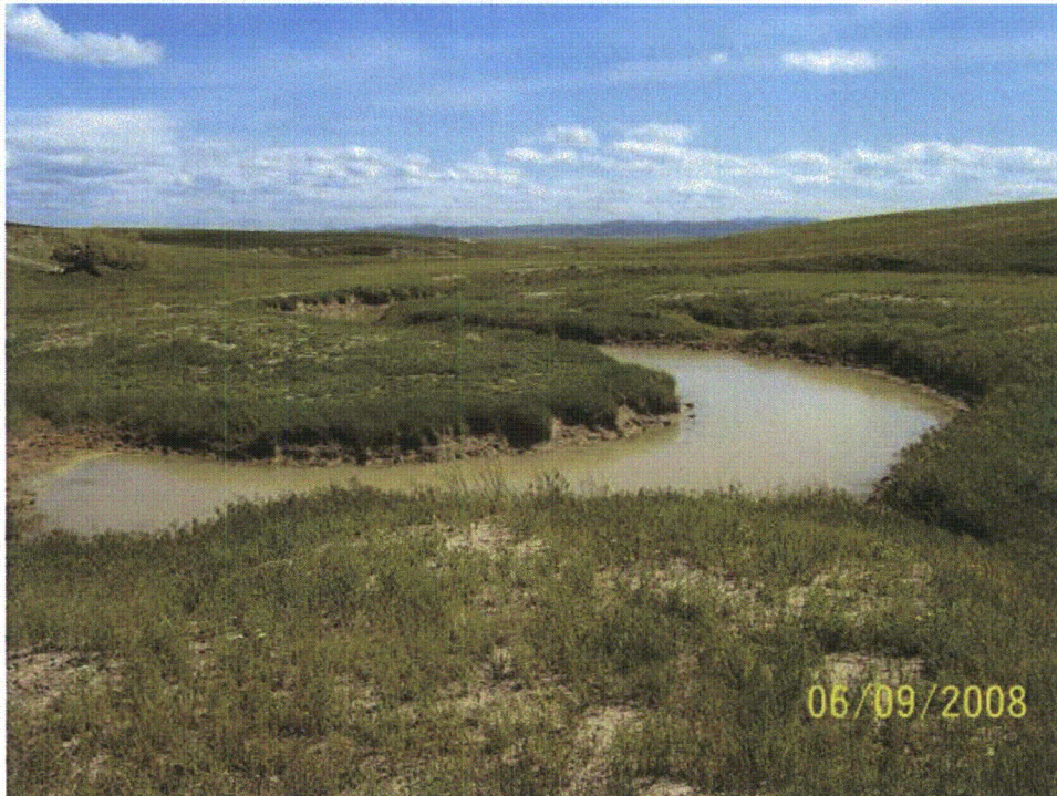
Photo 90 – WB-90. Waterbody in depression in Sage Creek Tributary 4. Looking south.