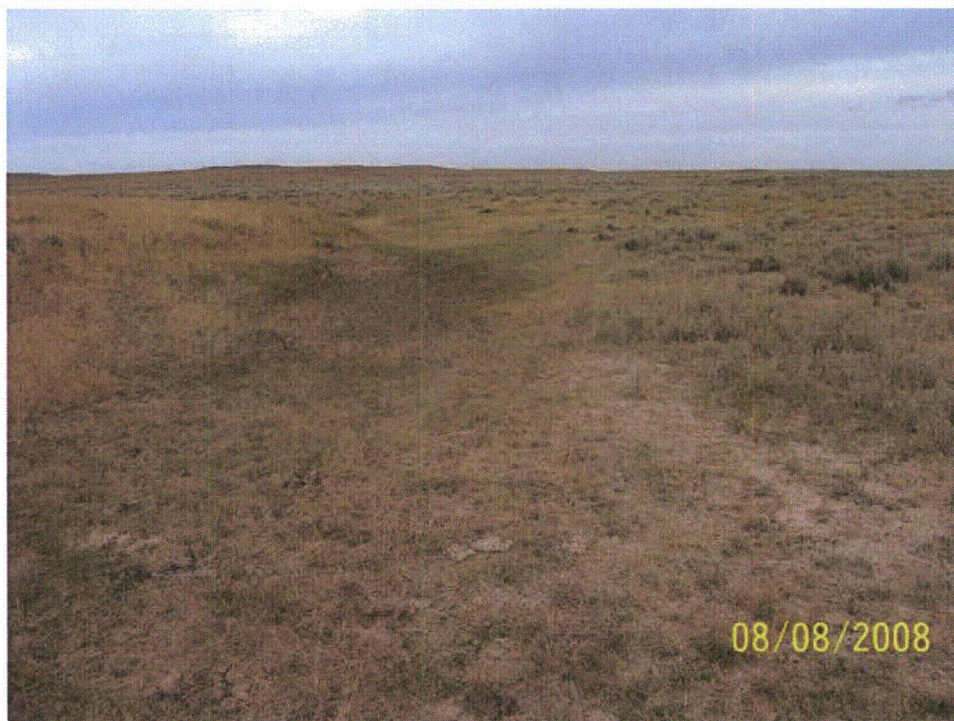
Photo 97 - WB-130. Waterbody in depression in Sage Creek Tributary 4. Looking northwest.