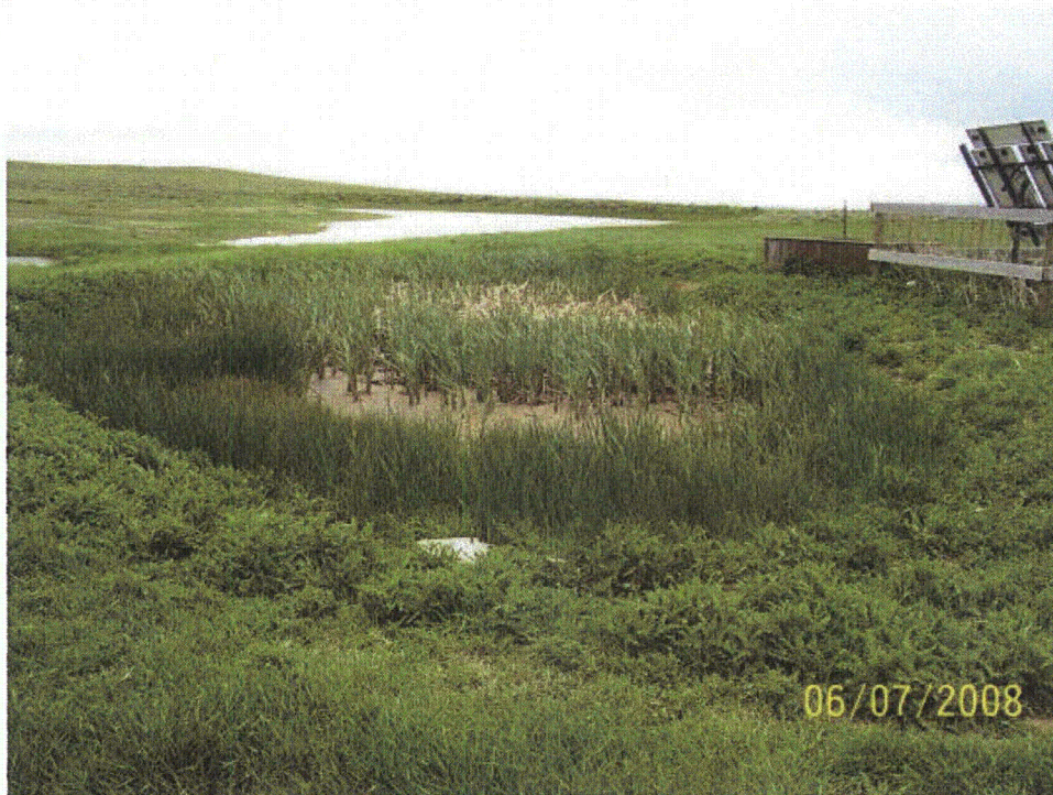
Photo 55-WL-20. Isolated emergent wetland adjacent to windmill in Sage Creek Tributary 4 NW drainage. Looking east.