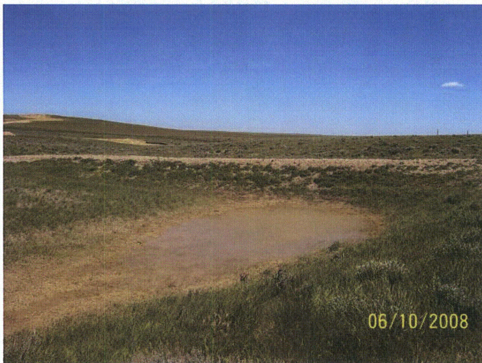
Photo 86 - WB-79. Diked waterbody in Sage Creek Tributary 3. Looking northeast.