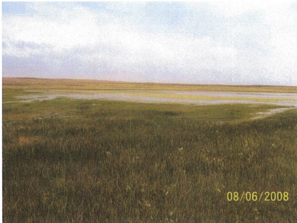
Photo 80 – WL-41f. Emergent wetland in diked Sage Creek Tributary 7 (Gilbert Lake). Looking northeast.