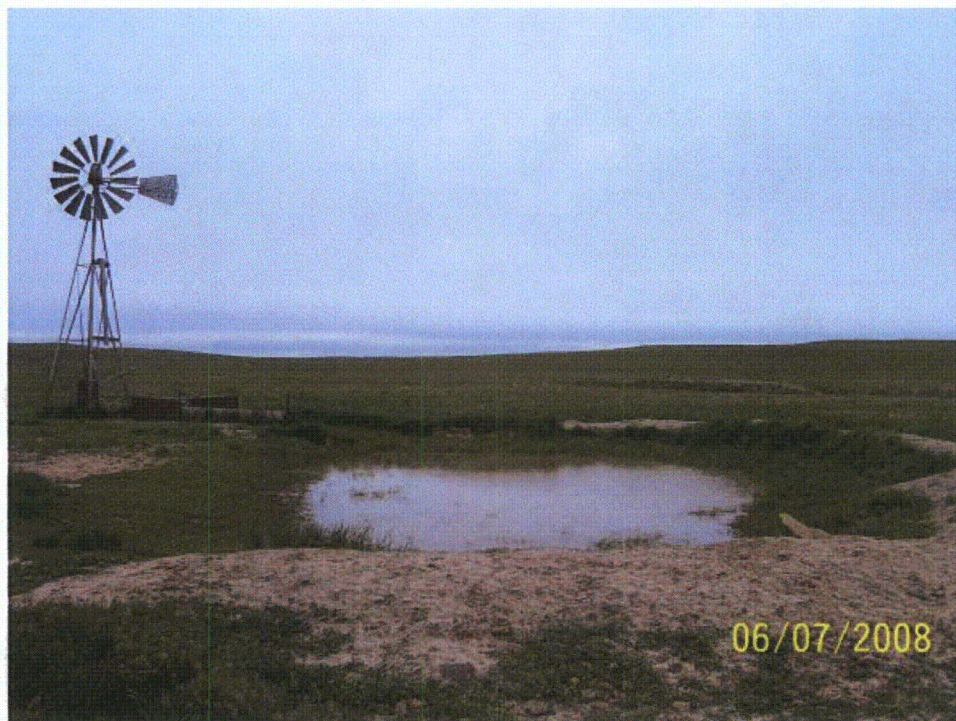
Photo 91 – WB-95. Isolated waterbody at windmill in Sage Creek Tributary 4 NW drainage area. Looking west.