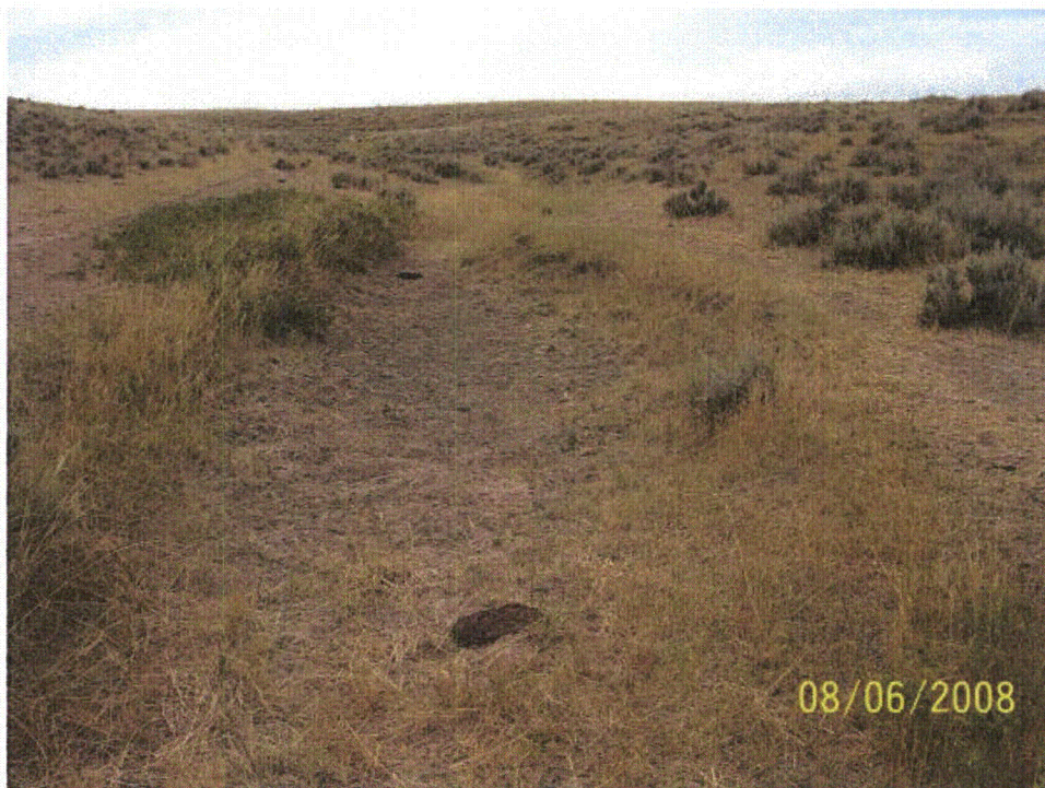
Photo 85 – WB-78. Waterbody in depression in Sage Creek Tributary 3. Looking west.