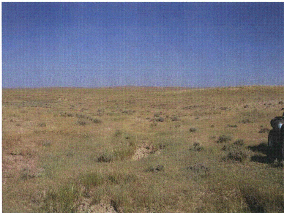
Photo 103 - WB-182. Waterbody in depression in Sage Creek Tributary 6. Looking northwest.