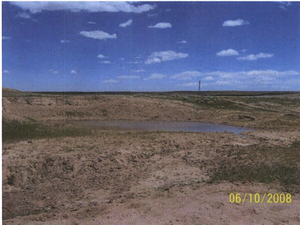
Photo 98 – WB-134. Isolated waterbody piped from windmill in Sage Creek drainage area. Looking northeast.