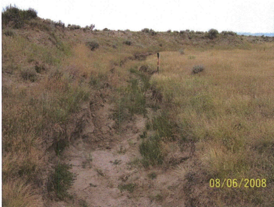
Photo 105 - WB-193. Waterbody in depression in Sage Creek Tributary 7. Looking south.