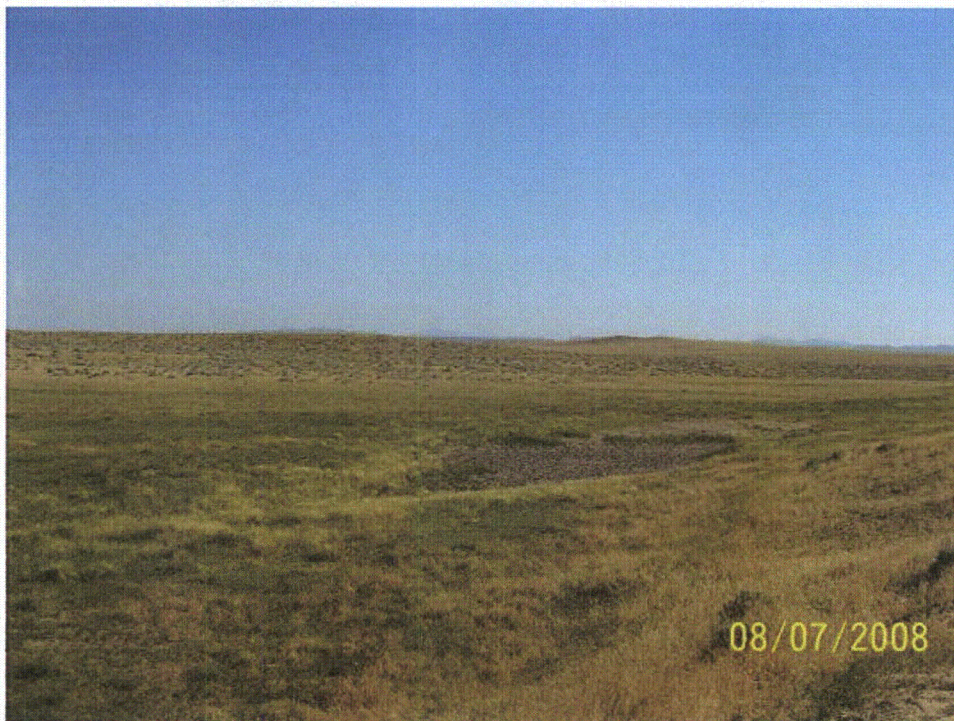
Photo 71 – WL-37a. Emergent wetland in Sage Creek. Looking southeast.