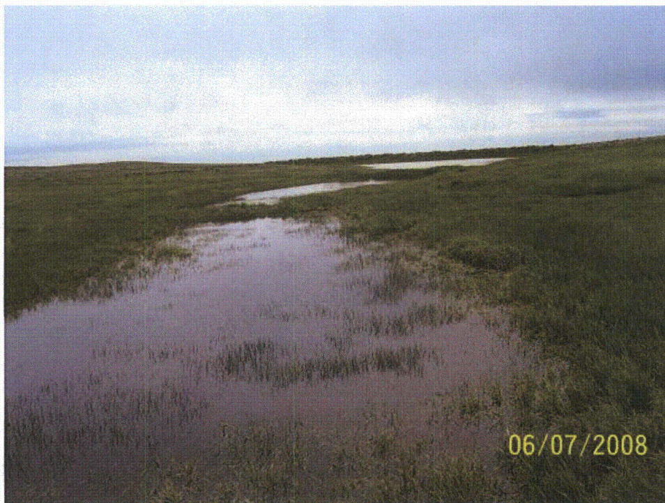
Photo 54 – WL-19a & b. Emergent wetlands upgradient of diked water body in Sage Creek Tributary 4 NW. WL-19a is in foreground. Looking east.