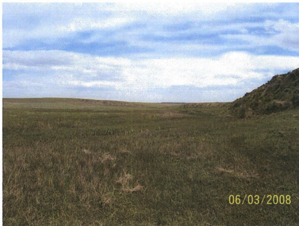
Photo 78 – WL-40. Emergent slope wetland in Sage Creek. Looking south.