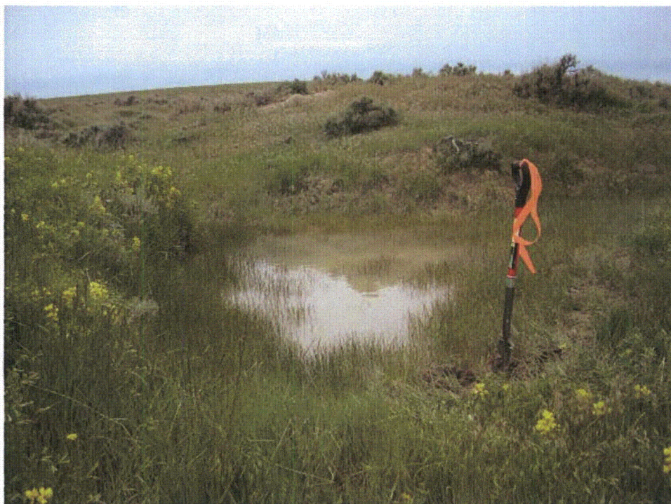
Photo 56 – WL-21a. Emergent wetland in Sage Creek Tributary 4 NW. Looking northeast.