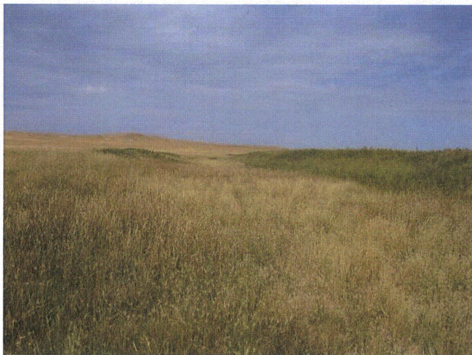
Photo 75 – WL-37w. Emergent wetland in drainage to Sage Creek. Looking west.