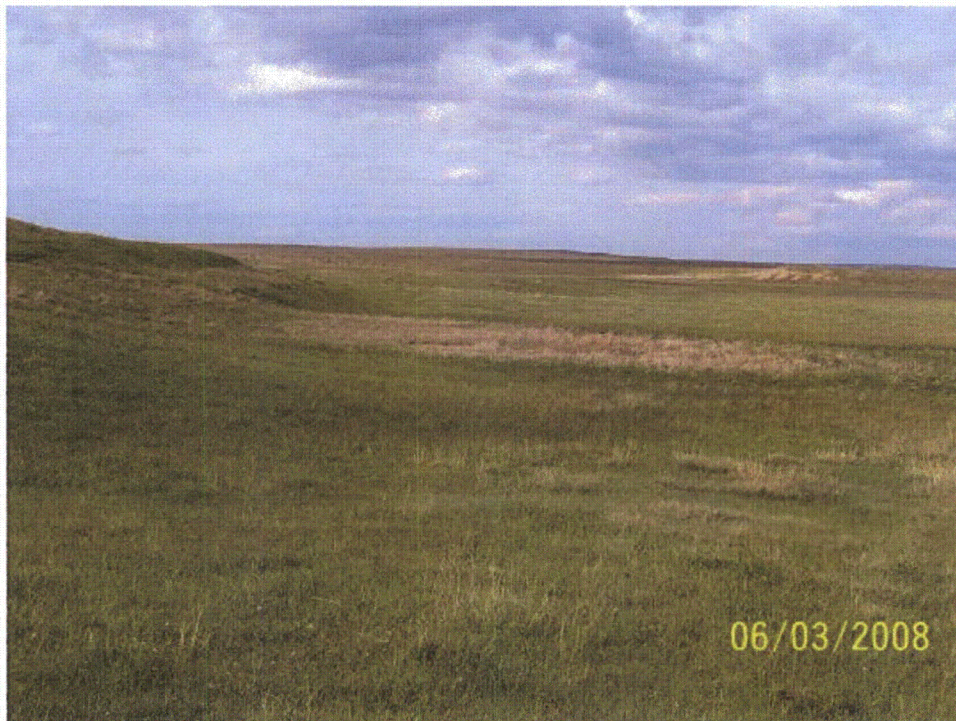
Photo 76 – WL-38. Emergent slope wetland in Sage Creek. Looking northeast.