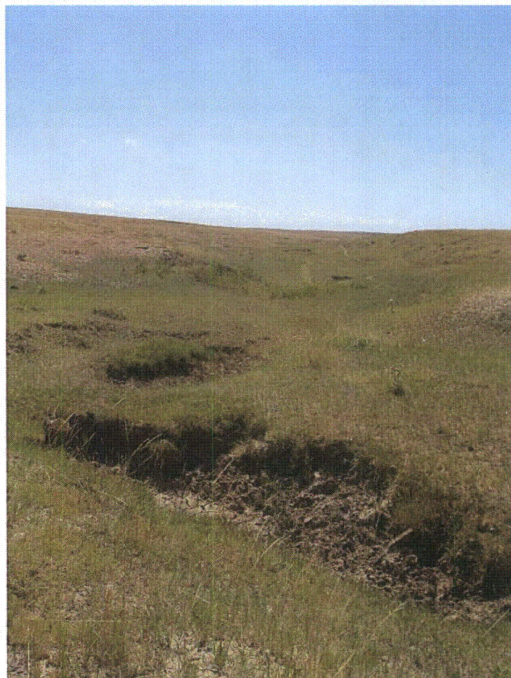
Photo 100 - WB-151. Waterbody in depression in Sage Creek Tributary 6. Looking southwest.