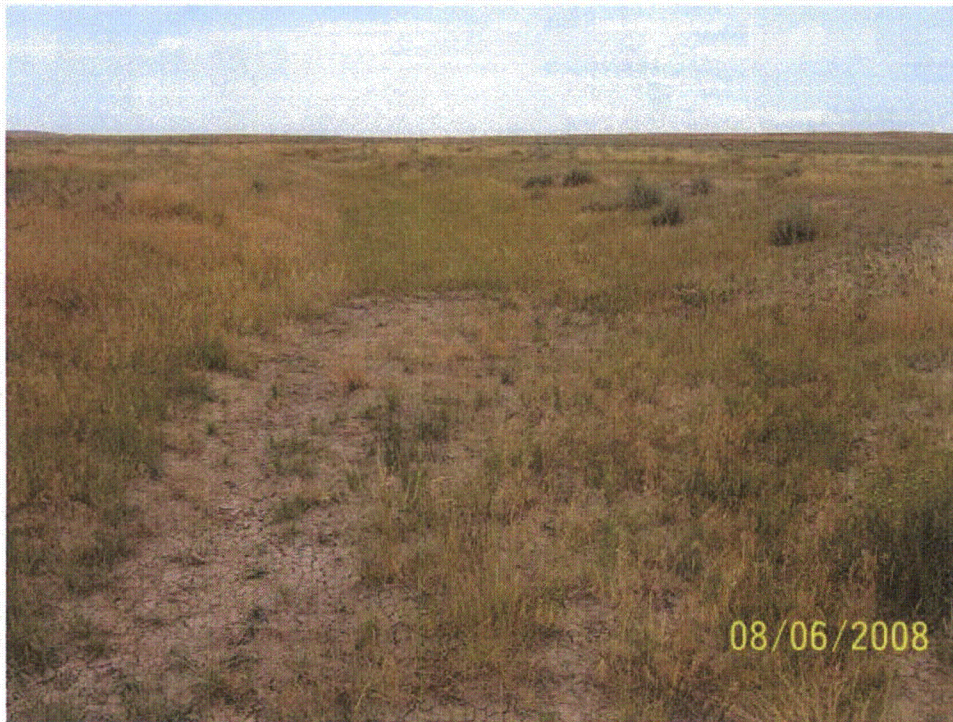
Photo 106 - WB-195. Waterbody in depression in Sage Creek Tributary 7. Looking north.