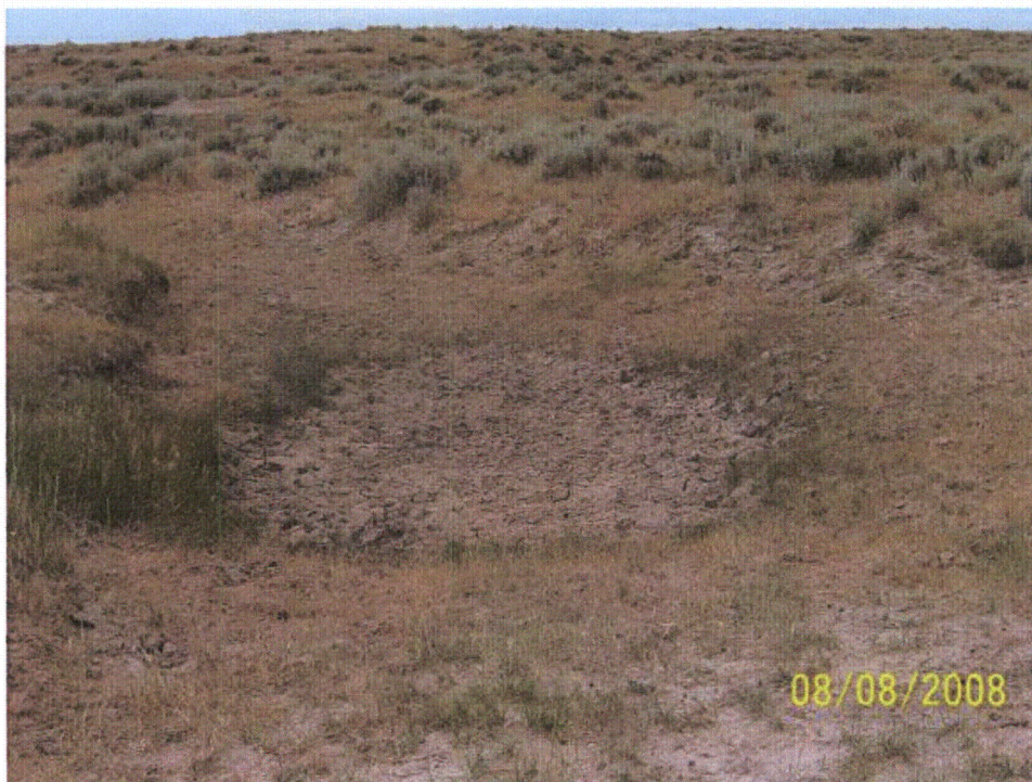
Photo 96- WB-126. Waterbody in depression in Sage Creek Tributary 4. Looking west.