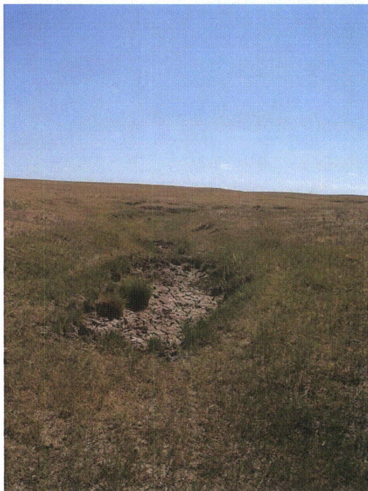
Photo 99 - WB-141. Waterbody in depression in Sage Creek Tributary 6. Looking southwest.