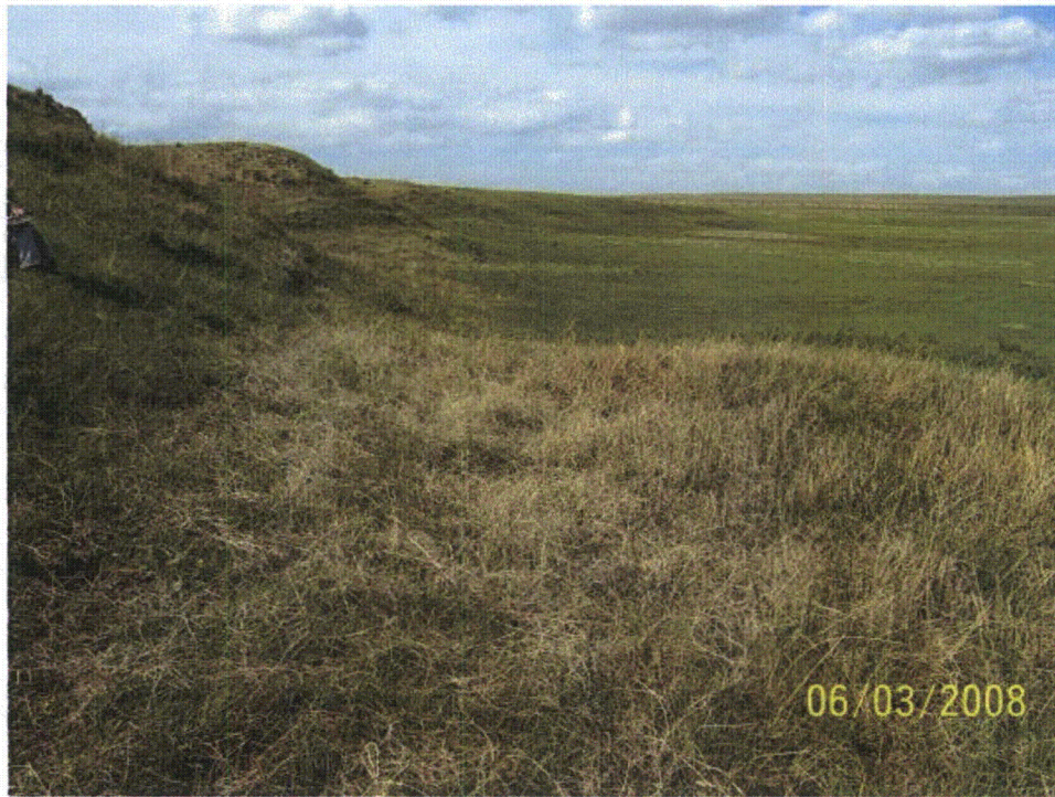
Photo 77 – WL-39. Emergent slope wetland in Sage Creek. Looking north.