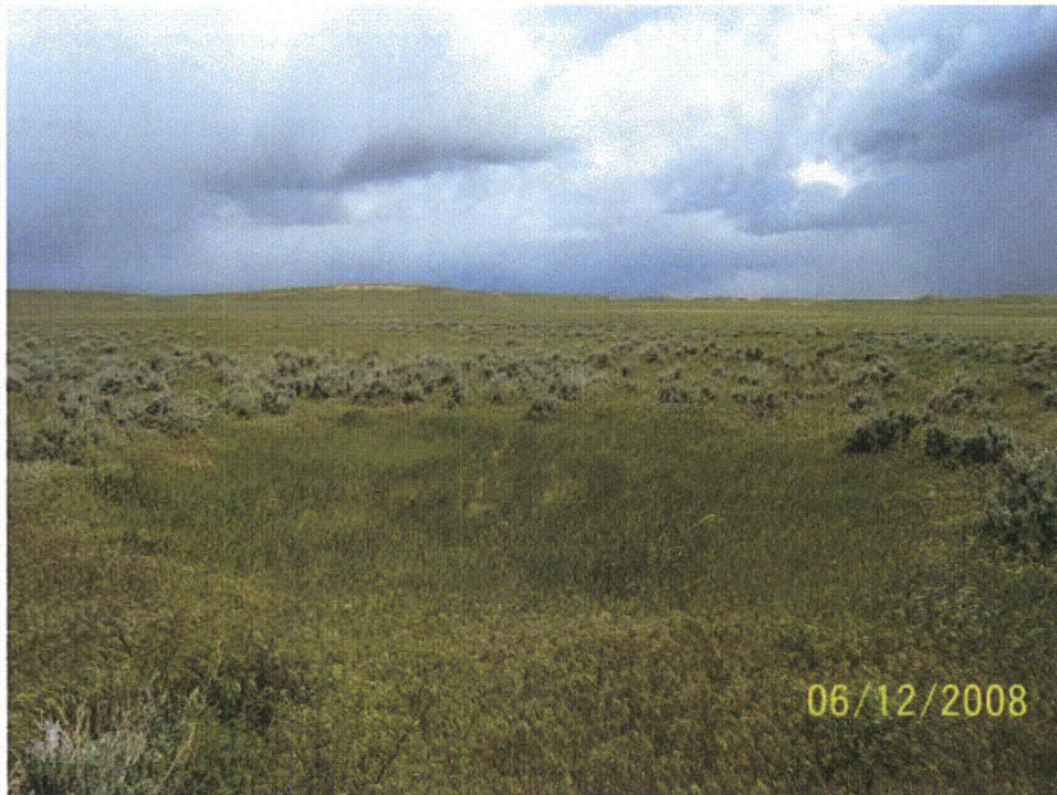
Photo 64 – WL-29n. Emergent wetland in Sage Creek Tributary 4 S. Looking northwest.