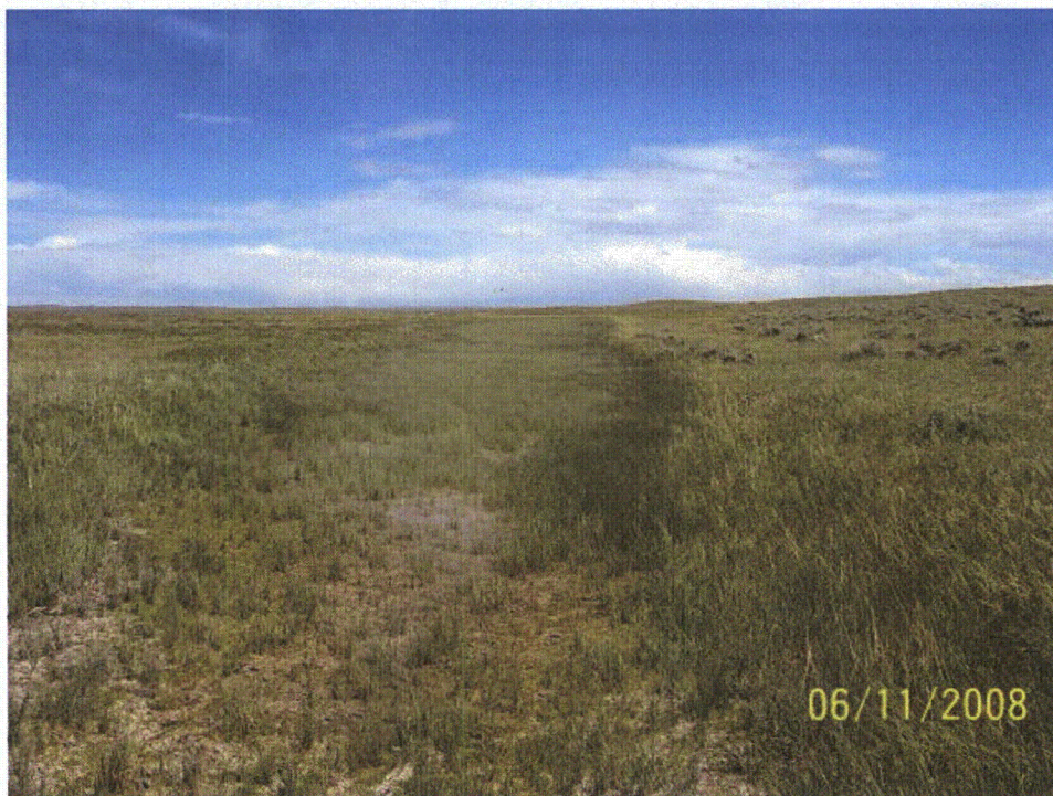
Photo 61 - WL-26g. Emergent wetland behind diked channel in Sage Creek Tributary 4. Looking east.