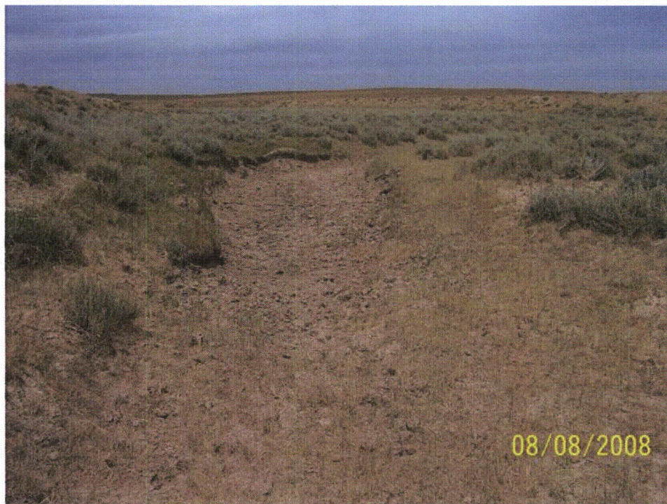
Photo 95 - WB-114. Waterbody in depression in Sage Creek Tributary 4. Looking northwest.