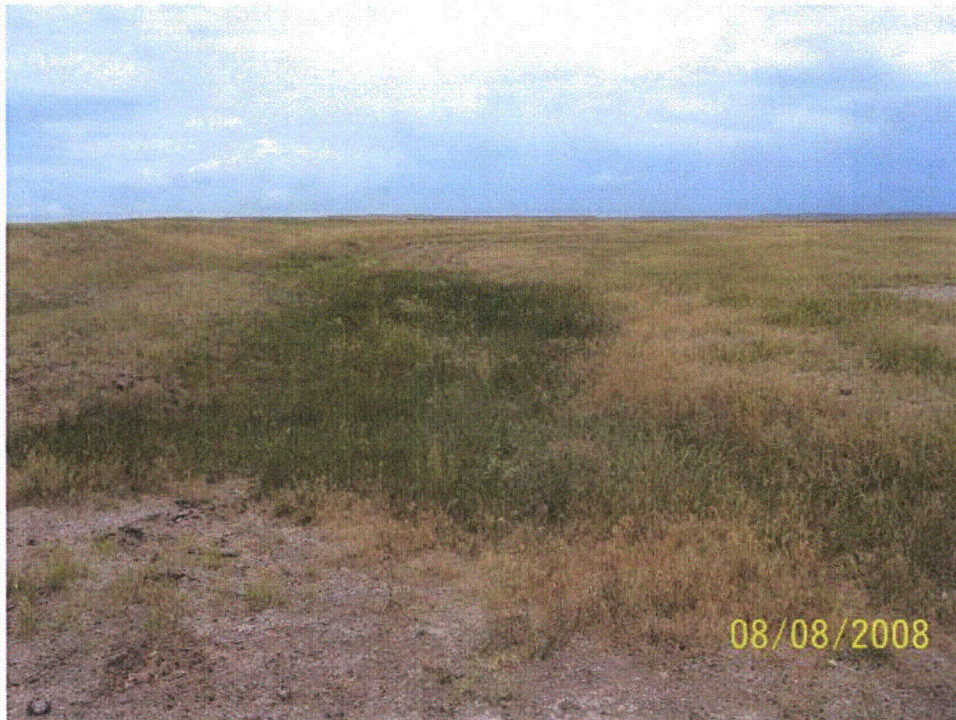
Photo 73 – WL-37n. Emergent wetland in Sage Creek. Looking southeast.