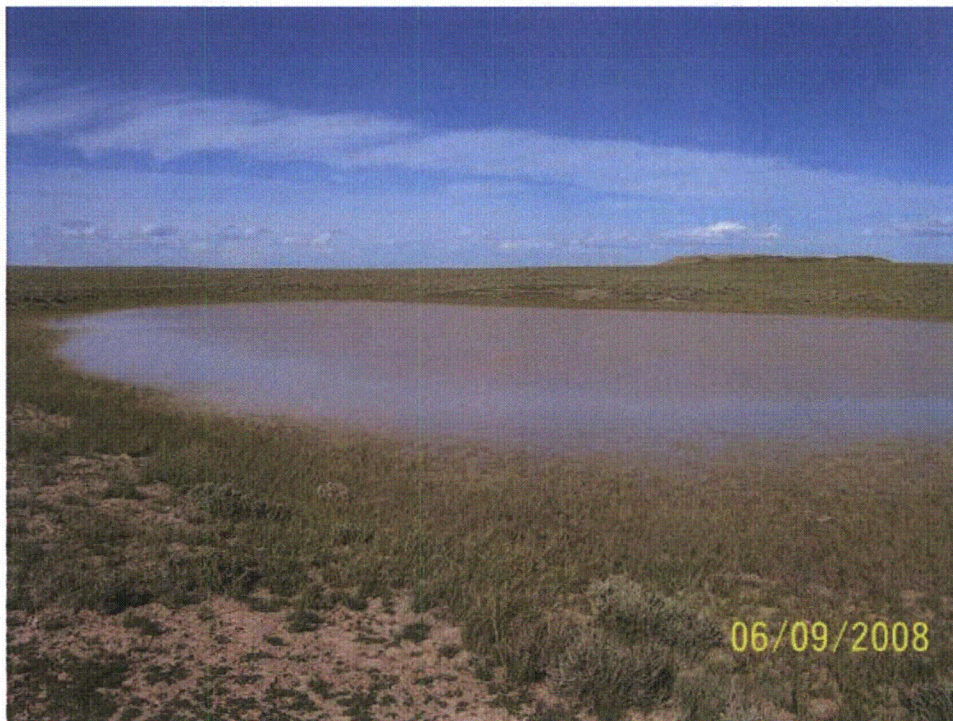
Photo 88 – WB-82. Isolated waterbody in depression in Sage Creek Tributary 4. Looking northeast.