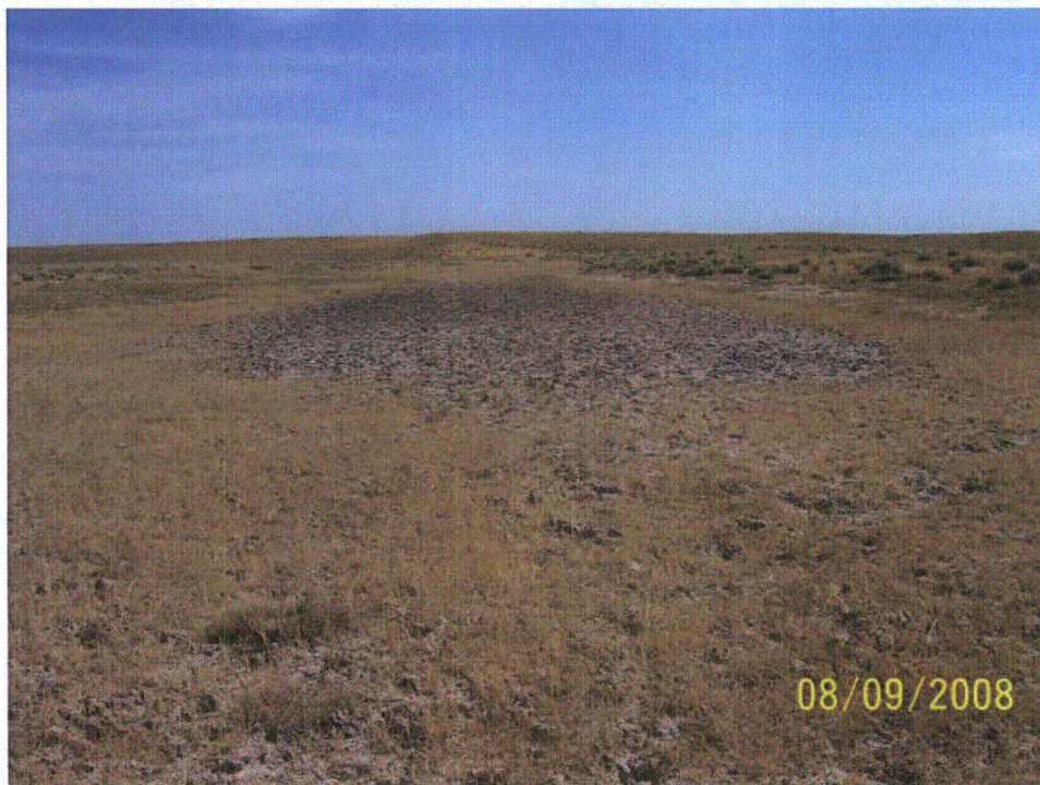
Photo 104 - WB-191. Waterbody in depression in tributary to Sage Creek. Looking northeast.