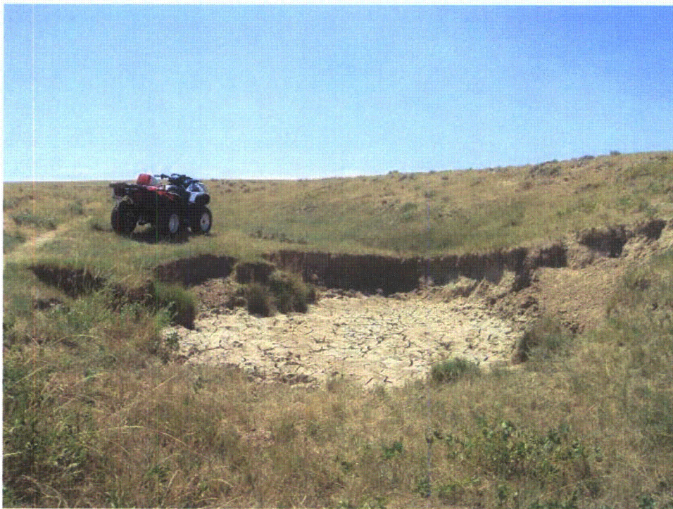
Photo 102: WB-172. Waterbody in depression in Sage Creek Tributary 6. Looking south.