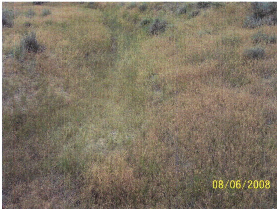
Photo 79: WL-41c. Emergent wetland in Sage Creek Tributary 7. Looking south.