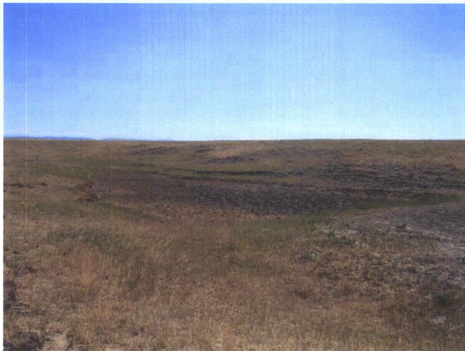
Photo 82: WL-43a. Emergent wetland in Sage Creek Tributary 6. Looking southwest.