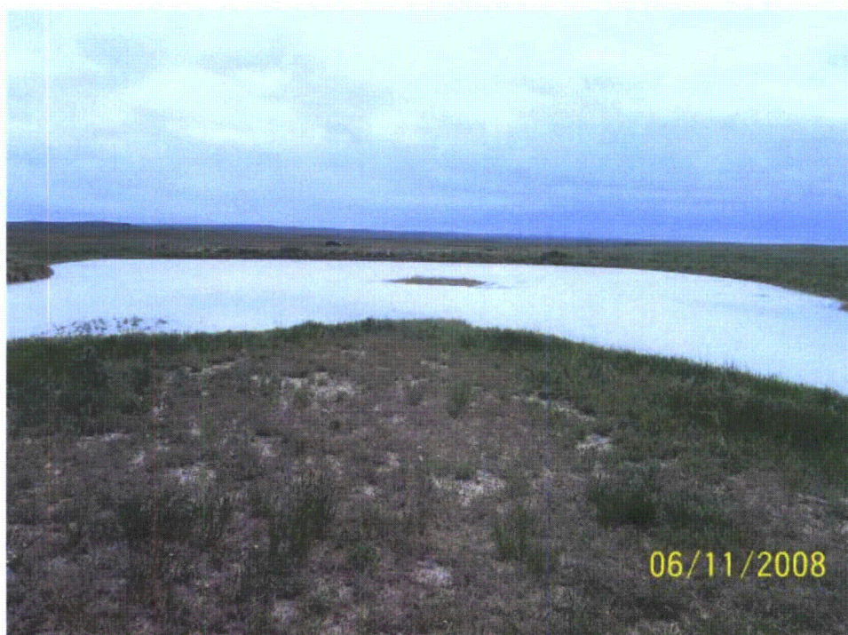
Photo 93: WB-102. Diked waterbody in Sage Creek Tributary 4W. Looking east.