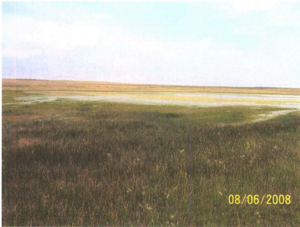
Photo 80: WL-41f. Emergent wetland in diked Sage Creek Tributary 7 (Gilbert Lake). Looking northeast.