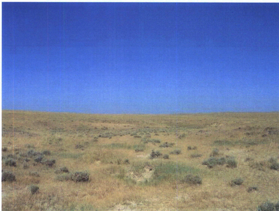
Photo 101: WB-162. Waterbody in depression in Sage Creek Tributary 6. Looking west.