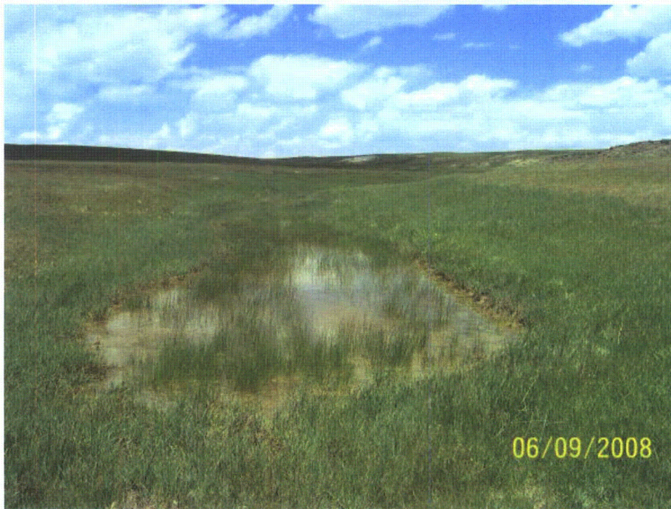
Photo 53: WL-18n. Emergent wetland within depression in Sage Creek Tributary 4 drainage. Looking north.