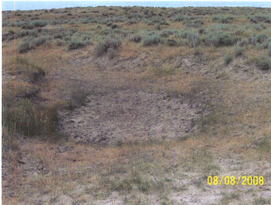
Photo 96- WB-126. Waterbody in depression in Sage Creek Tributary 4. Looking west.