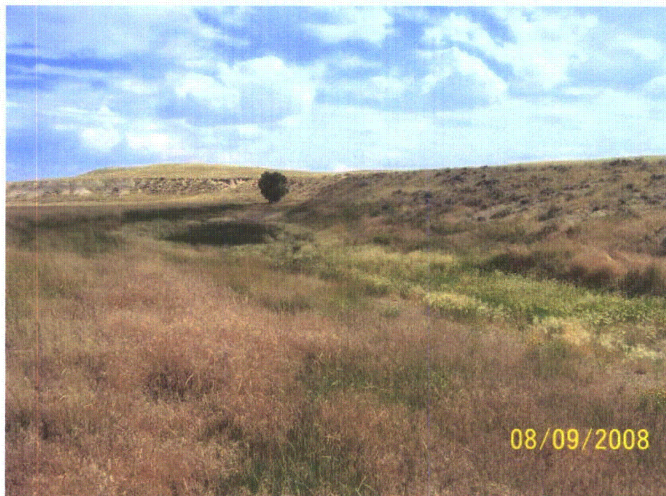
Photo 48: WL-14. Emergent wetland (PEMC with PUBF area) within depression in Sage Creek. Looking southeast.