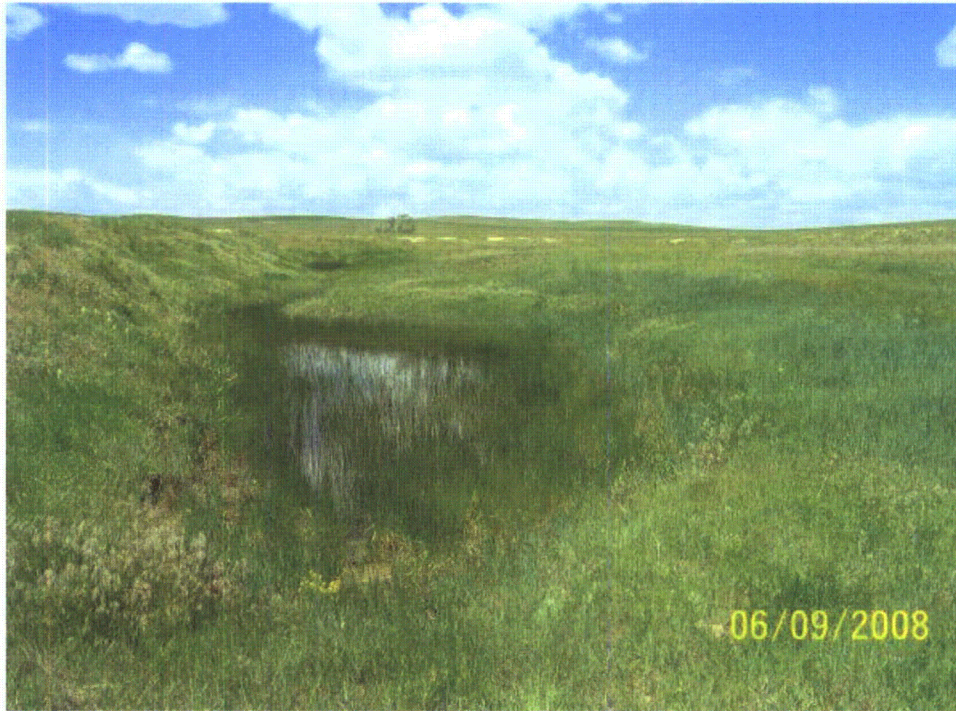
Photo 52: WL-18l. Emergent wetland within depression in Sage Creek Tributary 4 drainage. Looking west.