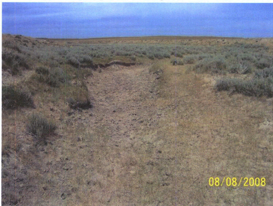
Photo 95: WB-114. Waterbody in depression in Sage Creek Tributary 4. Looking northwest.