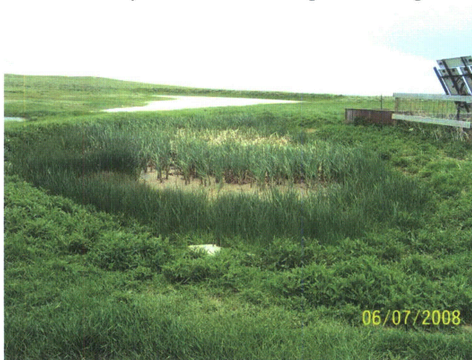
Photo 55-WL-20. Isolated emergent wetland adjacent to windmill in Sage Creek Tributary 4 NW drainage. Looking east.