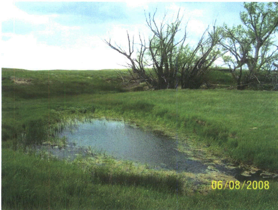
Photo 51: WL-18c. Emergent wetland within depression in Sage Creek Tributary 4 drainage. Looking north.