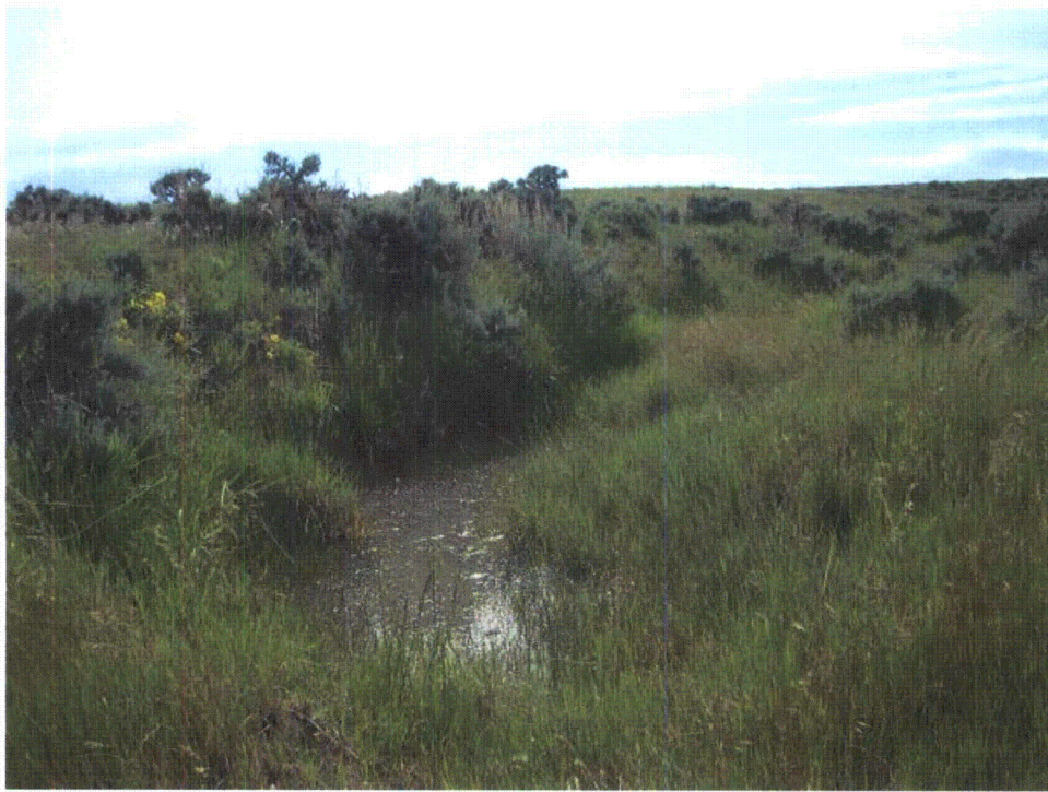
Photo 58: WL-21e. Emergent wetland in Sage Creek Tributary 4 NW. Looking west.