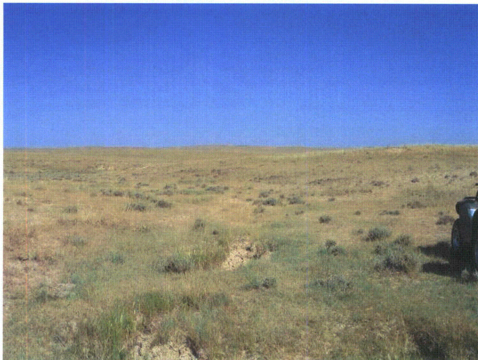
Photo 103: WB-182. Waterbody in depression in Sage Creek Tributary 6. Looking northwest.