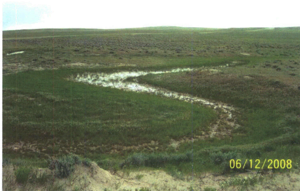
Photo 66: WL-29dd. Emergent wetland in Sage Creek Tributary 4 S. Looking northwest.