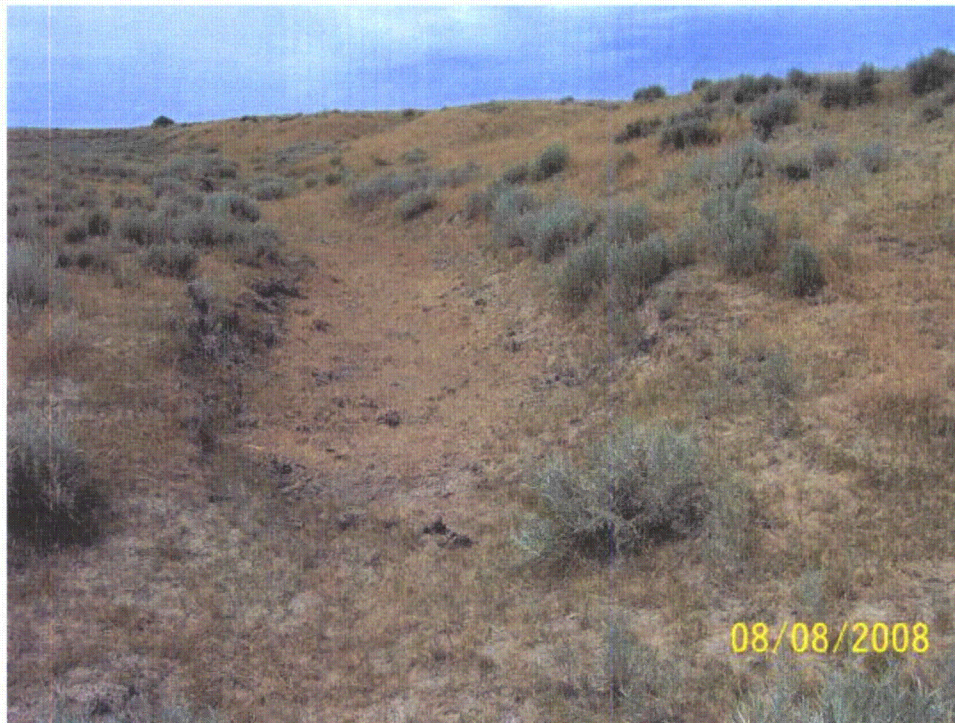
Photo 70: WL-34c. Emergent wetland in Sage Creek Tributary 4. Looking north.