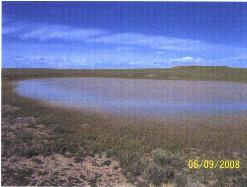
Photo 88: WB-82. Isolated waterbody in depression in Sage Creek Tributary 4. Looking northeast.