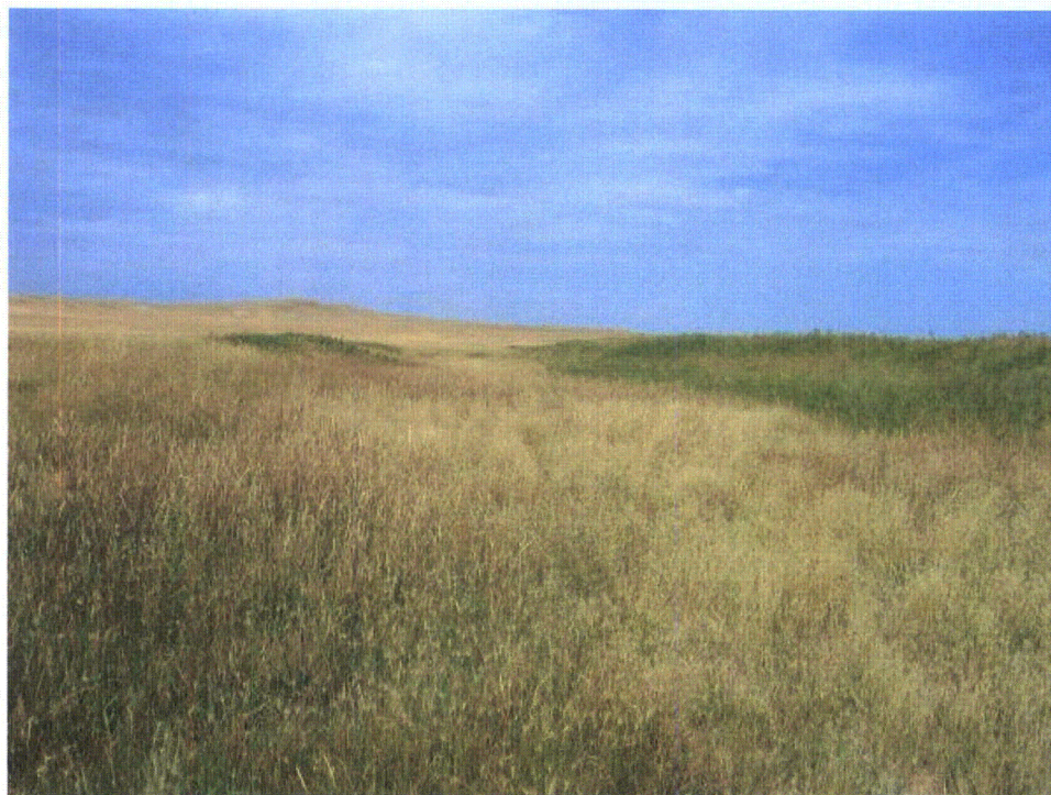
Photo 75: WL-37w. Emergent wetland in drainage to Sage Creek. Looking west.