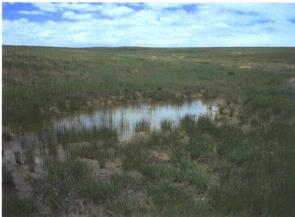
Photo 57: WL-21d. Emergent wetland in Sage Creek Tributary 4 NW. Looking north.