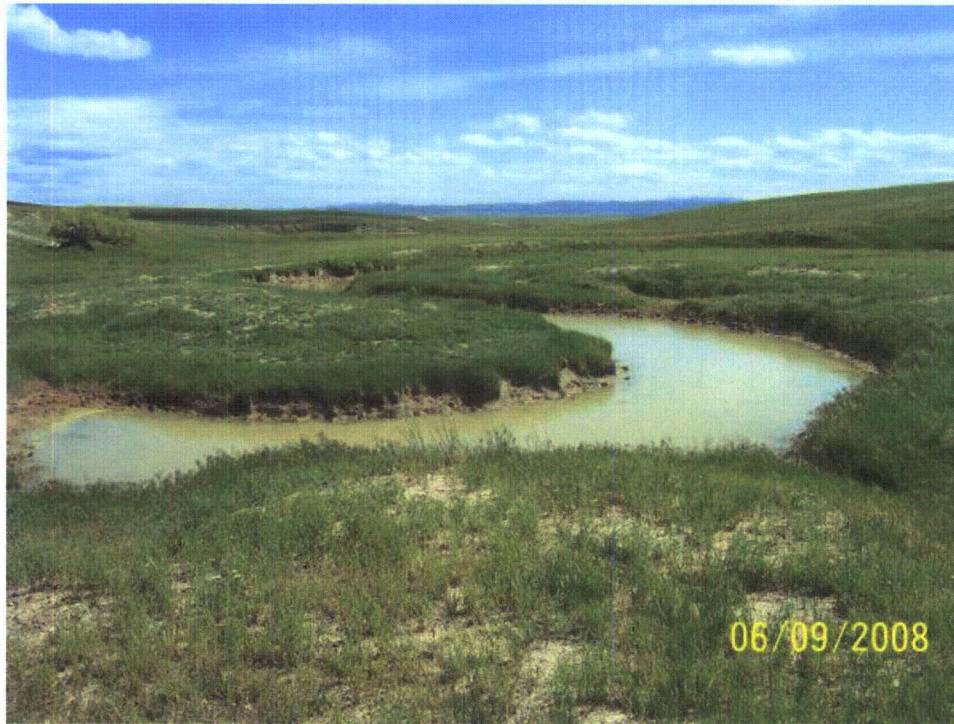
Photo 90: WB-90. Waterbody in depression in Sage Creek Tributary 4. Looking south.