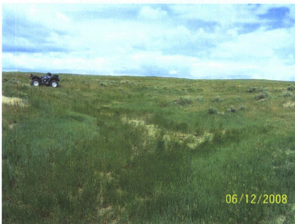
Photo 63: WL-29h. Emergent wetland in Sage Creek Tributary 4 S. Looking east.