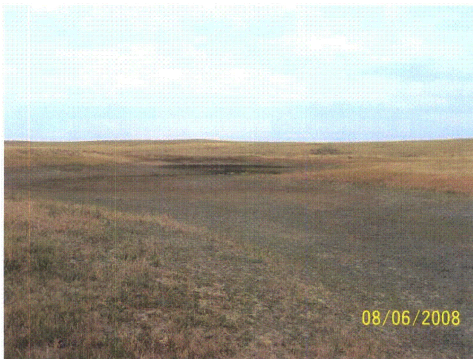
Photo 83: WB-67. Diked waterbody in Sage Creek Tributary 3. Looking west.