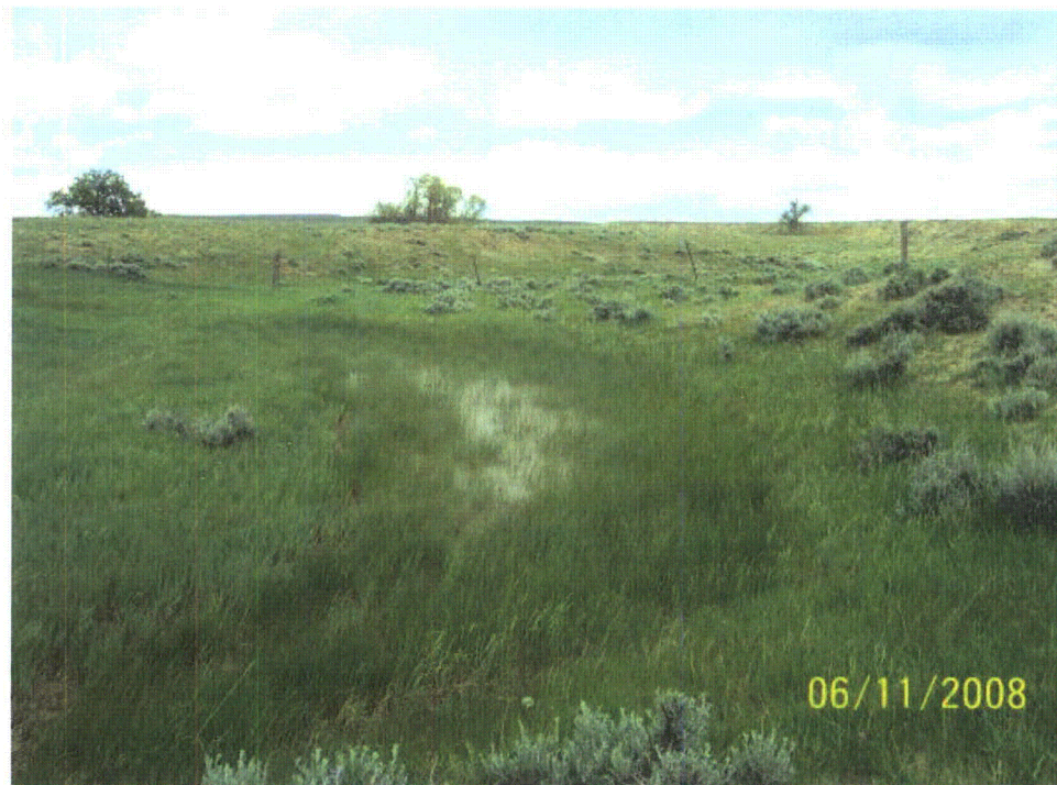
Photo 67: WL-31o. Emergent wetland in Sage Creek Tributary 4. Looking northeast.