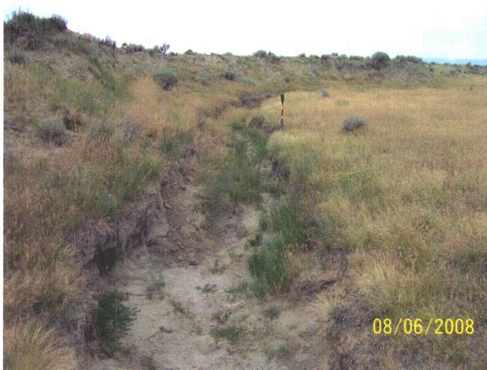
Photo 105: WB-193. Waterbody in depression in Sage Creek Tributary 7. Looking south.