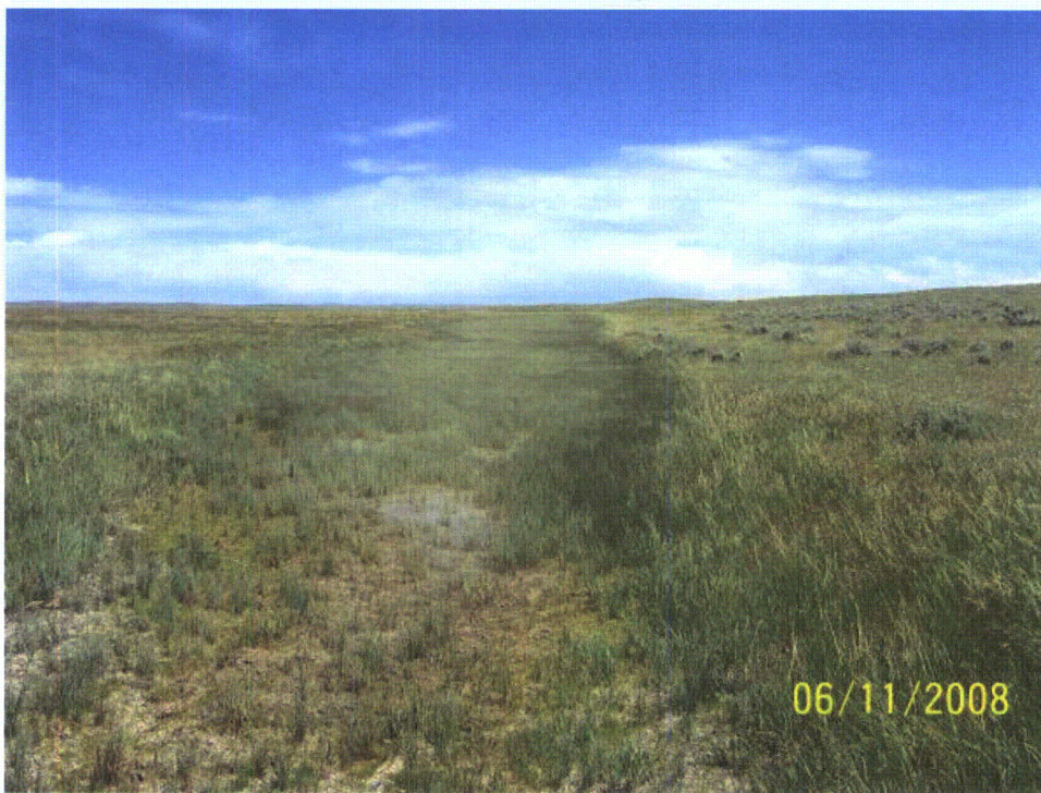
Photo 61: WL-26g. Emergent wetland behind diked channel in Sage Creek Tributary 4. Looking east.