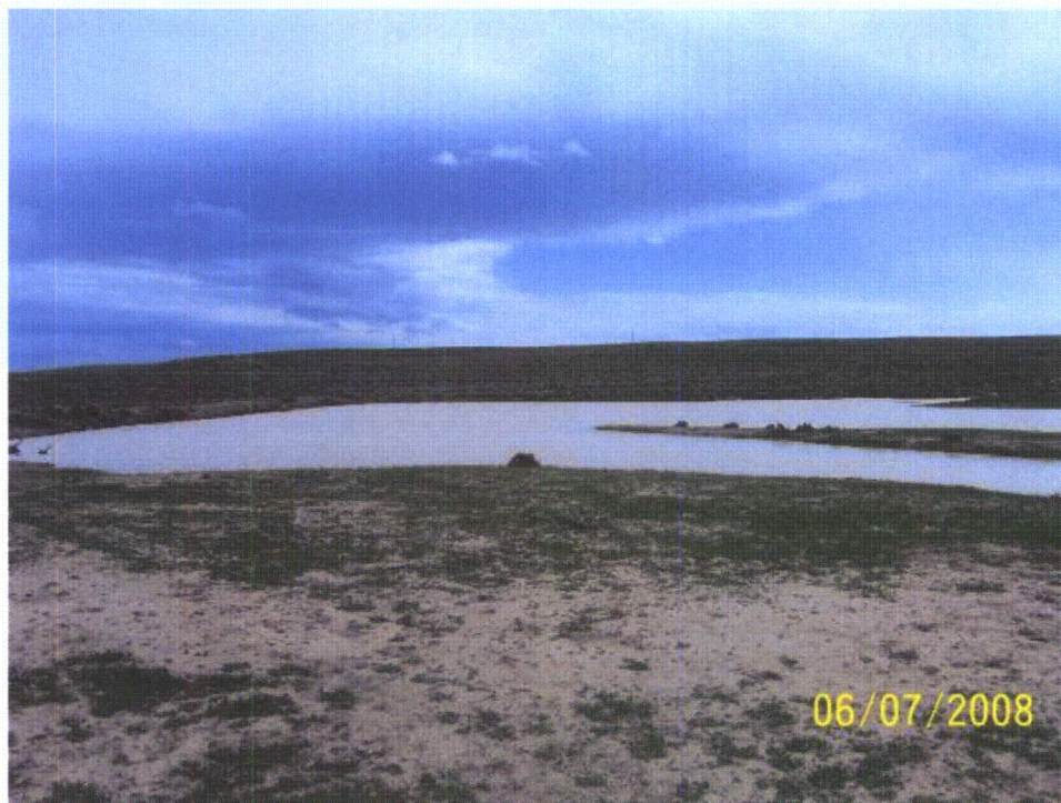
Photo 92: WB-98. Diked waterbody in Sage Creek Tributary 4W. Looking southeast.