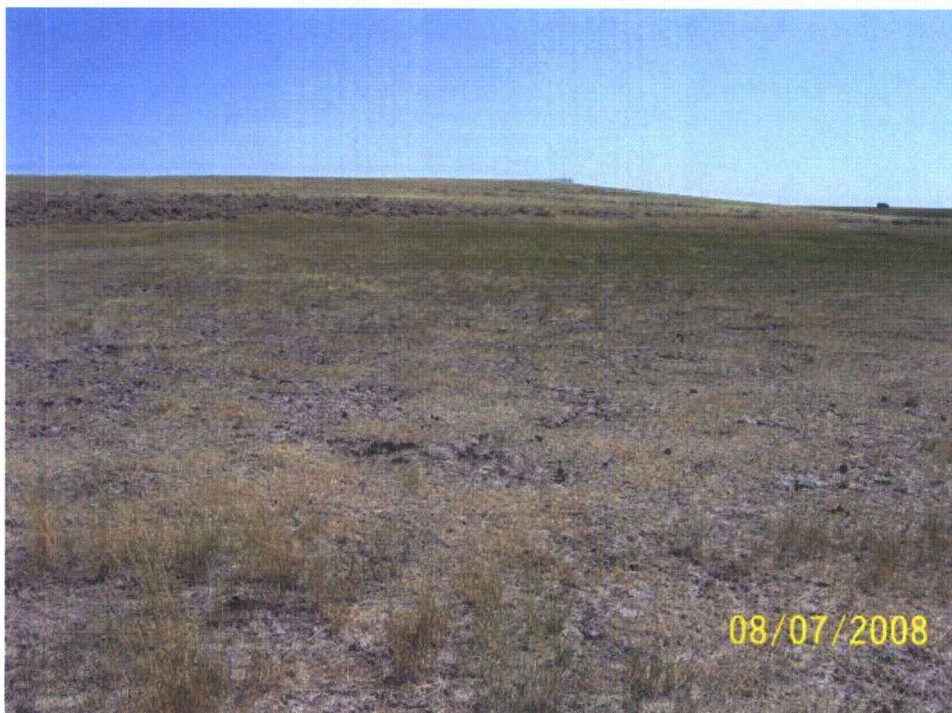
Photo 44: WL-10. Isolated emergent wetland within depression in Sage Creek Tributary 3 drainage area. Looking southeast.