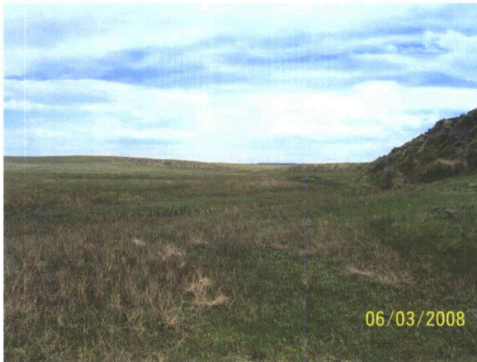
Photo 78: WL-40. Emergent slope wetland in Sage Creek. Looking south.