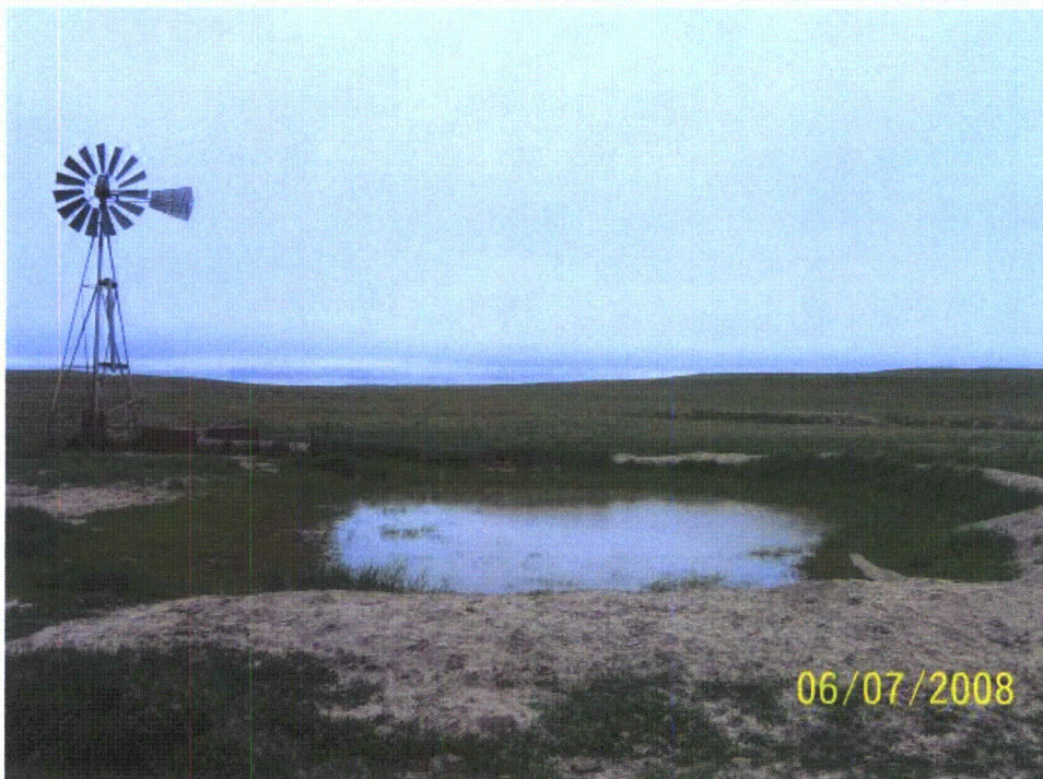
Photo 91: WB-95. Isolated waterbody at windmill in Sage Creek Tributary 4 NW drainage area. Looking west.