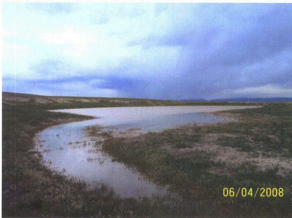
Photo 89: WB-85. Diked waterbody in depression in Sage Creek Tributary 4. Looking south.