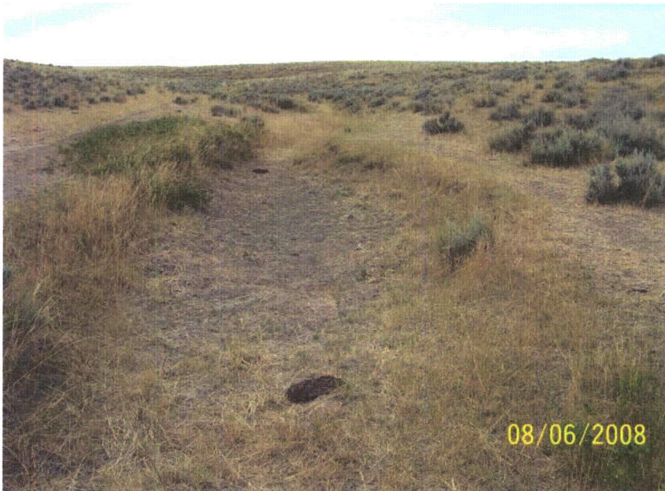
Photo 85: WB-78. Waterbody in depression in Sage Creek Tributary 3. Looking west.