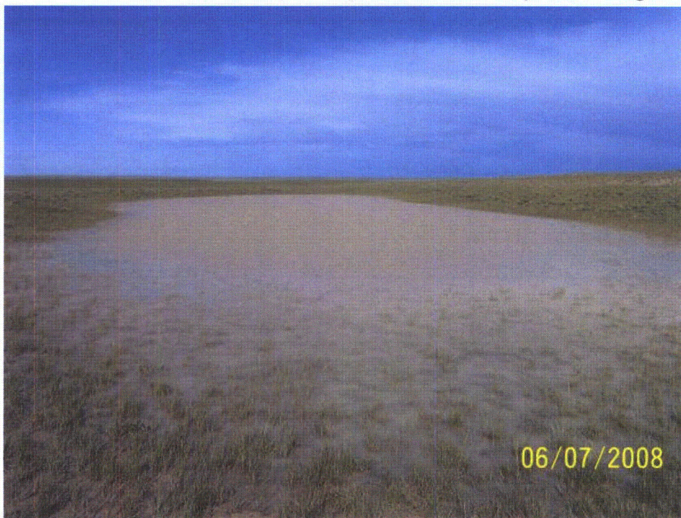
Photo 87: WB-80. Isolated waterbody in depression in Sage Creek Tributary 4 N. Looking northeast.