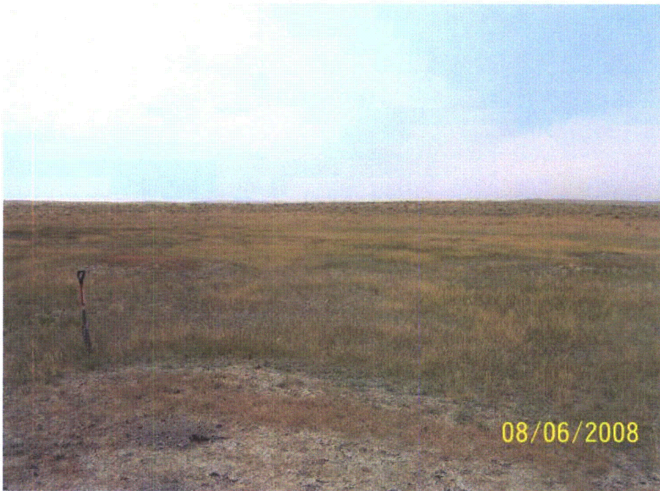
Photo 81: WL-42. Isolated depression. Emergent wetland in Sage Creek Tributary 7 drainage area. Looking east.