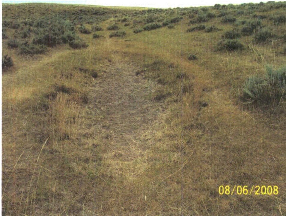
Photo 84: WB-73. Waterbody in depression in Sage Creek Tributary 3. Looking west.