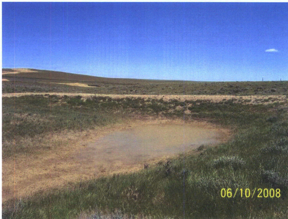
Photo 86: WB-79. Diked waterbody in Sage Creek Tributary 3. Looking northeast.