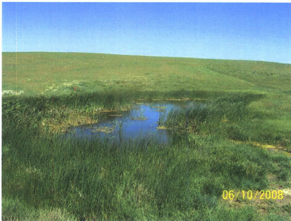
Photo 47: WL-13. Isolated emergent wetland within depression in Sage Creek Tributary 2 drainage area. Looking north.