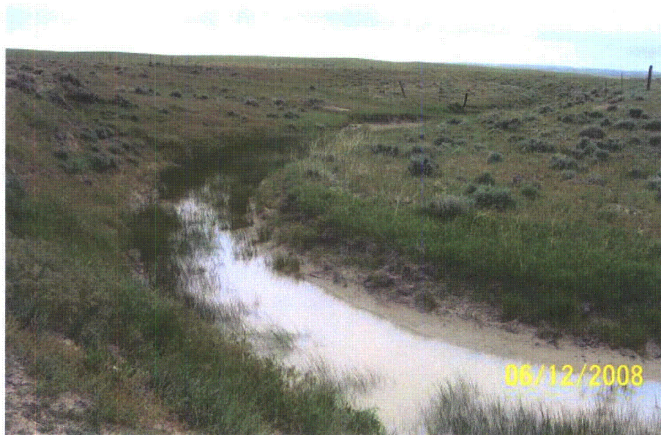
Photo 68: WL-32a. Emergent wetland in Sage Creek Tributary 4. Looking northeast.