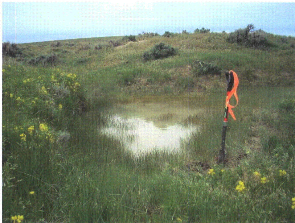
Photo 56: WL-21a. Emergent wetland in Sage Creek Tributary 4 NW. Looking northeast.