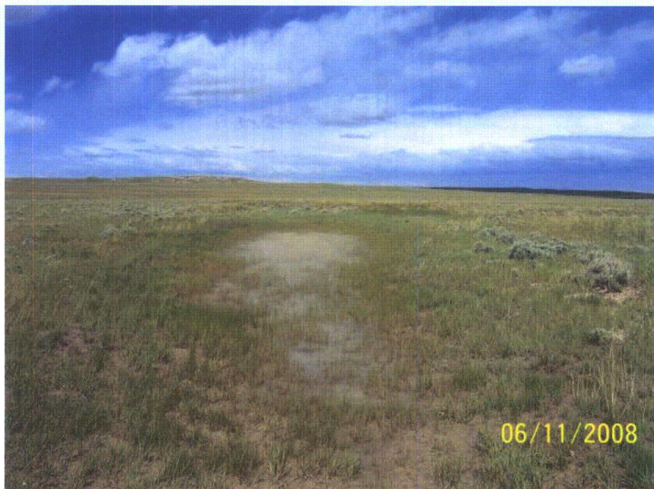
Photo 62: WL-27a. Emergent wetland in Sage Creek Tributary 4 S. Looking northeast.