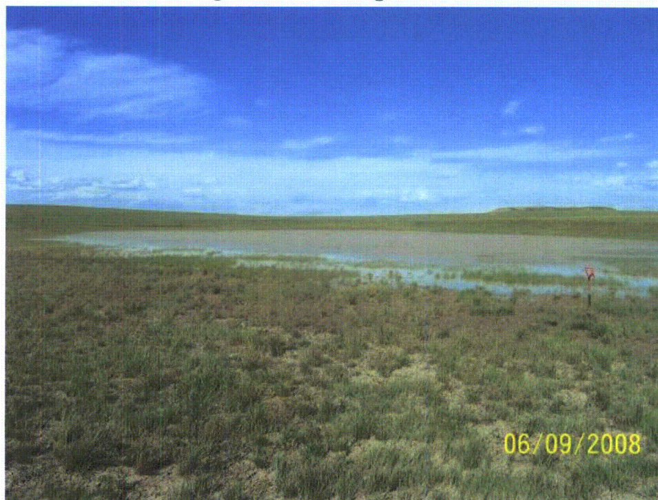
Photo 49: WL-16. Isolated emergent wetland within depression in Sage Creek Tributary 4 drainage. Looking northeast.