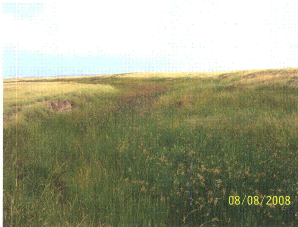
Photo 74: WL-37s. Emergent wetland in Sage Creek. Looking southeast.