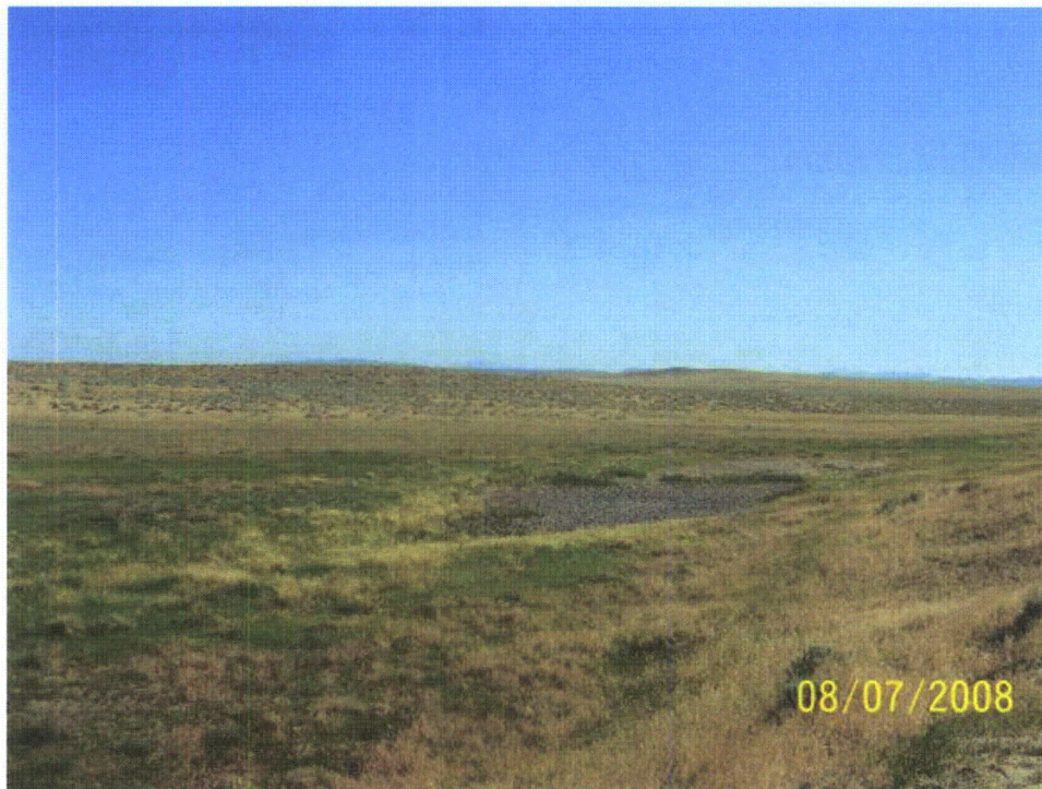
Photo 71: WL-37a. Emergent wetland in Sage Creek. Looking southeast.