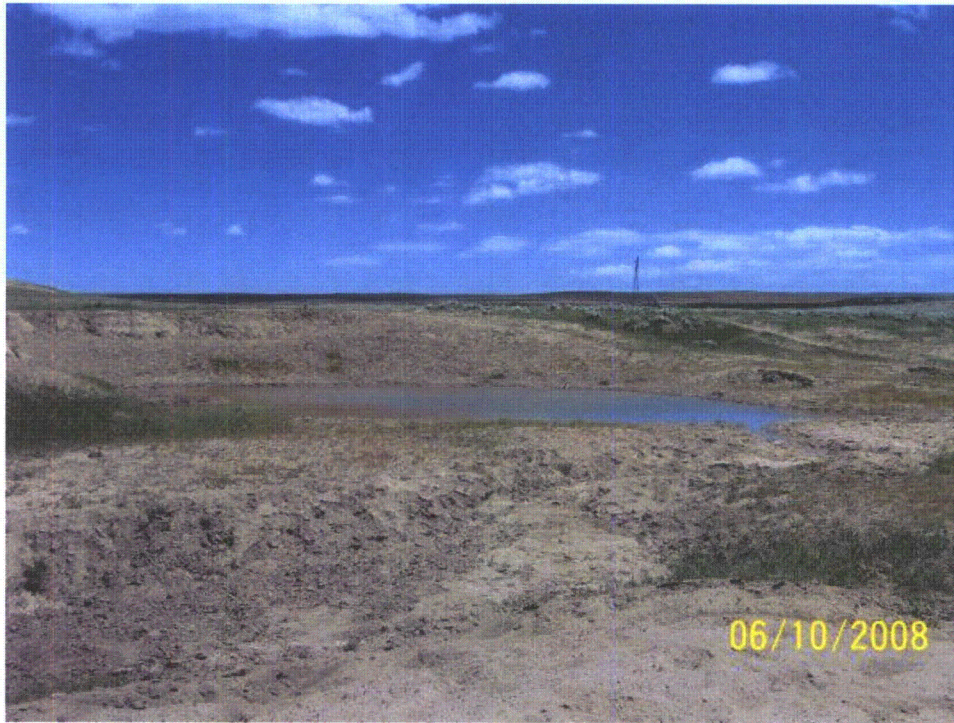
Photo 98: WB-134. Isolated waterbody piped from windmill in Sage Creek drainage area. Looking northeast.