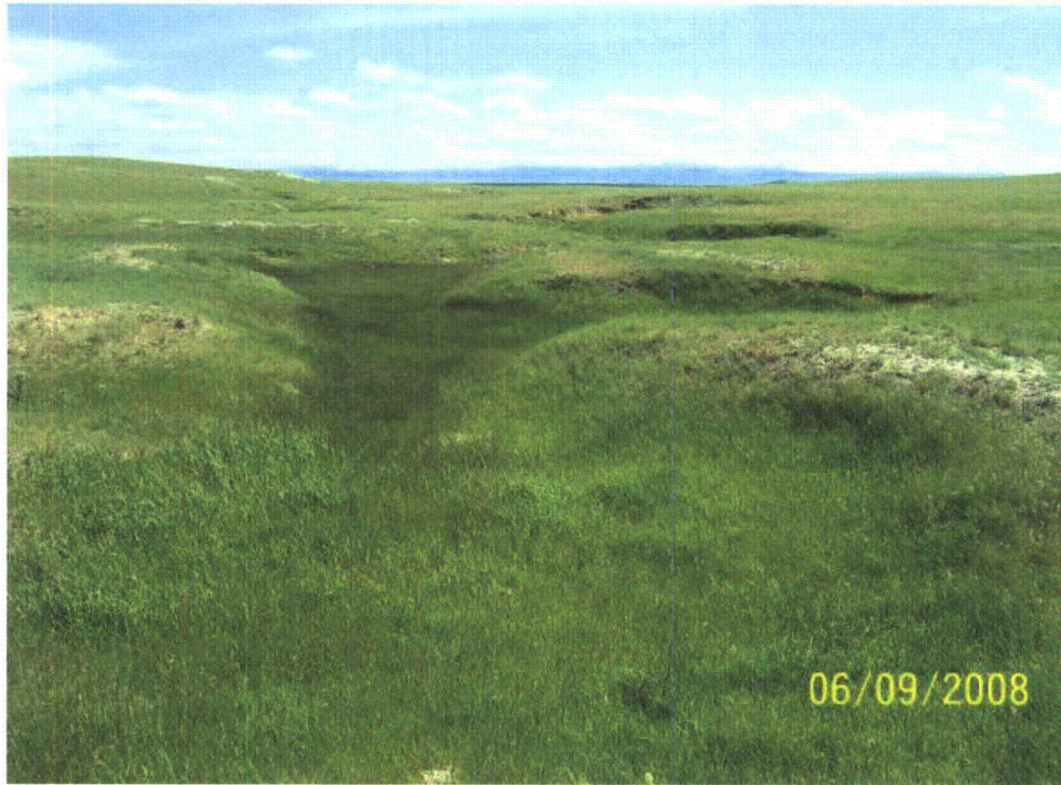
Photo 50: WL-17. Emergent wetland within depression in Sage Creek Tributary 4 drainage. Looking south.