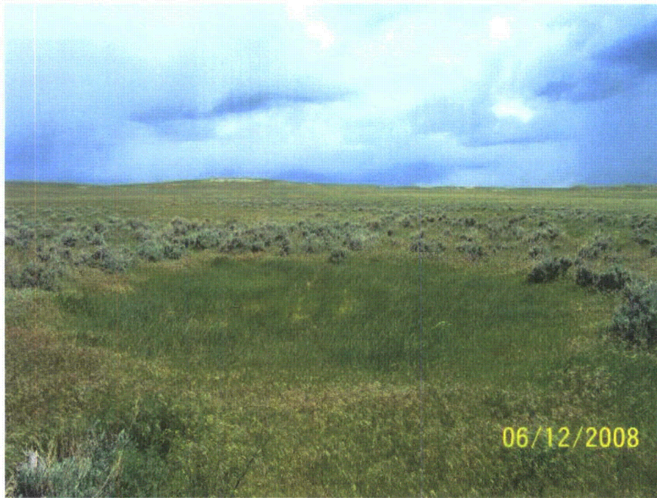
Photo 64: WL-29n. Emergent wetland in Sage Creek Tributary 4 S. Looking northwest.