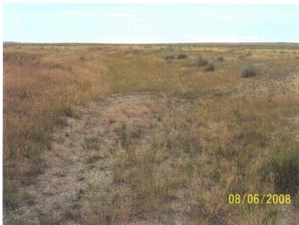
Photo 106: WB-195. Waterbody in depression in Sage Creek Tributary 7. Looking north.