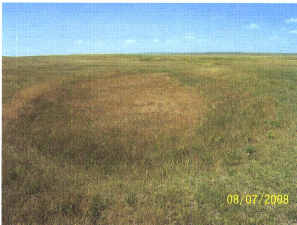
Photo 41: WL-9b. Emergent wetland in depression within Sage Creek Tributary 1 drainage. Looking west.