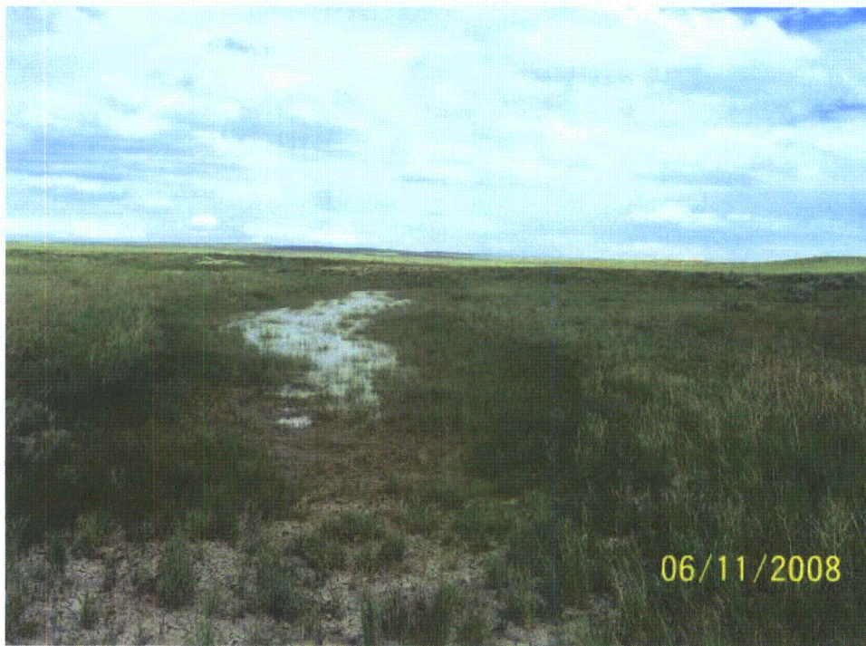
Photo 60: WL-26f. Emergent wetland behind diked channel in Sage Creek Tributary 4. Looking east.