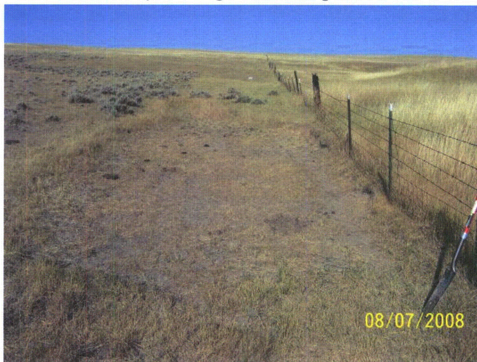
Photo 45: WL-11a. Emergent wetland within depression in Sage Creek Tributary 3 drainage. Looking west.