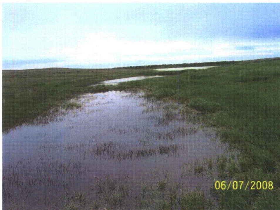
Photo 54: WL-19a & b. Emergent wetlands upgradient of diked water body in Sage Creek Tributary 4 NW. WL-19a is in foreground. Looking east.