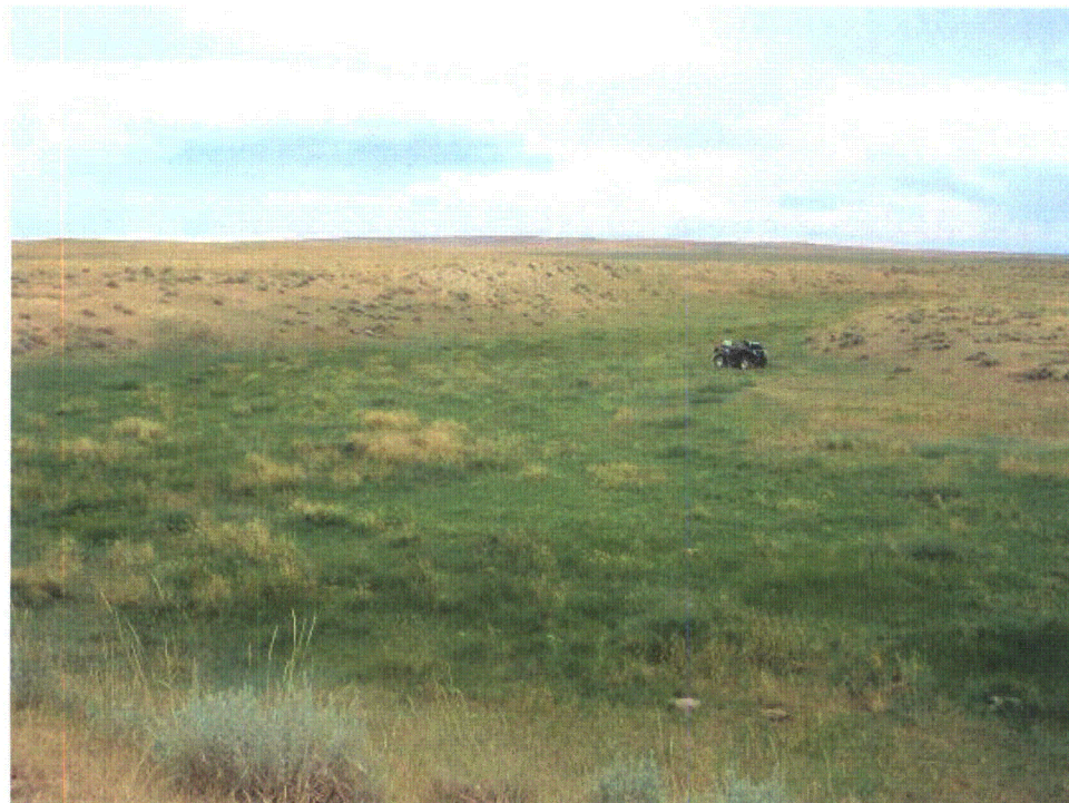
Photo 69: WL-33a. Emergent wetland in Sage Creek Tributary 4. Looking southeast.