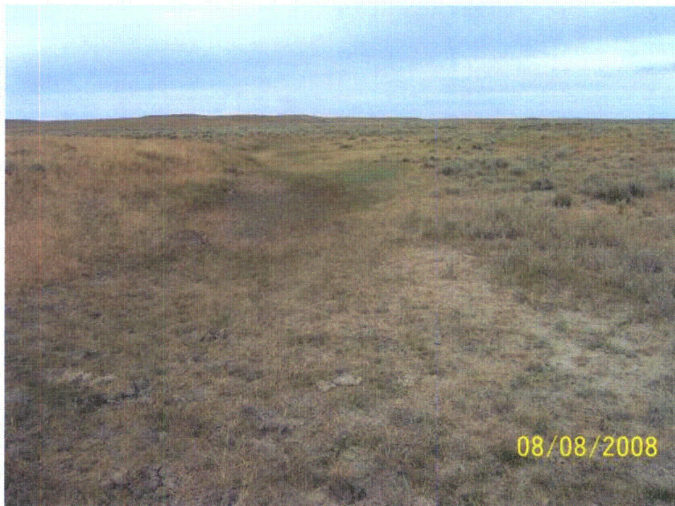
Photo 97: WB-130. Waterbody in depression in Sage Creek Tributary 4. Looking northwest.