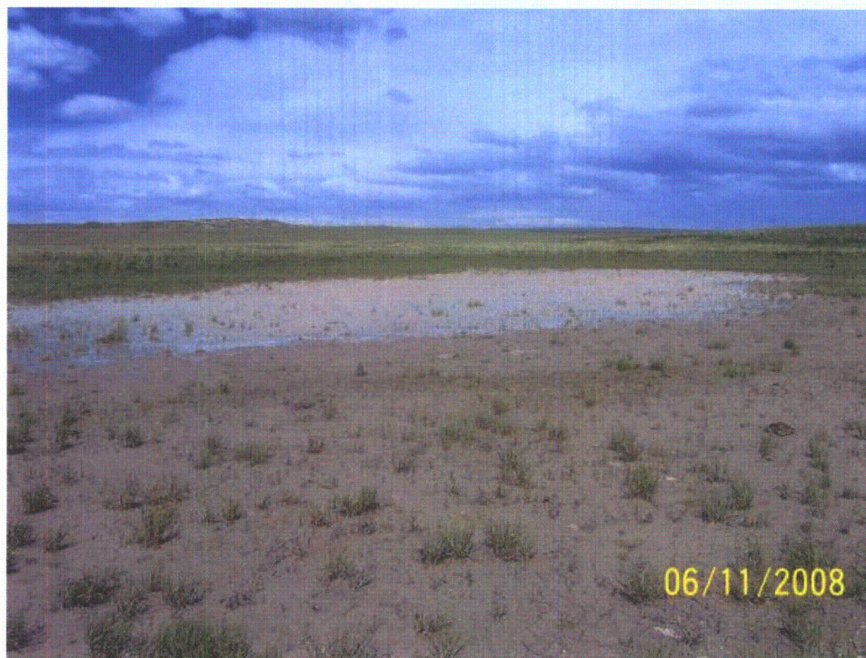
Photo 94: WB-103. Isolated waterbody in depression in Sage Creek Tributary 4 W drainage area. Looking northeast.