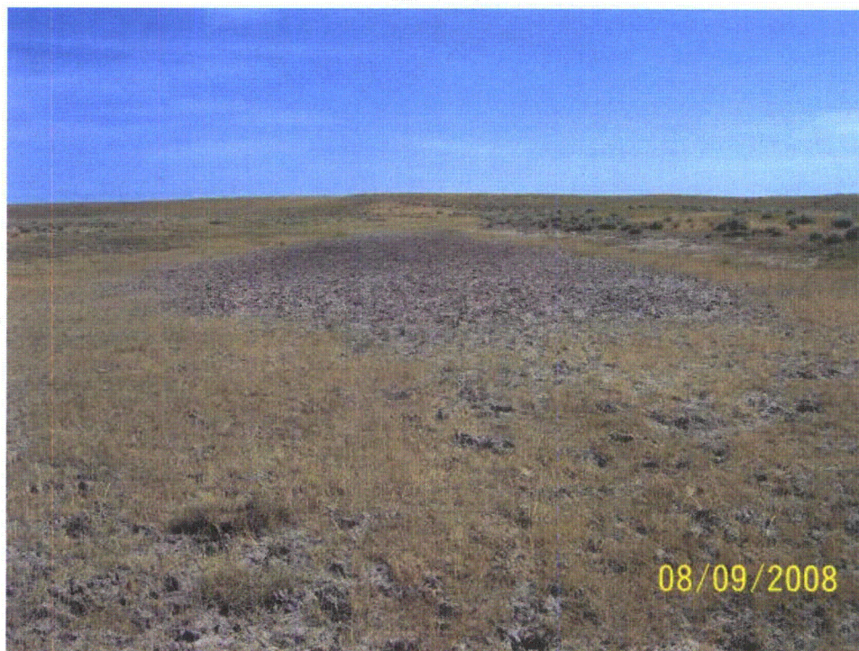
Photo 104: WB-191. Waterbody in depression in tributary to Sage Creek. Looking northeast.