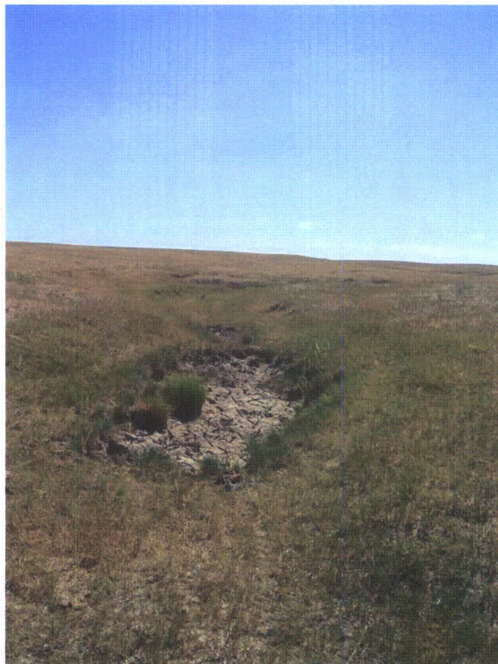
Photo 99: WB-141. Waterbody in depression in Sage Creek Tributary 6. Looking southwest.