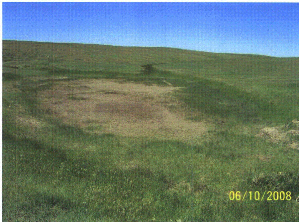
Photo 46: WL-12. Emergent wetland within depression in Sage Creek Tributary 2 drainage. Looking west.