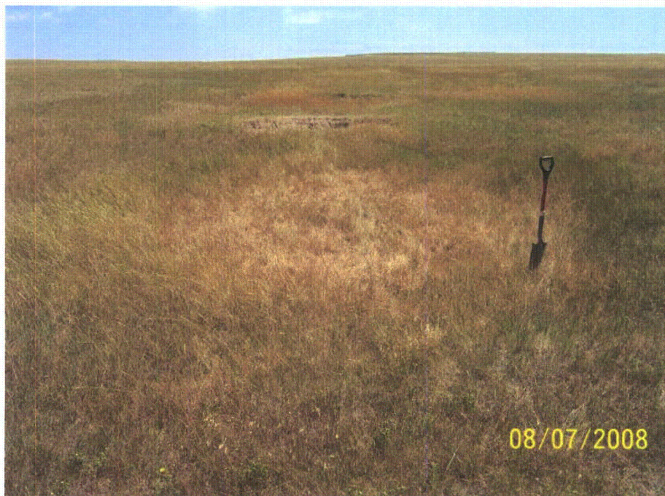
Photo 40: WL-9a. Emergent wetland in depression within Sage Creek Tributary 1 drainage. Looking east.