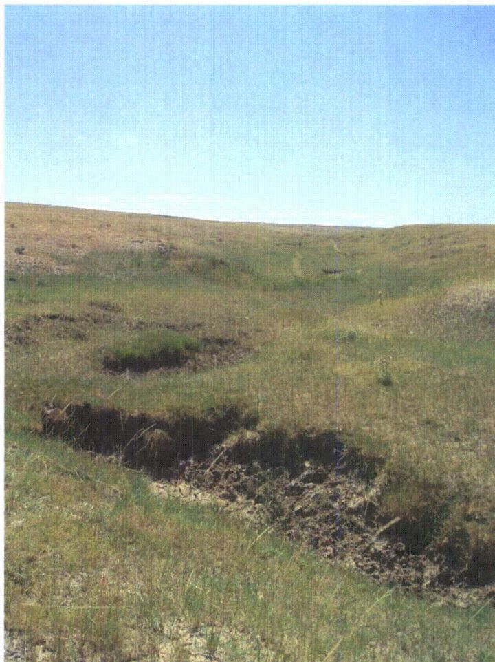
Photo 100: WB-151. Waterbody in depression in Sage Creek Tributary 6. Looking southwest.