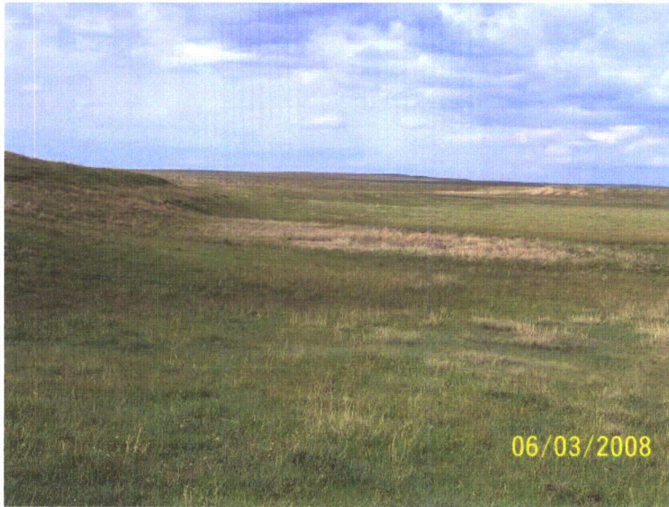
Photo 76: WL-38. Emergent slope wetland in Sage Creek. Looking northeast.