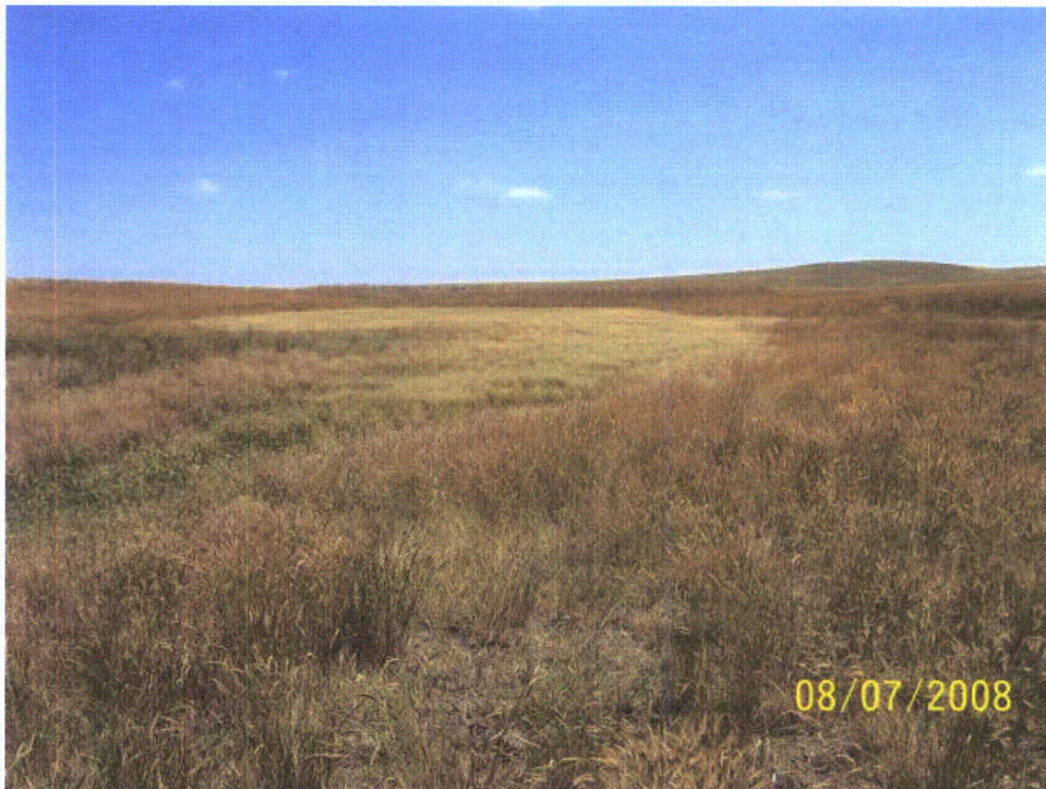
Photo 59: WL-22. Emergent wetland behind diked channel in Sage Creek Tributary 4 NW. Looking southeast.