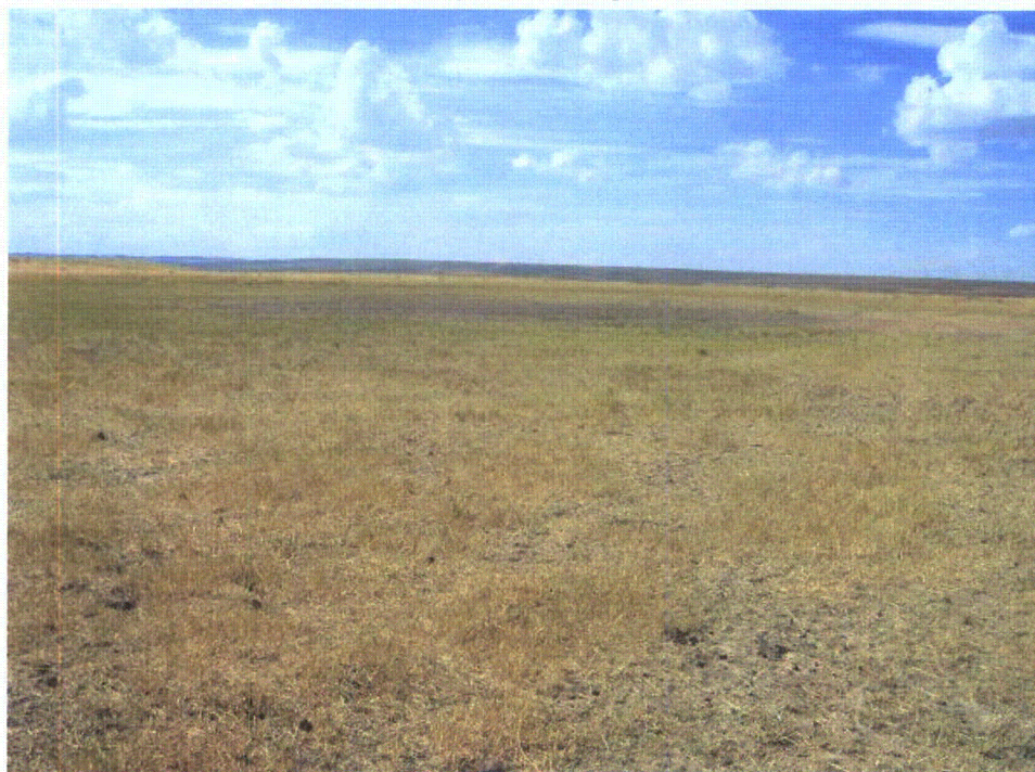
Photo 43: WL-9e. Emergent wetland in depression within Sage Creek Tributary 1 drainage. Looking west.