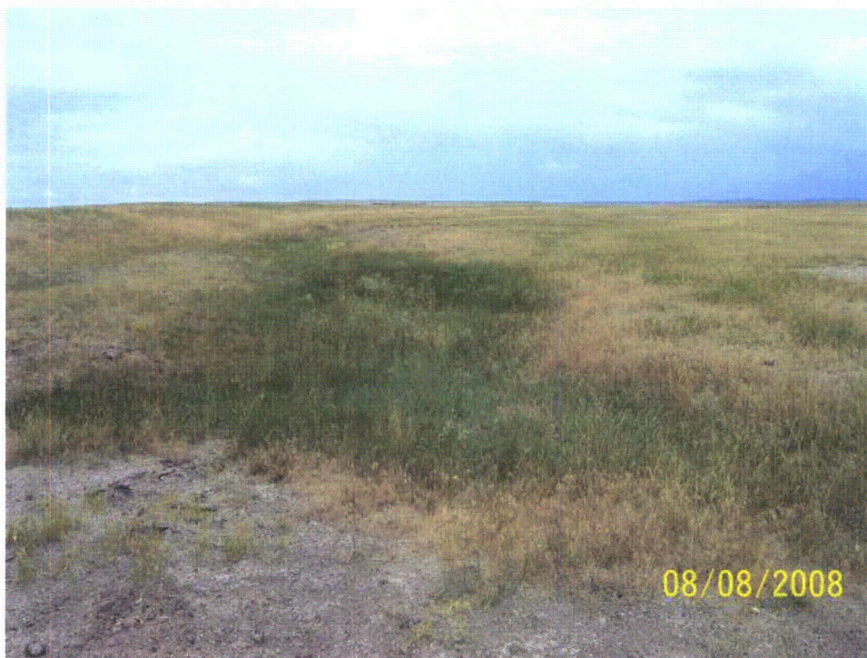
Photo 73: WL-37n. Emergent wetland in Sage Creek. Looking southeast.