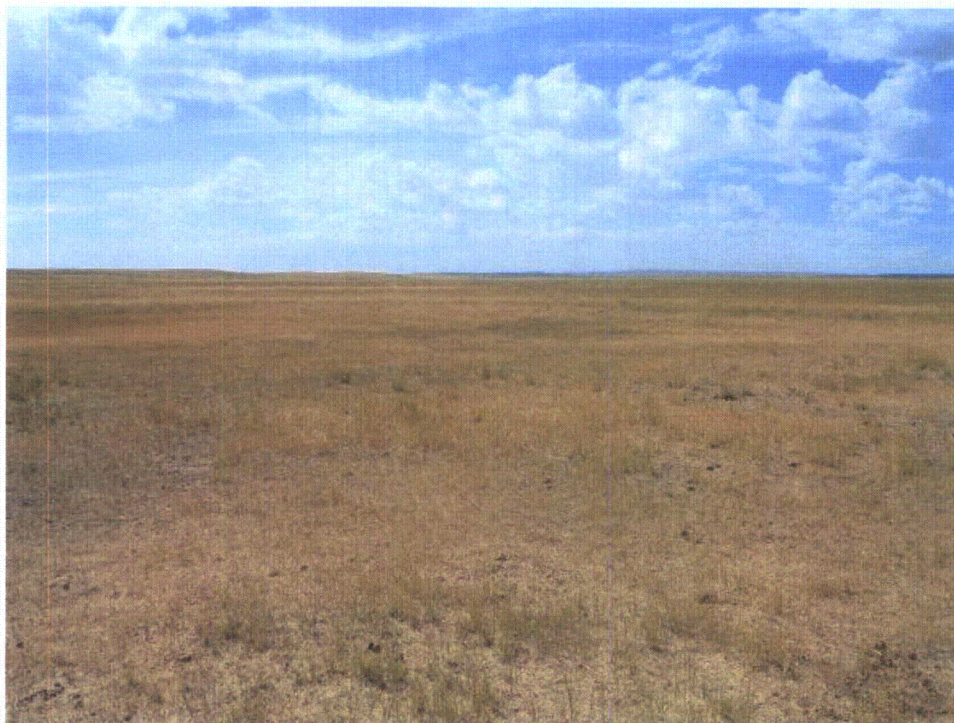
Photo 42: WL-9d. Emergent wetland in depression within Sage Creek Tributary 1 drainage. Looking west.