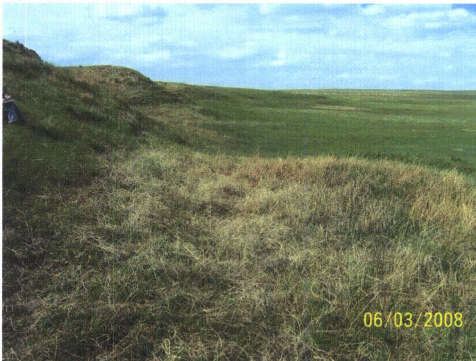
Photo 77: WL-39. Emergent slope wetland in Sage Creek. Looking north.