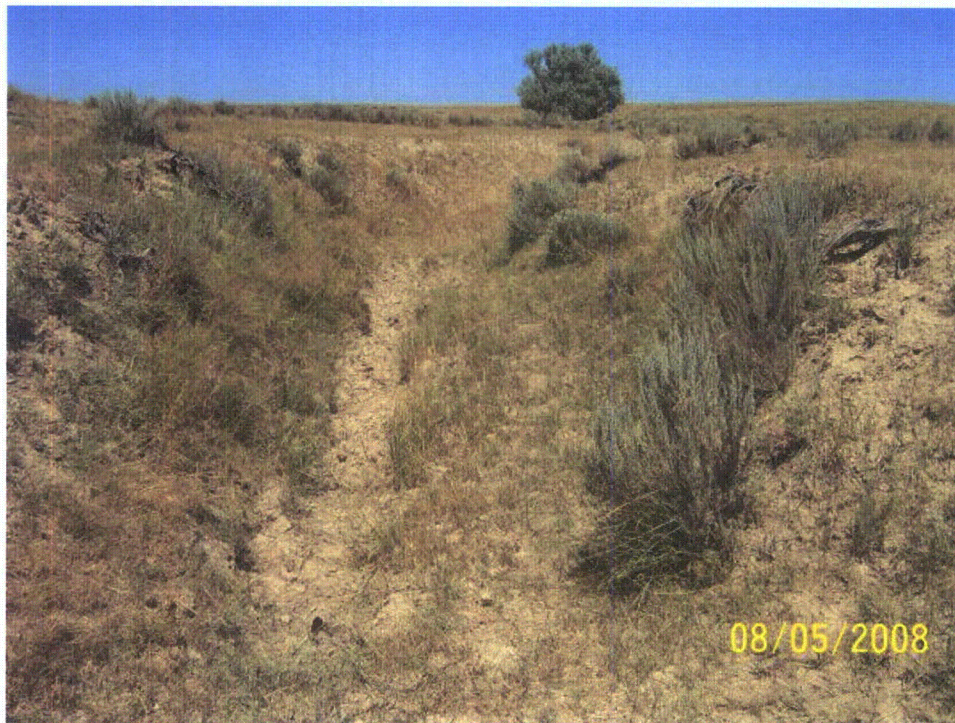
Photo 31: WB-58. Depression in drainage in tributary to Running Dutchman Ditch. Looking north.