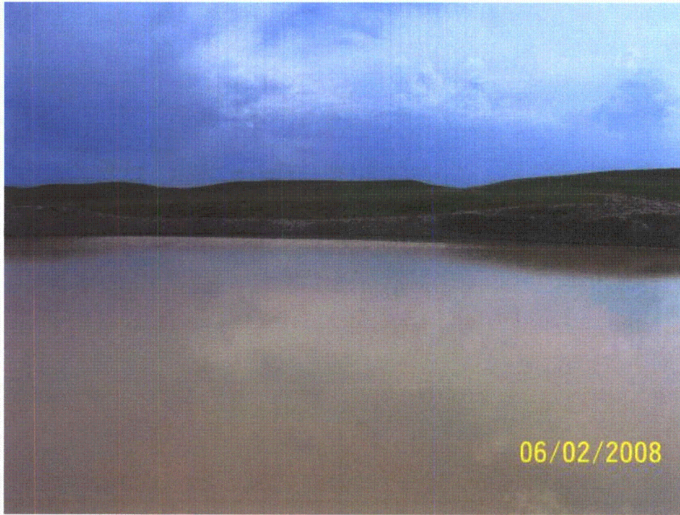
Photo 37: WB-66. Diked tributary to Running Dutchman Ditch. Looking west.