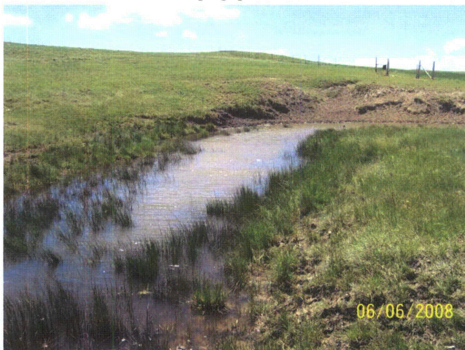
Photo 2: WL-1m, Little Sand Creek. Looking southwest. Emergent wetland.