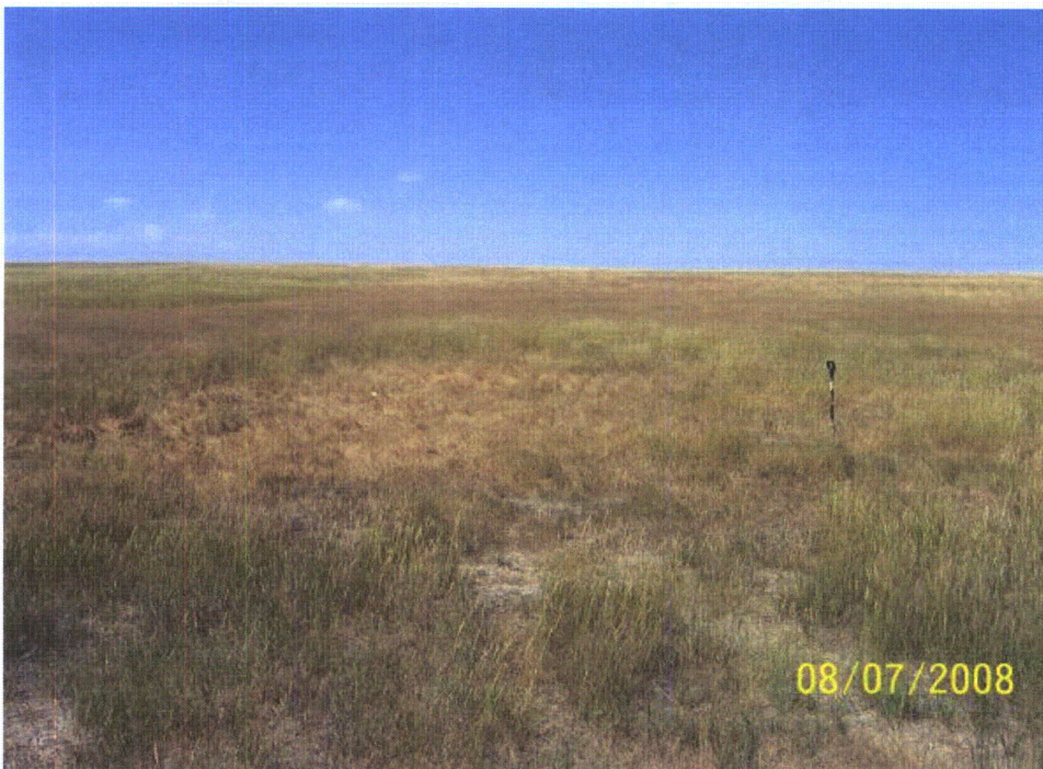
Photo 39: WL-8. Isolated emergent wetland within depression in Sage Creek Tributary 1 drainage area. Looking northwest.