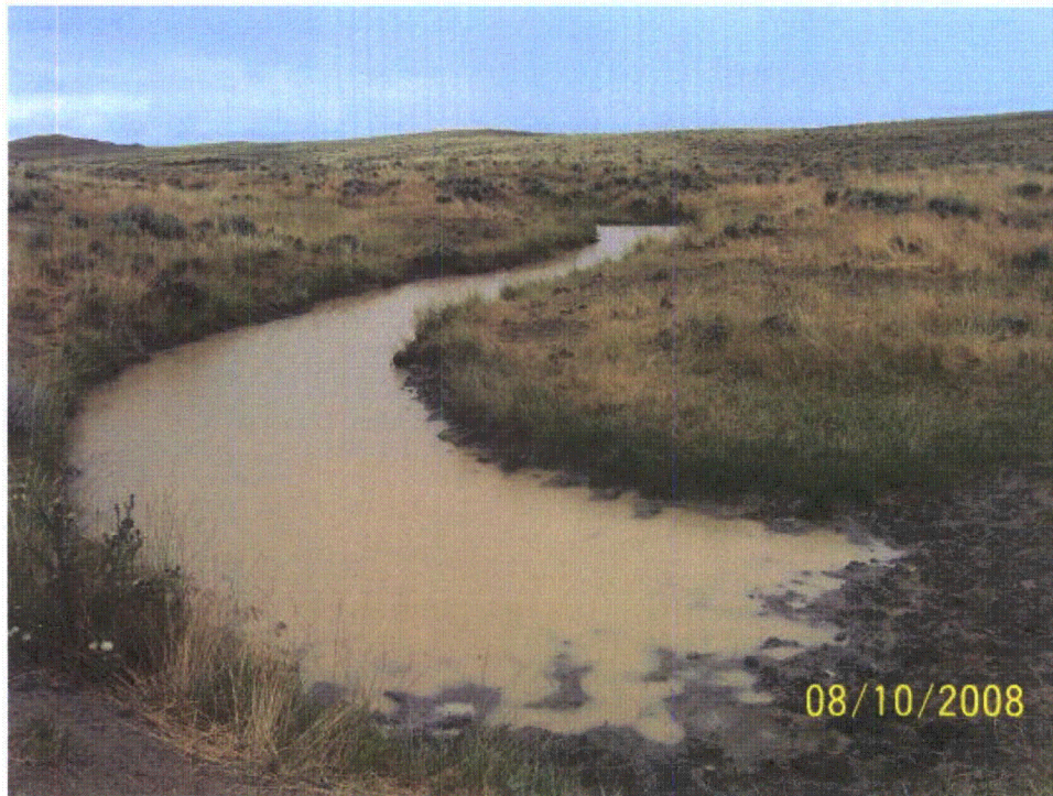
Photo 13: WB-14. Discontinuous depression in tributary to Little Sand Creek. Looking north.