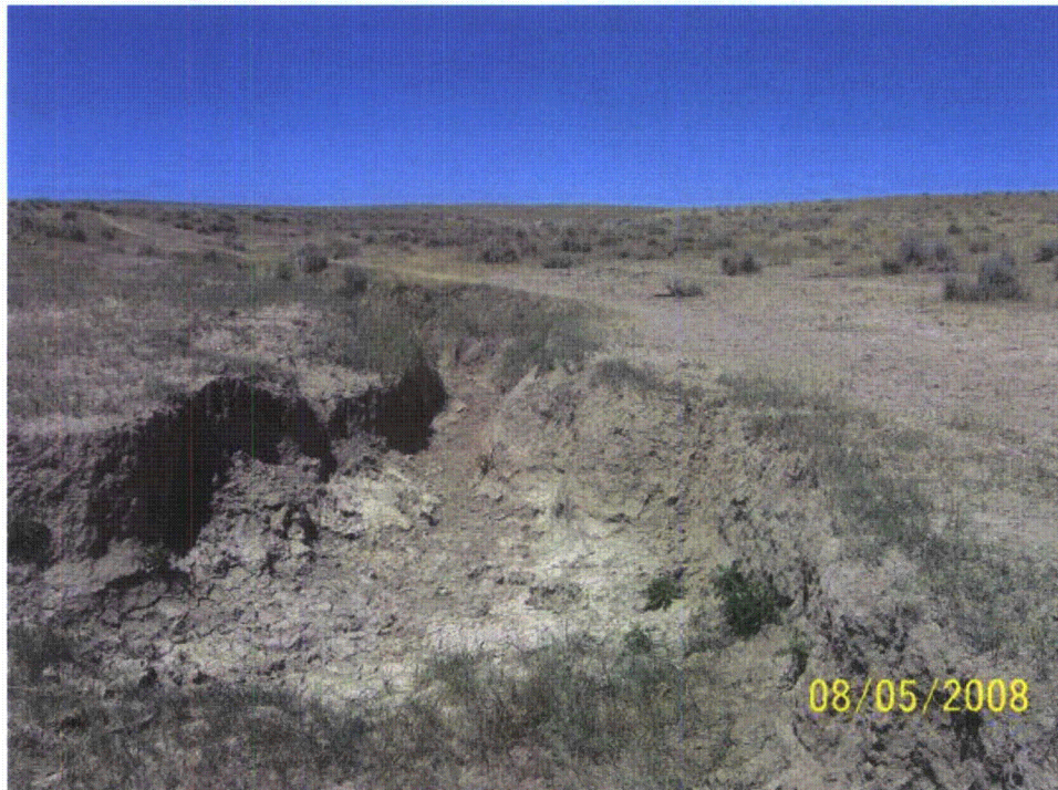
Photo 30: WB-56. Depression in drainage in tributary to Running Dutchman Ditch. Looking north.