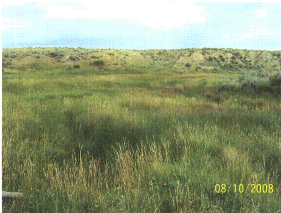
Photo 6: WL-3c. Little Sand Creek. Emergent wetland. Looking southeast.