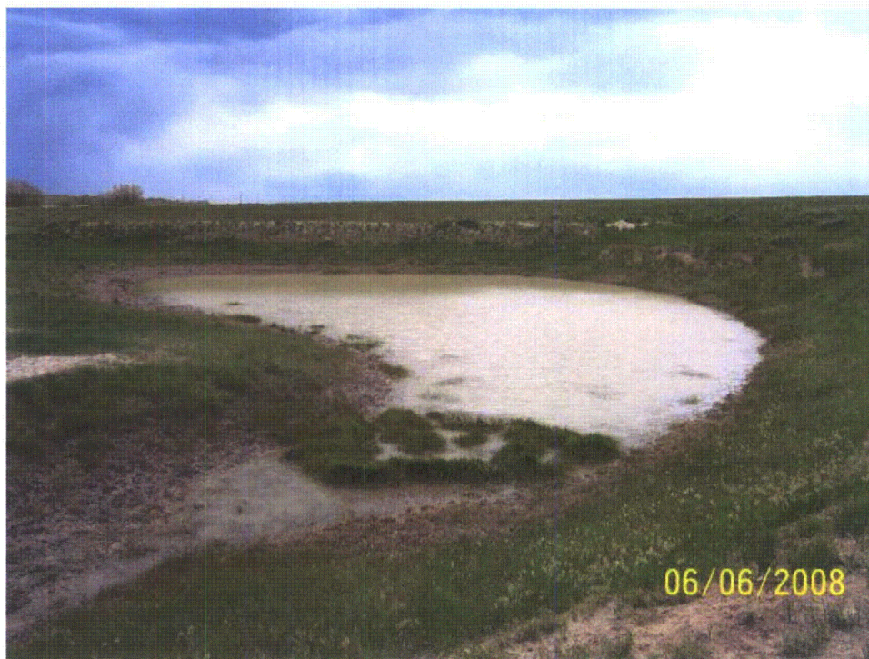
Photo 9: WB-3. Diked tributary to Little Sand Creek. Looking northwest.