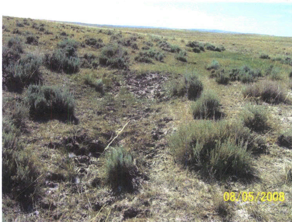
Photo 24: WB-44. Depression in drainage in tributary to Running Dutchman Ditch. Looking north.