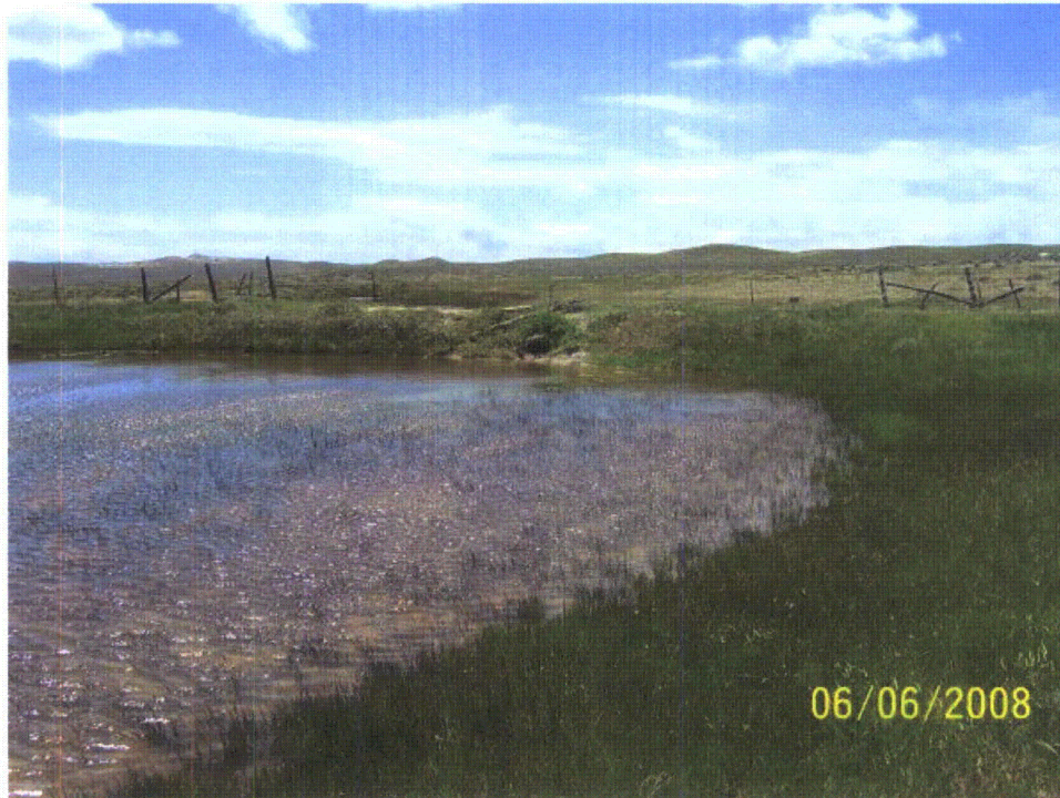
Photo 3: WL-10, Little Sand Creek. Emergent wetland, Looking southwest towards Section 15.