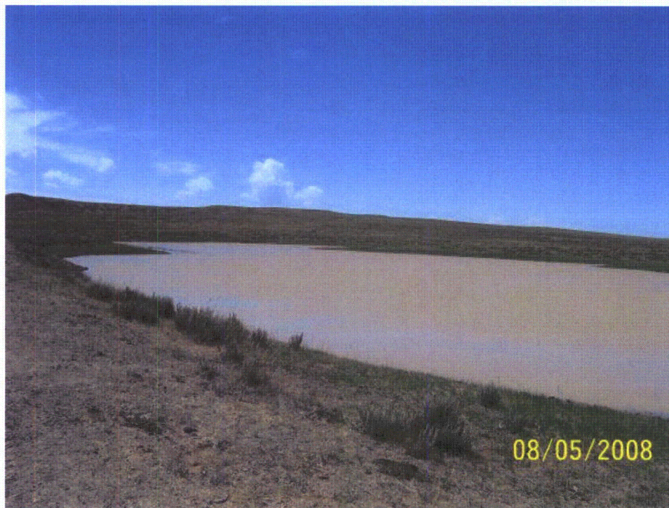
Photo 23: WB-43. Diked tributary to Running Dutchman Ditch. Looking west.