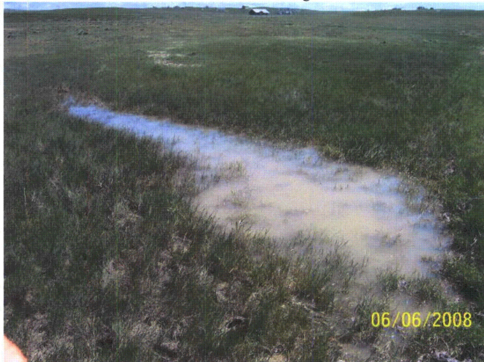
Photo 1: WL-1a, Little Sand Creek. Looking northeast. Emergent wetland with creeping spike rush.