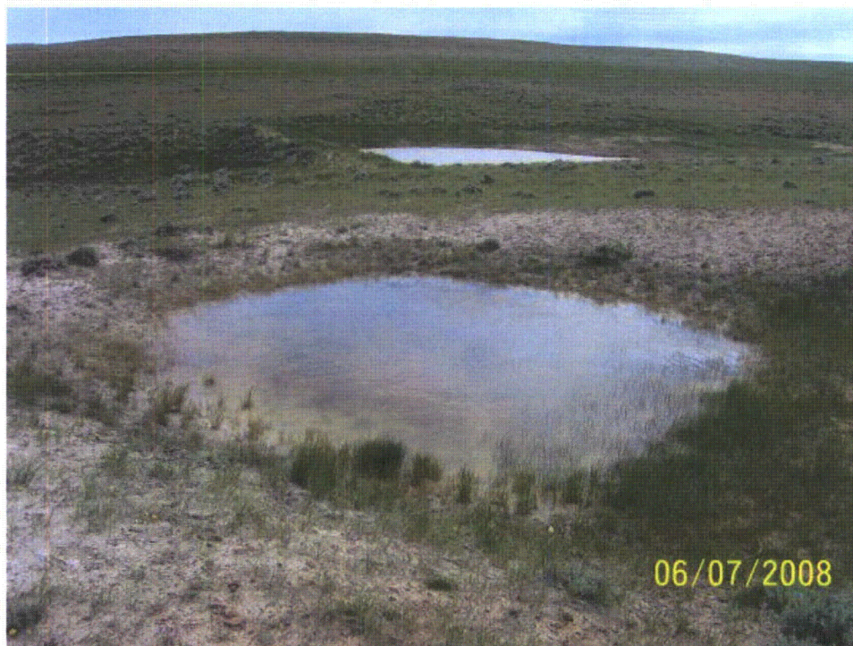
Photo 8: WB-2. Isolated waterbody. Looking northeast, WB-1 in background.