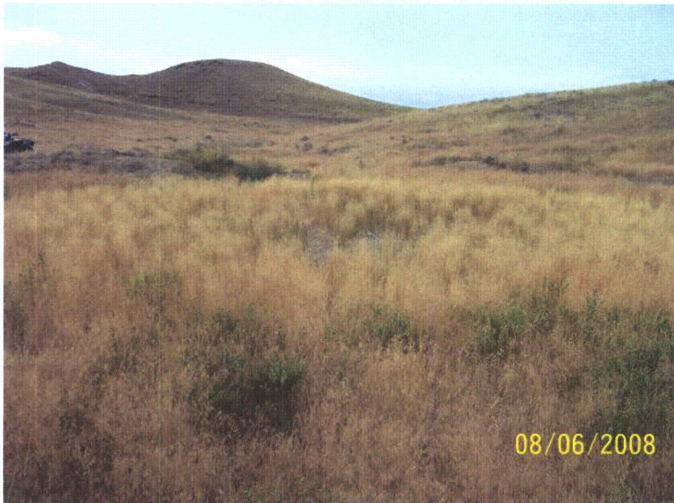
Photo 17: WL-6. Emergent wetland in diked drainage within Running Dutchman Ditch tributary. Looking east.