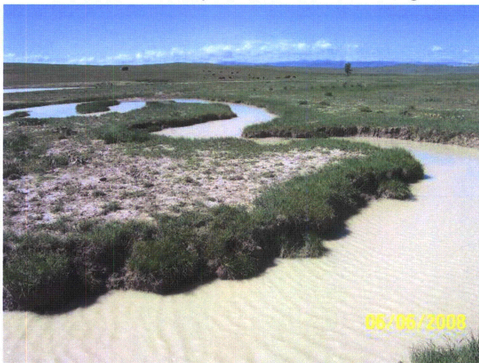
Photo 10: WB-5. Discontinuous depression in tributary to Little Sand Creek. Looking south.