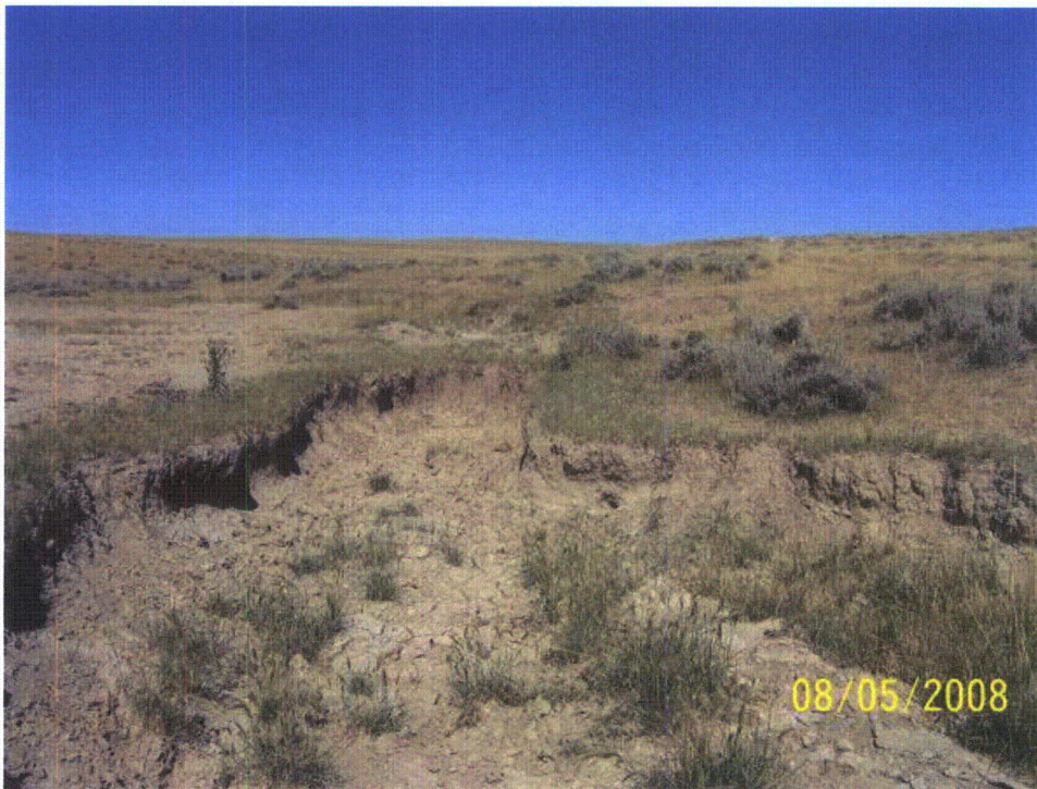
Photo 26: WB-48. Depression in drainage in tributary to Running Dutchman Ditch. Looking northeast.