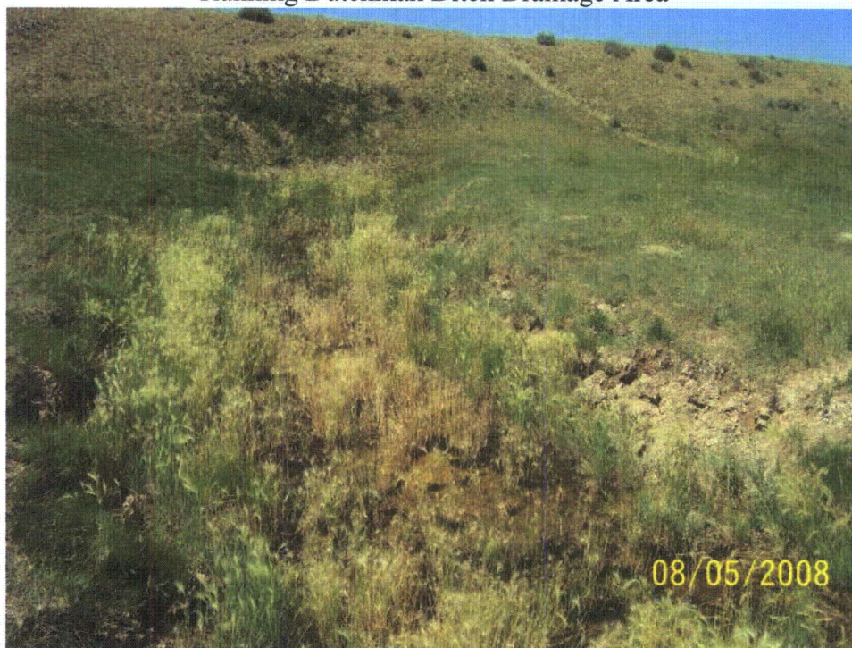
Photo 15: WL-4. Emergent wetland in depression in drainage on back side of dike. Tributary to Running Dutchman Ditch. Looking northwest.