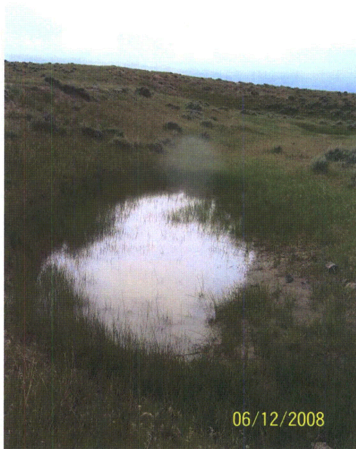
Photo 22: WB-21. Diked tributary to Running Dutchman Ditch. Looking southwest.