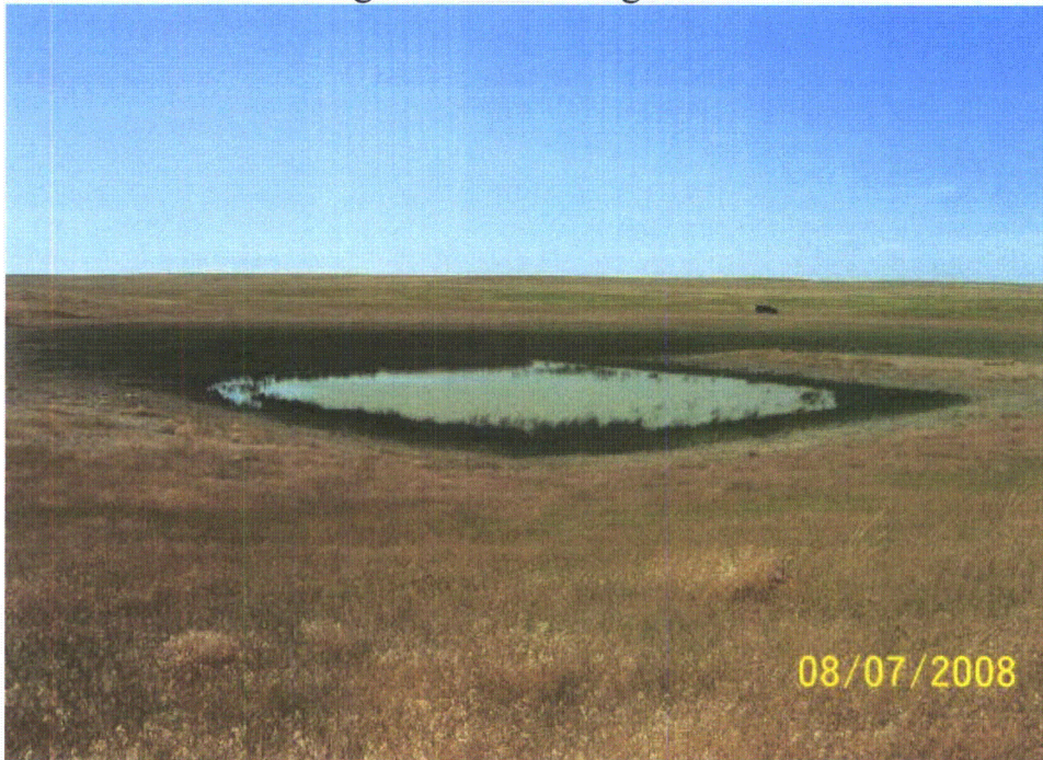
Photo 38: WL-7. Isolated wetland in depression within Sage Creek Tributary 1 drainage area. PEMC with PUBF area. Looking south.