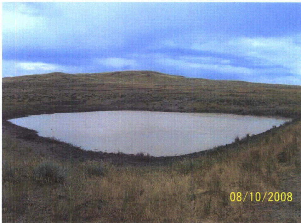
Photo 14: WB-16. Diked drainage in tributary to Little Sand Creek. Looking southeast.