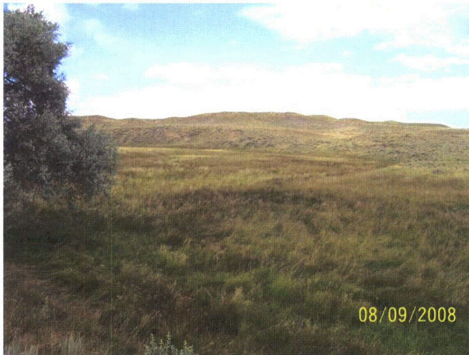
Photo 4: WL-3a, Little Sand Creek. Emergent wetland. Looking northeast.