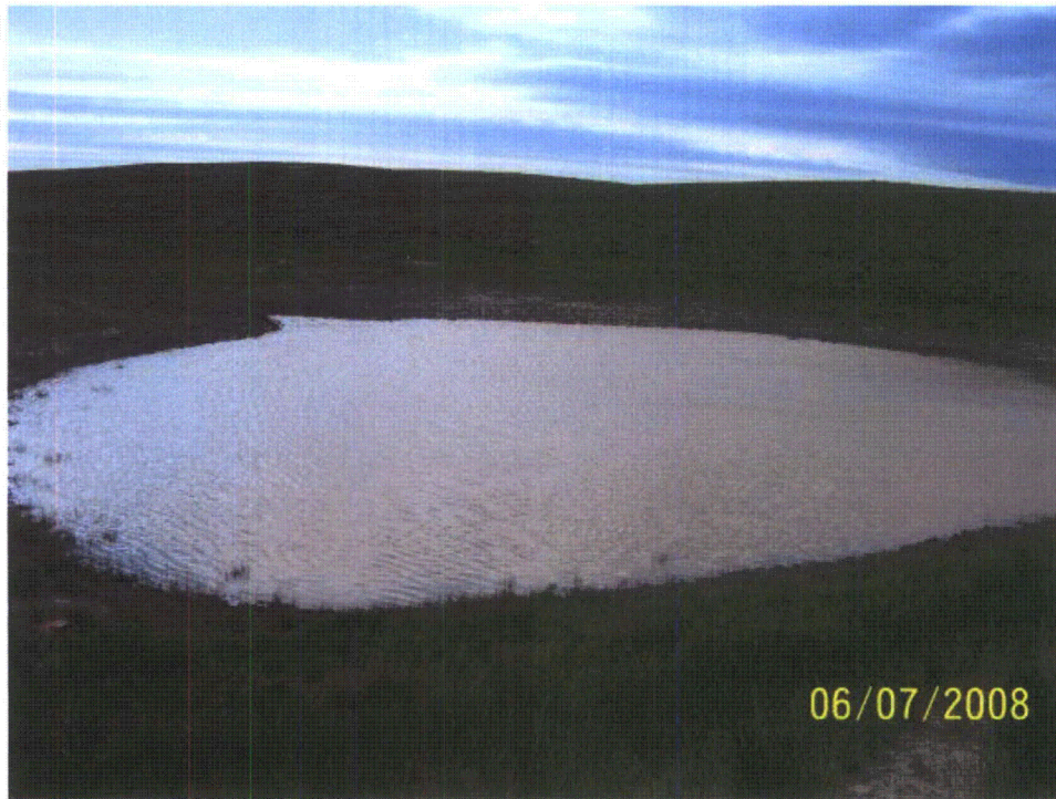
Photo 7: WB-1. Diked tributary to Little Sand Creek. Looking southeast.