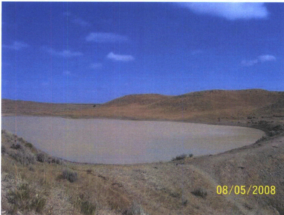
Photo 32: WB-61. Diked tributary to Running Dutchman Ditch. Looking northwest.