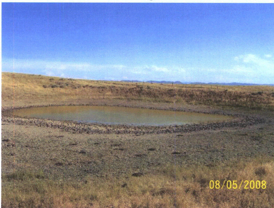
Photo 36: WB-65. Diked tributary to Running Dutchman Ditch. Looking southeast.