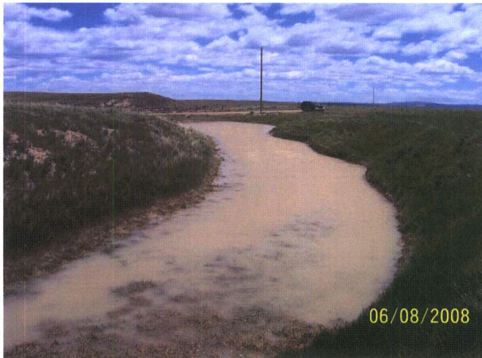
Photo 21: WB-20. Tributary to Running Dutchman Ditch at County Road. Looking southeast.