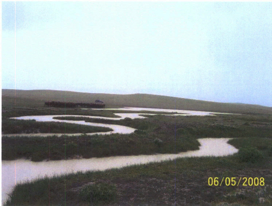
Photo 11: WB-7. Diked waterbody within Little Sand Creek. Looking south.