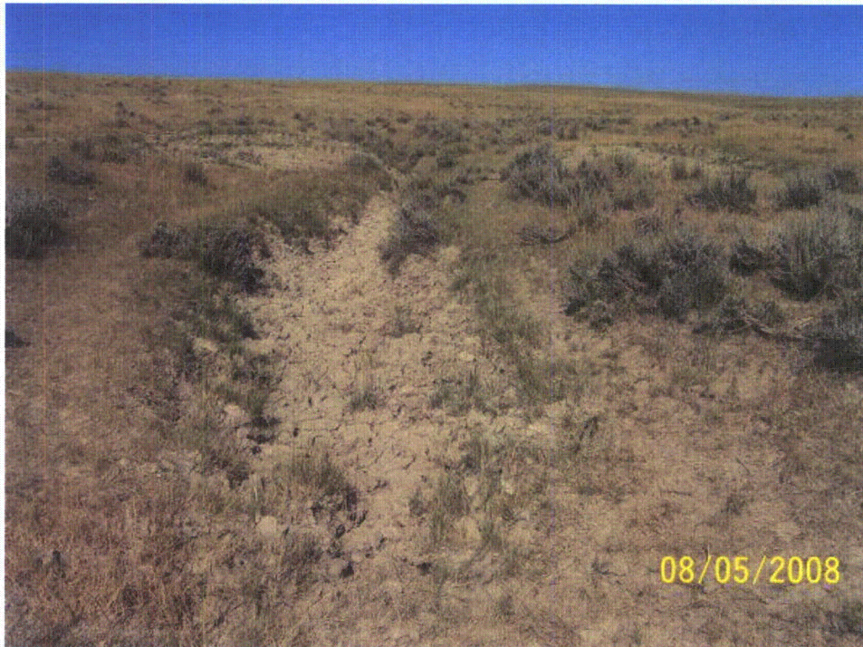
Photo 25: WB-45. Depression in drainage in tributary to Running Dutchman Ditch. Looking north.