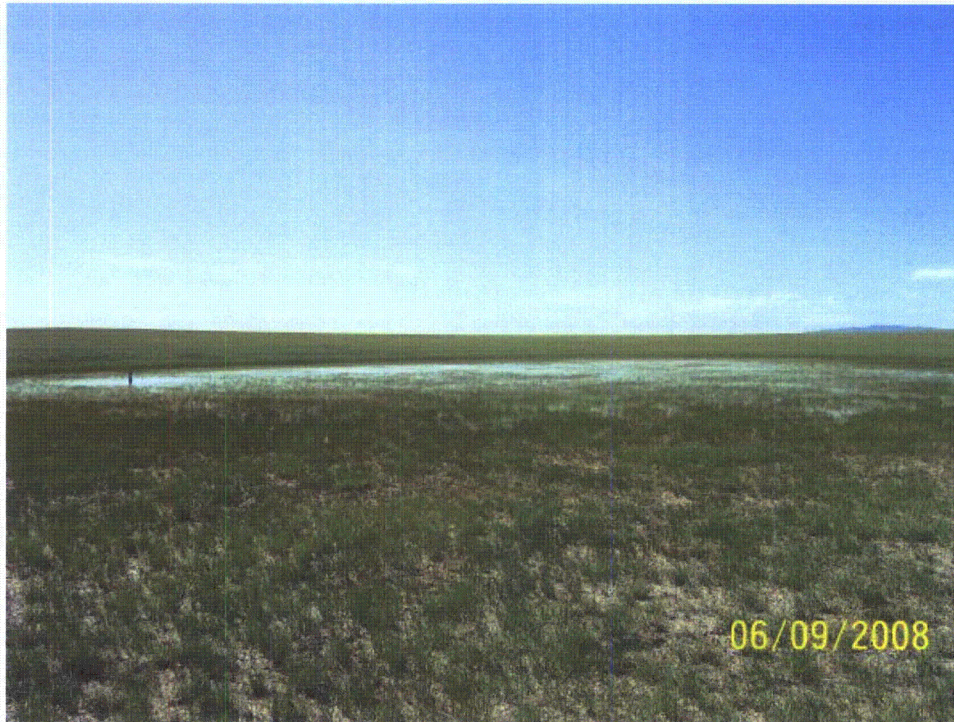
Photo 16: WL-5. Isolated emergent wetland in depression within Running Dutchman Ditch drainage area. Looking southeast.