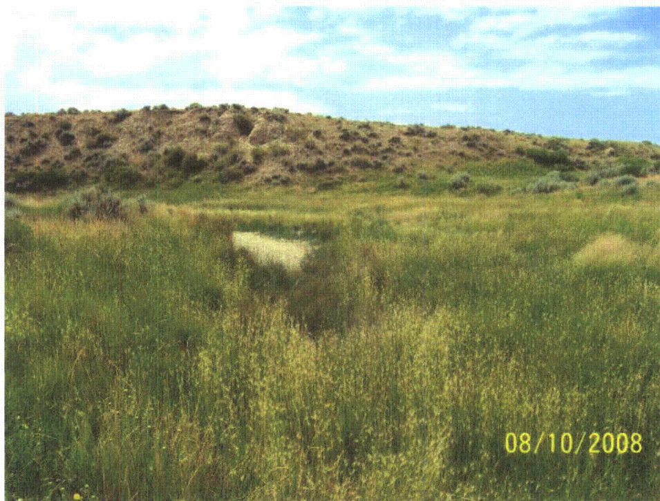
Photo 5: WL-3b. Little Sand Creek. Emergent wetland. Looking west.