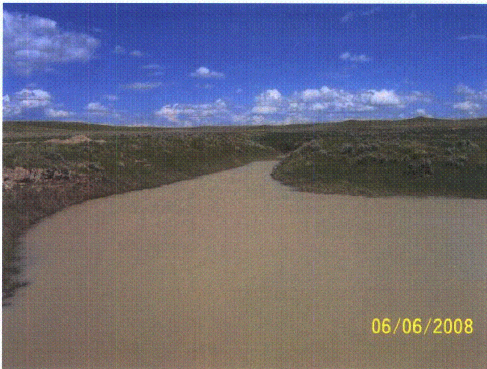
Photo 12: WB-10. Discontinuous depression in tributary to Little Sand Creek. Looking east.