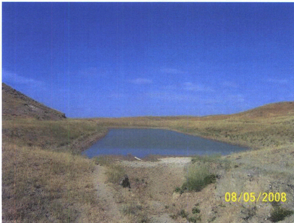
Photo 34: WB-63. Diked tributary to Running Dutchman Ditch. Looking southwest.