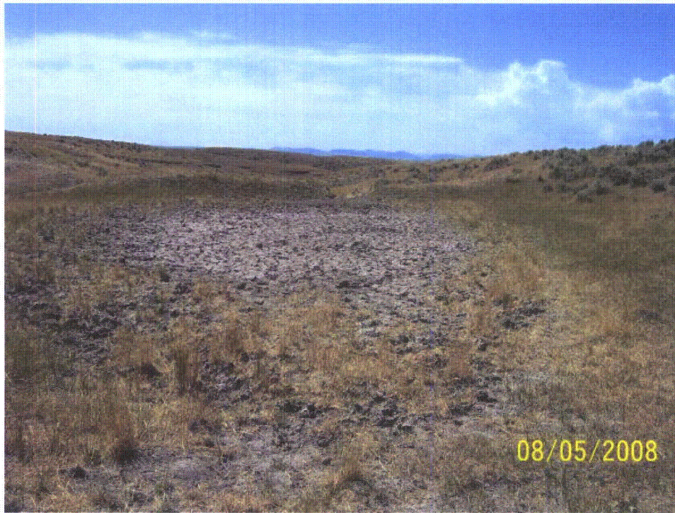
Photo 33: WB-62. Diked tributary to Running Dutchman Ditch. Looking south.