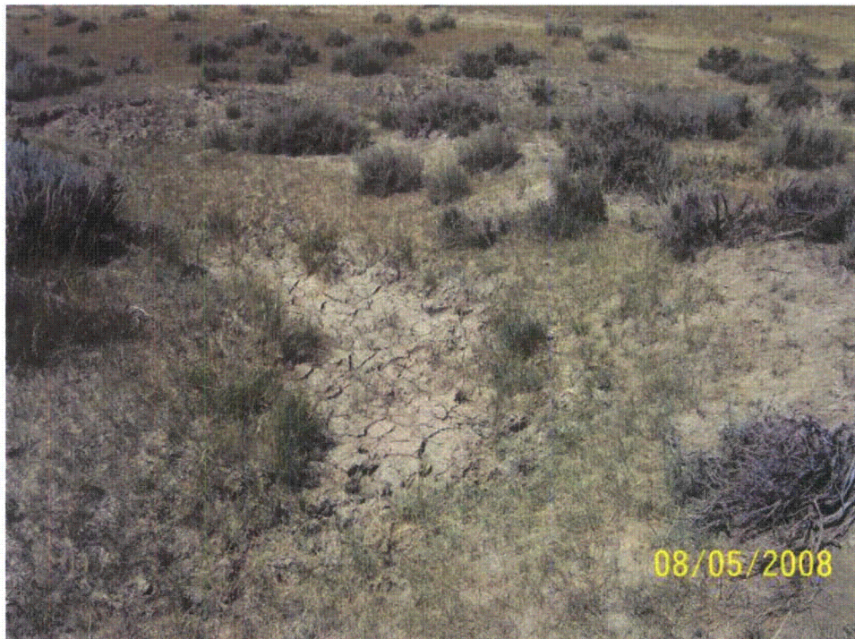
Photo 28: WB-52. Depression in drainage in tributary to Running Dutchman Ditch. Looking northwest.