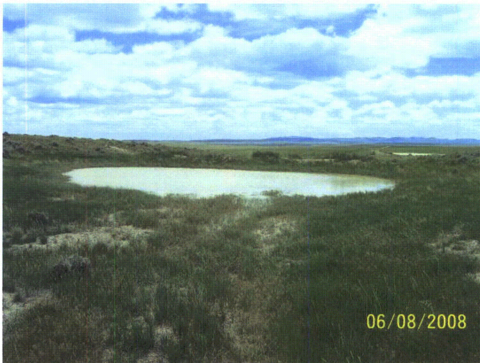
Photo 19: WB-18. Diked tributary to Running Dutchman Ditch. Looking southeast.