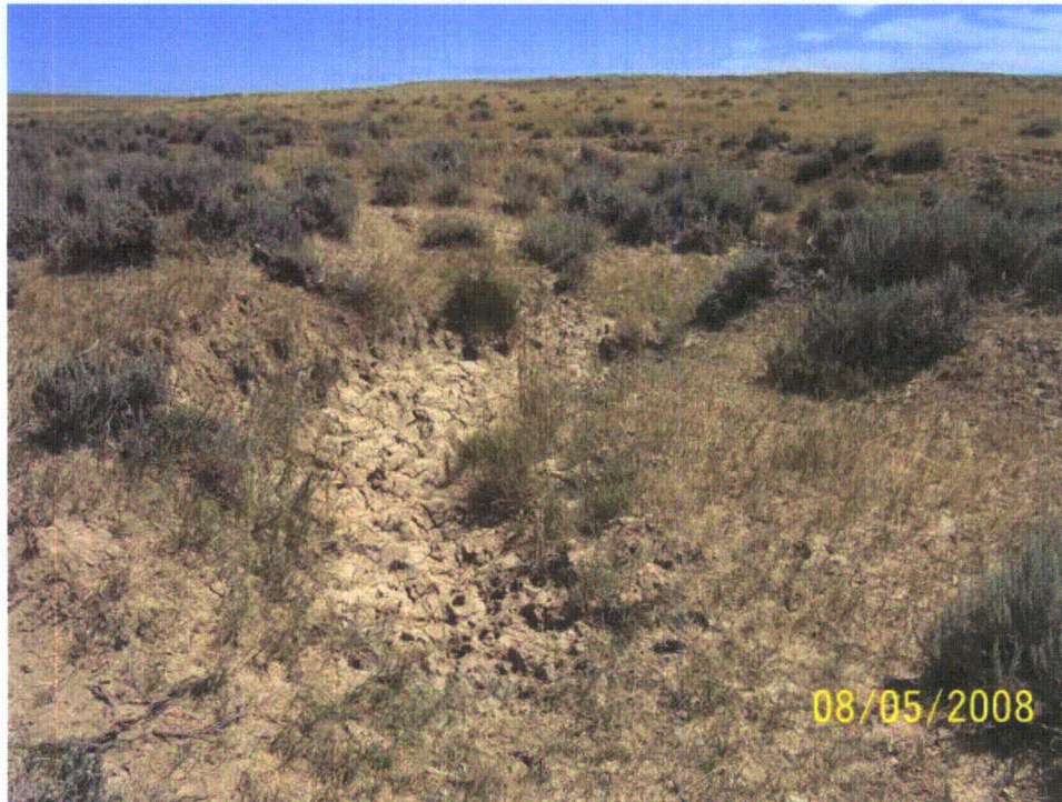
Photo 27: WB-50. Depression in drainage in tributary to Running Dutchman Ditch. Looking east.