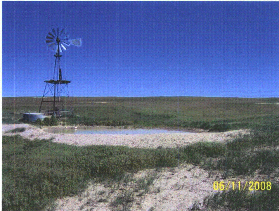
Photo 18: WB-17. Isolated depression at windmill in Running Dutchman Ditch drainage area. Looking northwest.