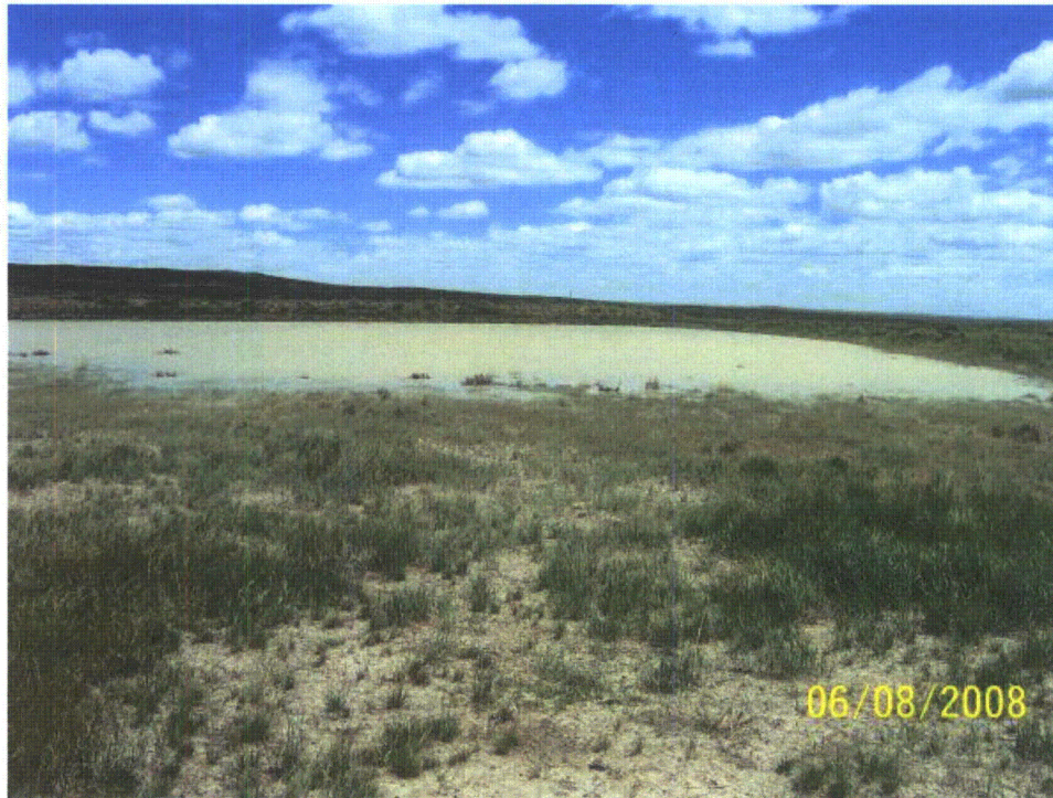
Photo 20: WB-19. Diked tributary to Running Dutchman Ditch. Looking east.