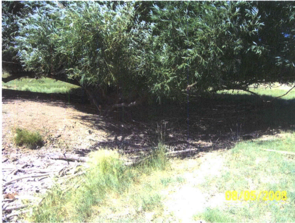
Photo 29: WB-54. Depression in drainage in tributary to Running Dutchman Ditch. Looking northwest.