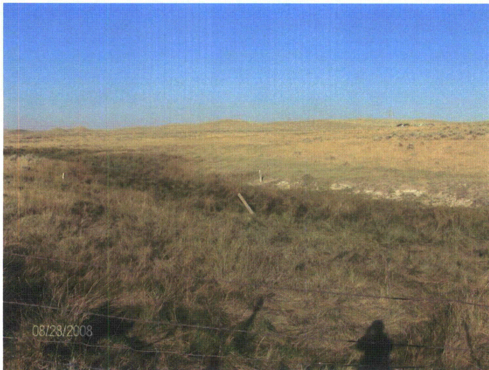
Photo 45: U22 the presence of hydrophytic vegetation in the channel