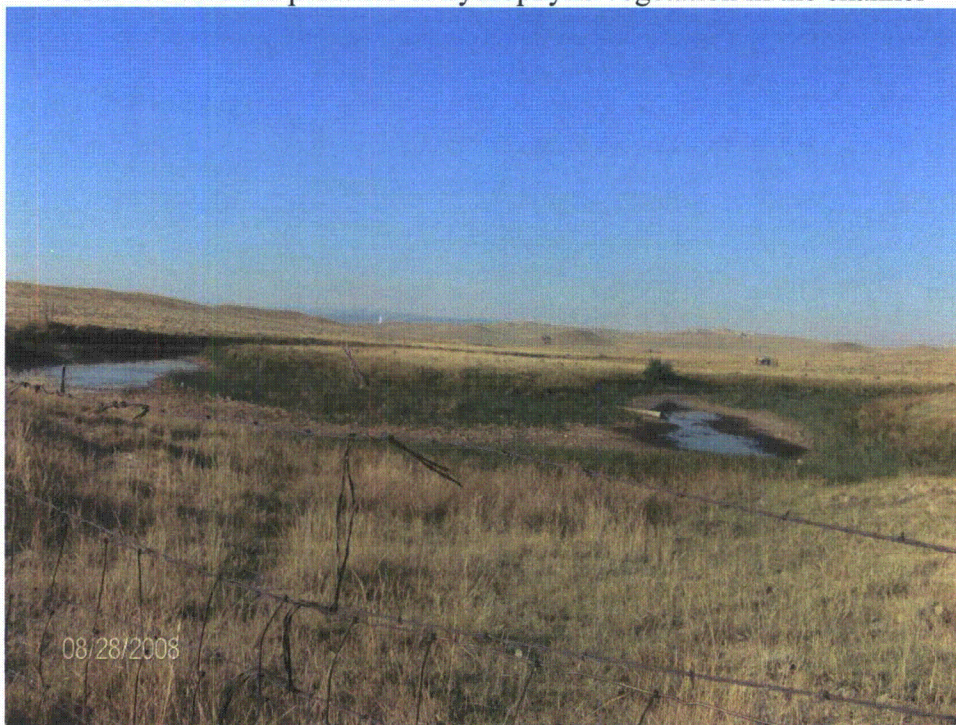
Photo 46: U22 facing west with the presence of a perennial water source