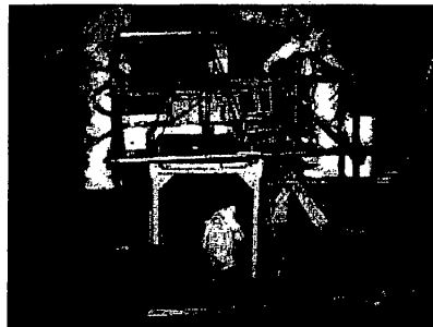
A worker at Indian Point is lowered into a man basket in the IP2 transfer canal to conduct an inspection of the steel liner.

The transfer canal is used to move fuel assemblies between the reactor cavity and the spent fuel pool. The canal is about 40 feet deep and about 20 feet long. The transfer canal was drained to allow the inspection of the liner.