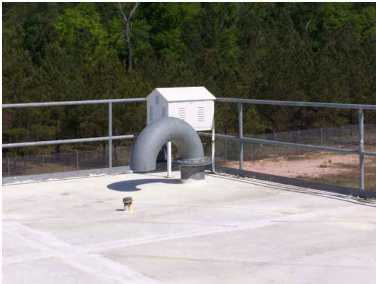
Figure 2. Twelve inch diameter pipe vent located near the north corner of Saltstone Vault #4 Cell G. The pipe elbow was removed to provide an access point for lowering the remote controlled camera.