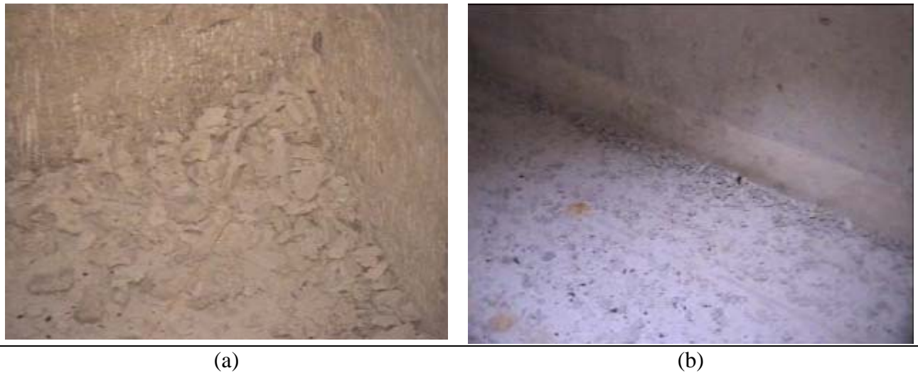
Figure 5. Close-up view of the north corner (a) and east wall of Cell G (b). There appears to be no separation of the saltstone from the vault wall along the edge of the walls in Cell G.