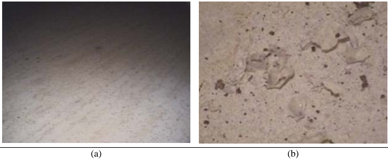
Figure 3. General view (a) and close-up view (b) of saltstone waste surface as seen from the north corner of Cell G.