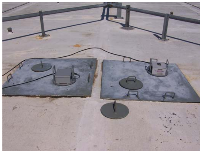
Figure 6. Access ports that could be used to lower a remote controlled vehicle for closer inspection of cracking in the saltstone surface.

cc: Mark Phifer, 773-42-A Heather Burns, 999-W Kent Rosenberger, 766-H Jack Mayer, 773-42A