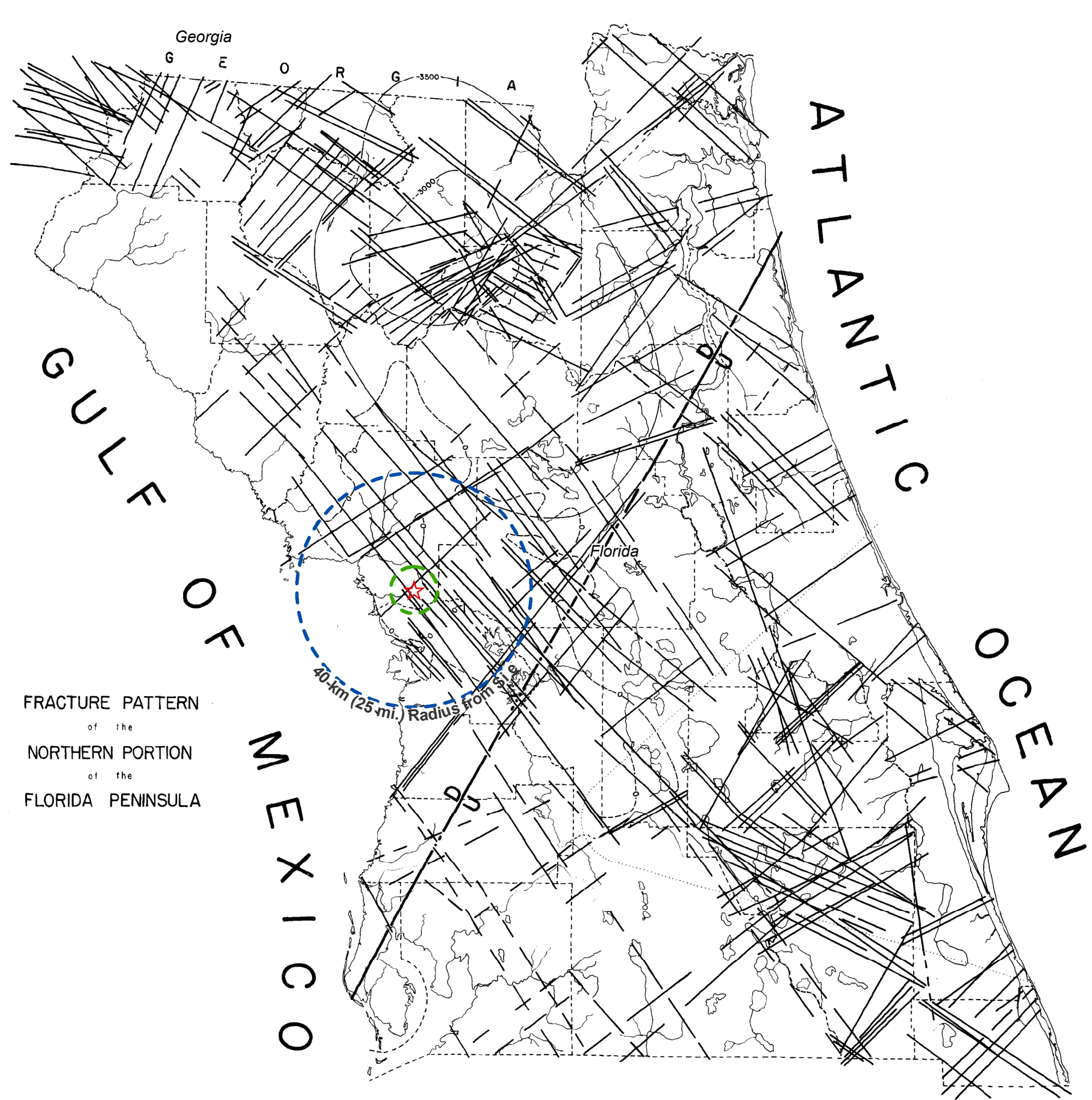
FRACTURE PATTERN of the NORTHERN PORTION of the FLORIDA PENINSULA