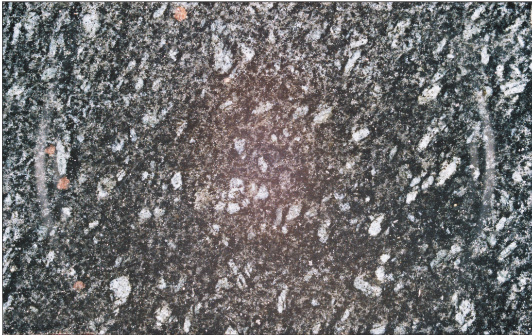
Meta-dacite Porphyry showing typical appearance of porphyritic texture in hand specimen