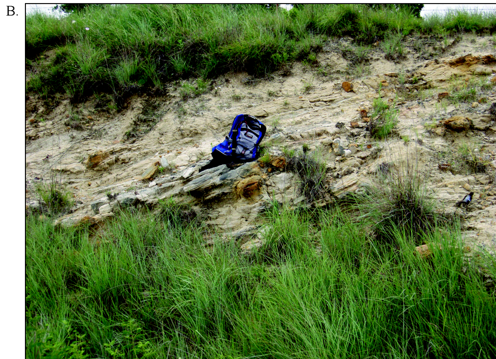
Field photos of (A) typical bedding in the Paluxy Formation and (B) more steeply dipping bedding associated with feature along Highway 56