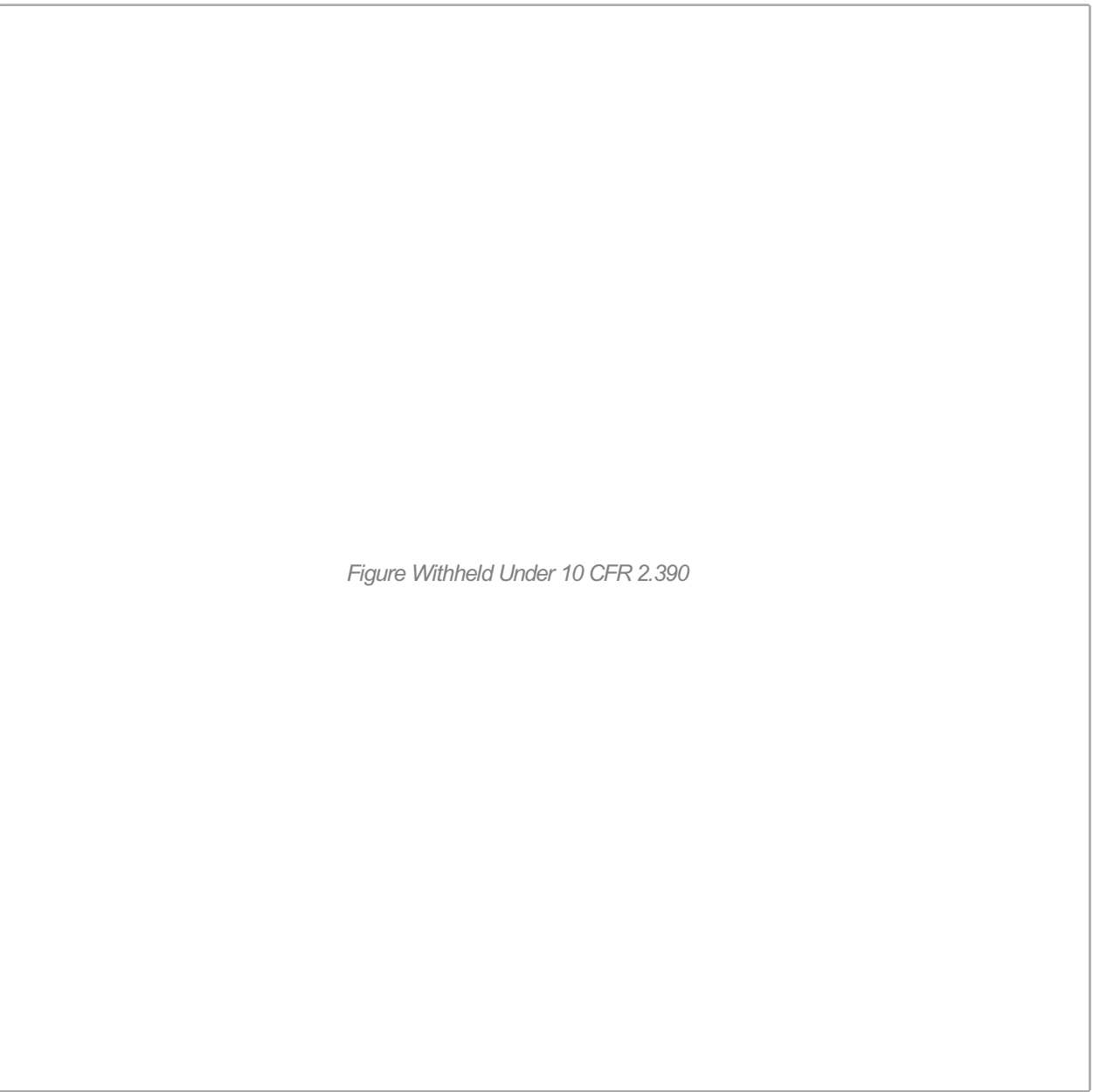
Figure Withheld Under 10 CFR 2.390