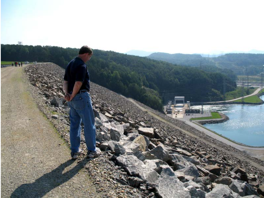
Jocassee Dam with hydroelectric powerhouse visible in background.

On June 15, 2009, NRR/DE led a delegation of a staff hydrogeologist, a staff hydrologist, a geo-structural engineer, and a R-II staff member to tour the Jocassee dam, the Keowee dam, the Oconee intake dike, the Little River dam, and several saddle dikes on all of the associated lakes. A complete list of participants is provided in Attachment 1. The purpose of the site visit was to examine the areas affected by the possible flooding at the Oconee Nuclear Station (ONS) caused by the postulated failure of the Jocassee dam and gain first hand knowledge of the ground conditions and engineering structures at the site. This visit was useful in supporting the staff's ongoing evaluation of the assumptions made by Duke in its March 2009 Jocassee-Keowee Dam Breach Model Report. At the end of the tour, the NRC staff discussed with the Duke staff and their consultants questions that had been communicated to Duke prior to the site visit. Duke staff provided several documents in response to the staff's questions; these documents are listed in Attachment 2. Described below is a summary of the information gathered during the tour of the dams and the subsequent discussions.