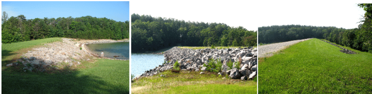
Saddle dikes at Jocassee Lake are protected from wave action by rip rap on sides facing lake. Top: Saddle Dike #2. Middle: rip rap on lake side of Dike #1. Right: downstream side of Dike #1 has grass but no rip rap (french drain is visible along toe of dam).

There are two earthen saddle dikes west of the main Jocassee dam, which could potentially function as an uncontrolled spillway in the event of a severe storm coupled with an inoperable spillway gate. The crest elevations of these dikes are the same as that of the main dam. These two saddle dikes could provide emergency outlets that could prevent overtopping failure of the Jocassee dam. Overtopping failures are the most hazardous for any dam. As shown in the photos below, Saddle Dikes #1 and #2 do not have rip rap on their downstream sides. If overtopped, they would rapidly erode forming breaches that would drain the reservoir down to the base level of the dikes. This would still allow the reservoir to retain most of its water volume, averting a catastrophic emptying of the entire lake. Both dikes are protected from wave erosion by rip rap armoring on the lake-facing slopes. Lowering the saddle dikes by ~0.5 m would provide further assurance that if a probable maximum flood inflow occurred to Jocassee Lake, failure of the saddle dikes would prevent overtopping and catastrophic failure of Jocassee Dam.