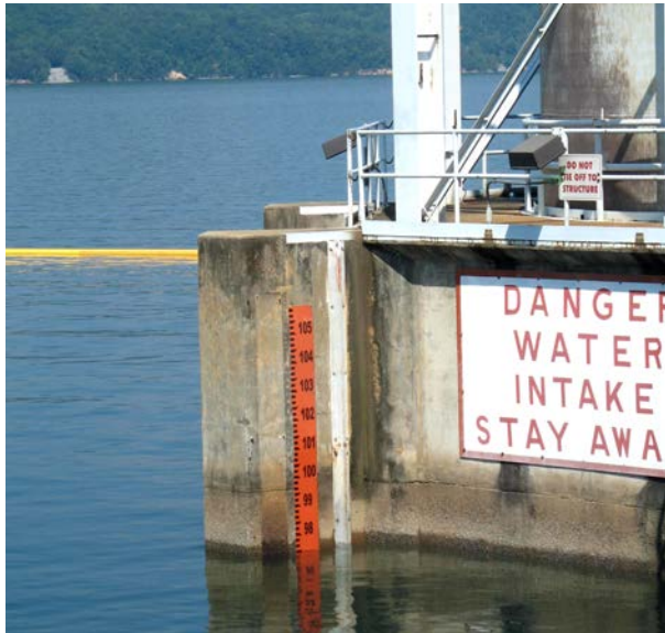
Gauge to measure height of Jocassee lake stage.

Duke Power monitors the Jocassee Reservoir level and has a camera trained on a gauge at one of the intake structures for real-time observations. The gauge is shown in the figure below.