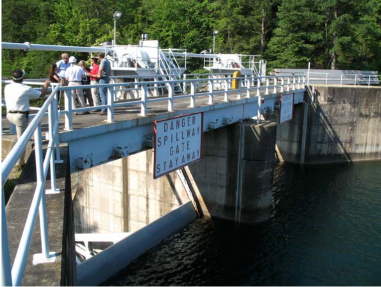
Spillway structure for Jocassee Reservoir.

In the afternoon of June 15, 2009, the NRC review team visited the Keowee dam and its appurtenant structures, and found them to be in good condition.