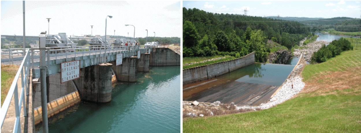
Keowee Dam spillway with four radial gates (left), and view of outflow channel (right).

The licensee indicated to the NRC staff that they were considering to make modifications at the Oconee site to provide added assurance that it is protected from a flood caused by a failure of the Jocassee dam. The licensee cautioned that this statement is based on preliminary information from running various scenarios with the HEC-RAS model, but they are now considering building flood barriers at up to 3 areas of the site: the west end of the Keowee dam, the road that leads to the site from the Little River basin, and the Oconee intake dike.