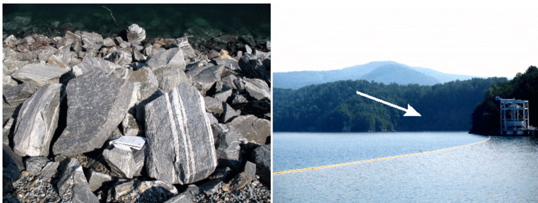
Upper left: Biotite gneiss (metamorphic rock) that serves as rip rap at Jocassee Dam. This rock type is extremely durable and not subject to breakdown over time under saturated conditions. Upper right: Arrow points to lake embayment that Duke representatives identified as the main quarry site (now submerged) used to obtain Jocassee Dam rock fill materials. Structure at right is one of two Jocassee intake structures.

The main Jocassee dam was observed to be in good condition without any obvious signs of instability. The hydrogeologist identified the rock type as biotite gneiss (see figure below) used for rip rap and reportedly used as rockfill material in the Jocassee dam. This rock type is not the kind that would degrade over time. The staff found no evidence of degradation of the rockfill material within the dam because the seepage observed was clear with no obvious suspended solids.