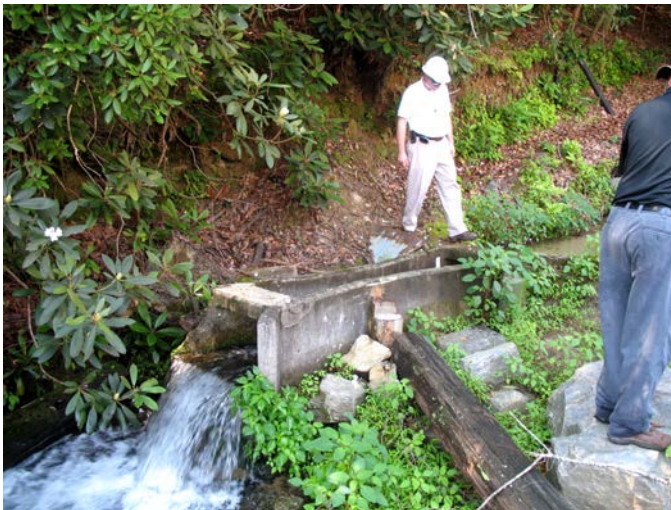
Clear discharge from a flume at the main seepage collection point low on the western abutment of Jocassee Dam.

In previous inspections of the Jocassee dam, FERC identified the seepage of water from the abutments as potential failure modes for the dam, and recommended that Duke continue the monitoring of the seepage and establish threshold levels for the seepage. During this trip, the NRC review team observed the seepage of water in the abutments and was informed by the Duke staff that the measured seepage was within the “action levels” determined by them based on historical seepage data at the site. Furthermore, the seepage water was clean and clear with no sediment present, indicating no apparent erosion or degradation of embankment materials. Duke provided measured seepage data, which the NRC team is reviewing.