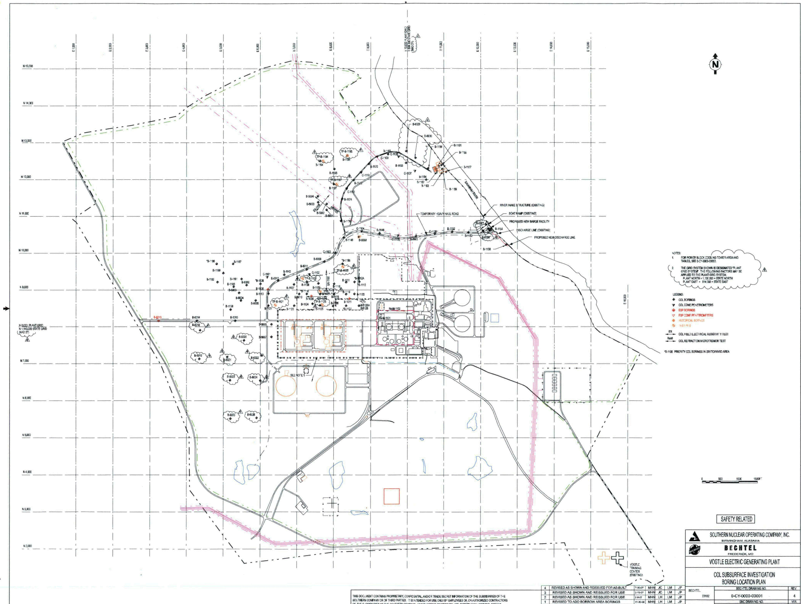
Figure 2A 59 of 62

THIS DOCUMENT CONTAINS PROPRIETARY, CONFIDENTIAL, AND/OR TRADE SECRET INFORMATION OF THE SUBSIDIARIES OF THE SOUTHERN COMPANY OR OF THIRD PARTIES. IT IS INTENDED FOR USE ONLY BY EMPLOYEES OR AUTHORIZED CONTRACTORS OF THE SUBSIDIARIES OF THE SOUTHERN COMPANY. UNAUTHORIZED POSSESSION, USE, DISTRIBUTION, COPYING, DISSEM.