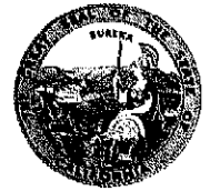
ARNOLD SCHWARZENEGGER Governor