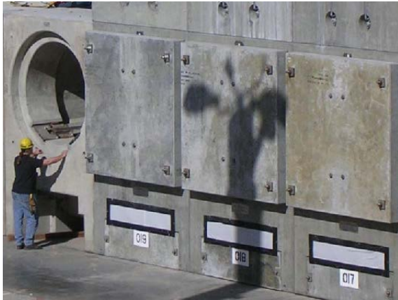
Horizontal storage system

The NRC developed cask licensing requirements through a public process to provide a sound basis for ensuring protection of public health and safety and the environment. NRC staff conducts thorough reviews and only approves designs that meet those requirements. Utilities can choose from two licensing options, both of which allow for public input: