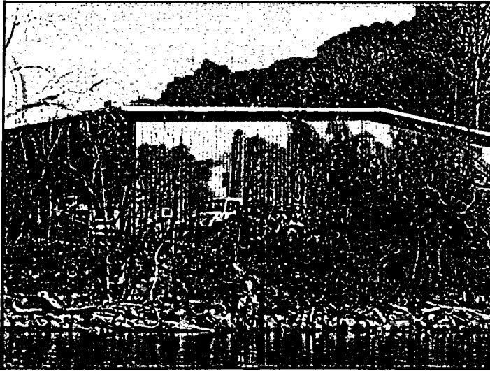
Picture above shows the location of Monitoring Well 48 during well construction.