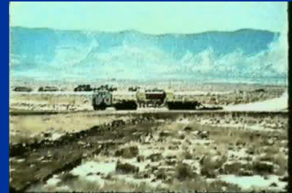
Truck Collision - SANDIA