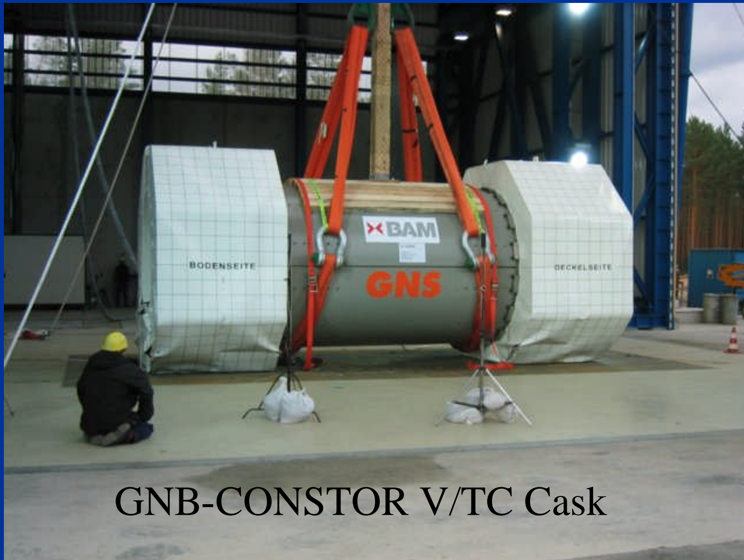
GNB-CONSTOR V/TC Cask