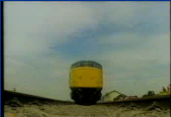
Operation Smash Hit CEGB - Britain