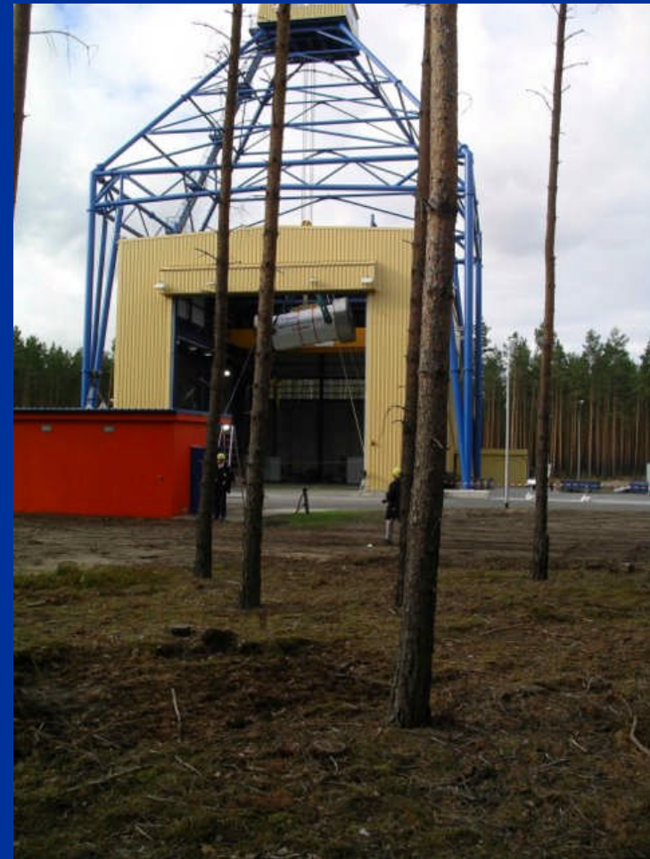
Test preparation for the MHI-MSF69 BG Spent Fuel Cask (shallow angle drop)