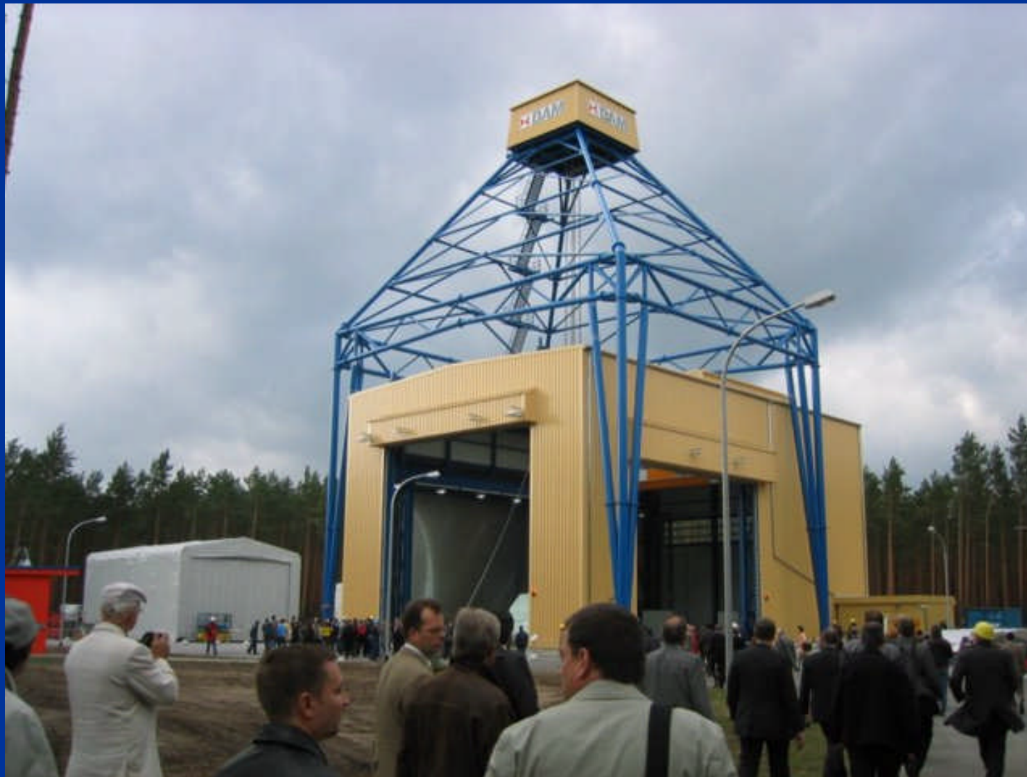
BAM Drop Test Facility in Horstwalde, Germany