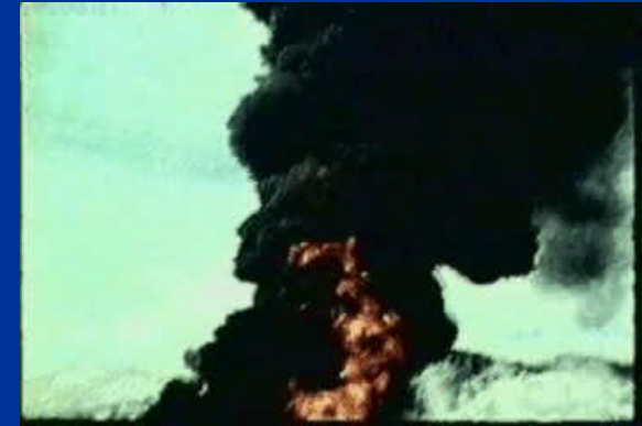
Rail Fire - SANDIA