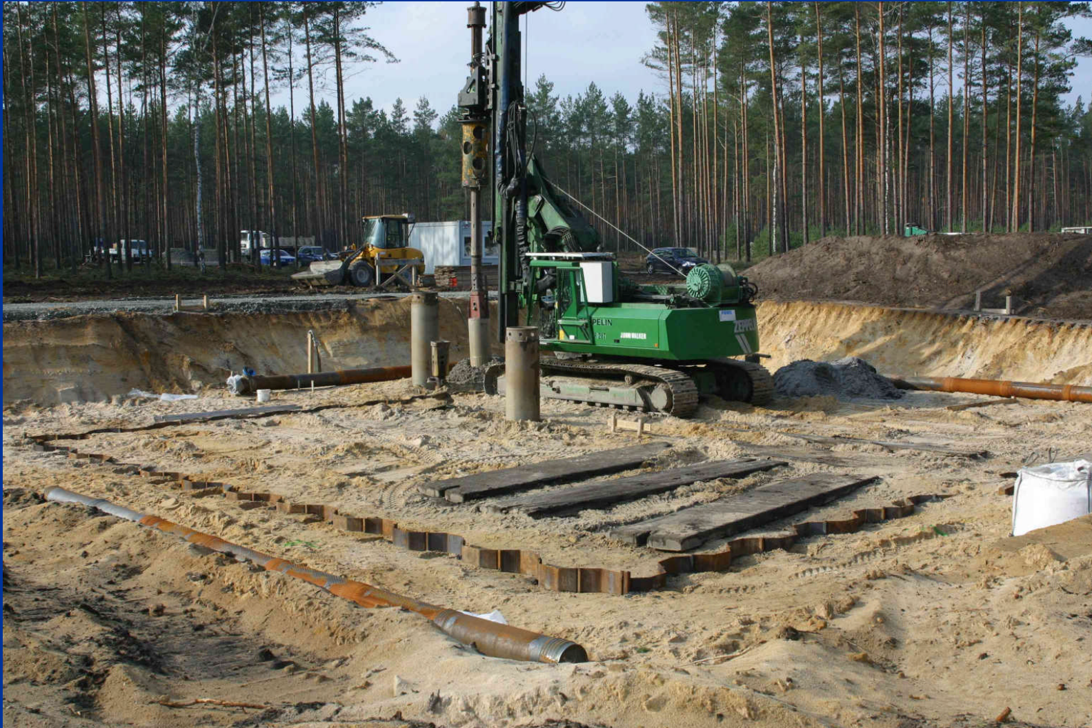
Initial ground excavation and soil preparation