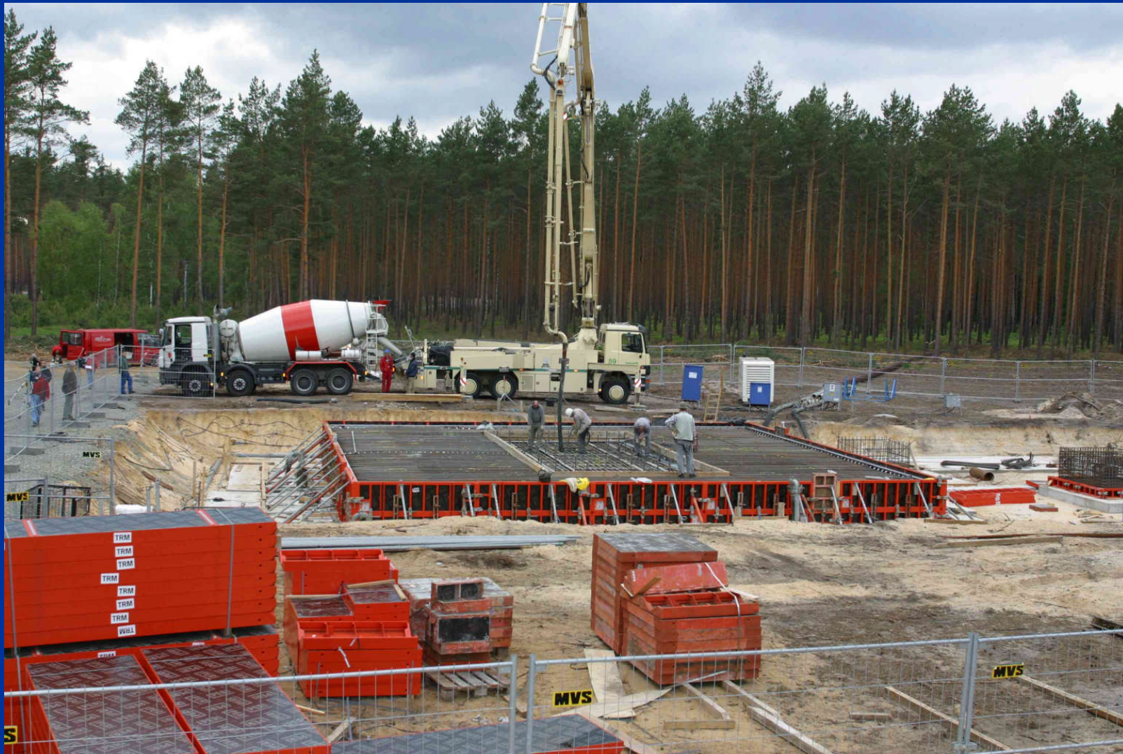
Pouring concrete for the unyielding surface