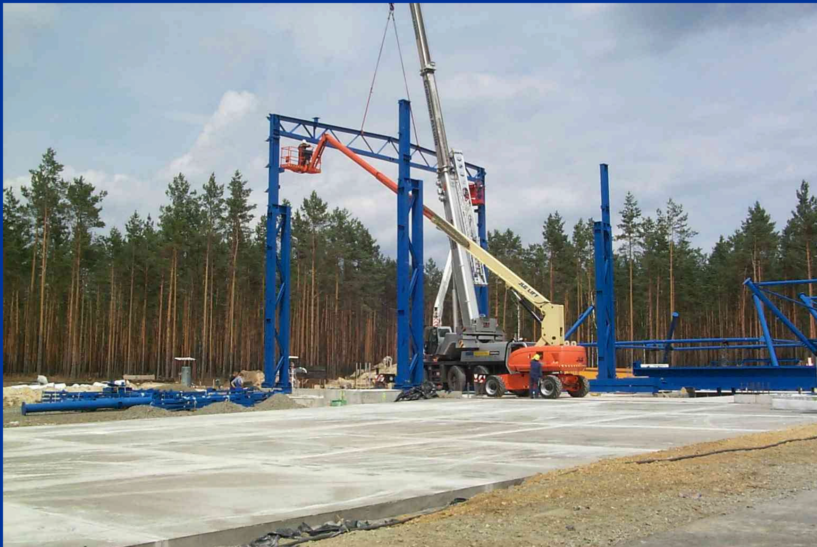
Initial construction work on enclosed test building