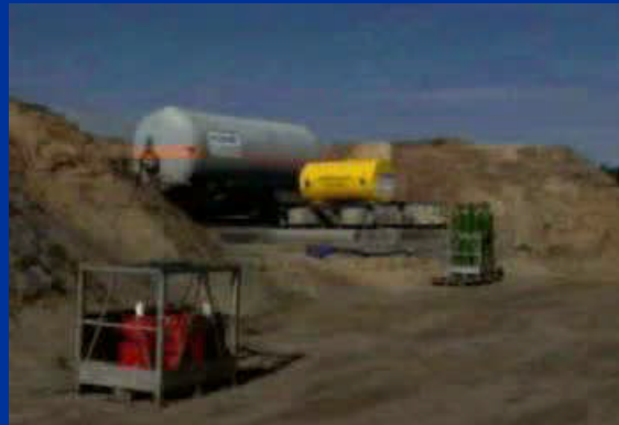
Propane Tank Explosion BAM - Germany