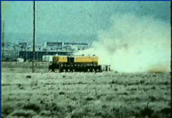
Rail-Truck Collision - SANDIA