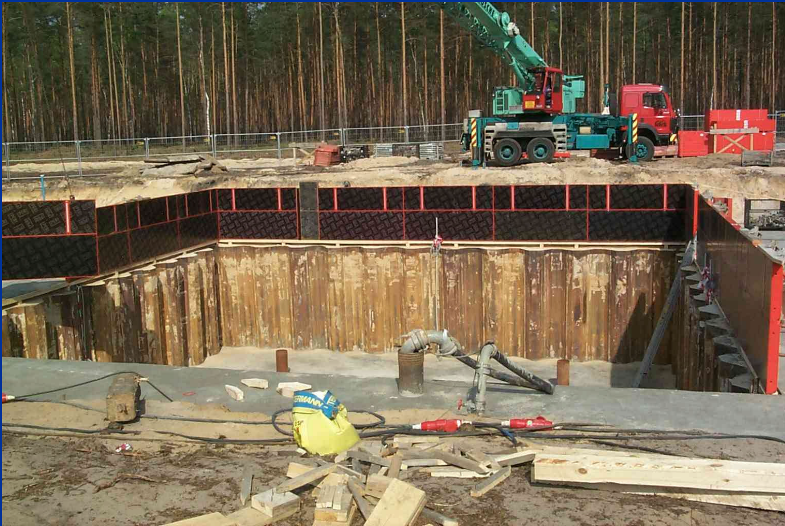
Excavation and lining of a cavity for the unyielding surface . (46 ft x 46ft x 16.5 ft).