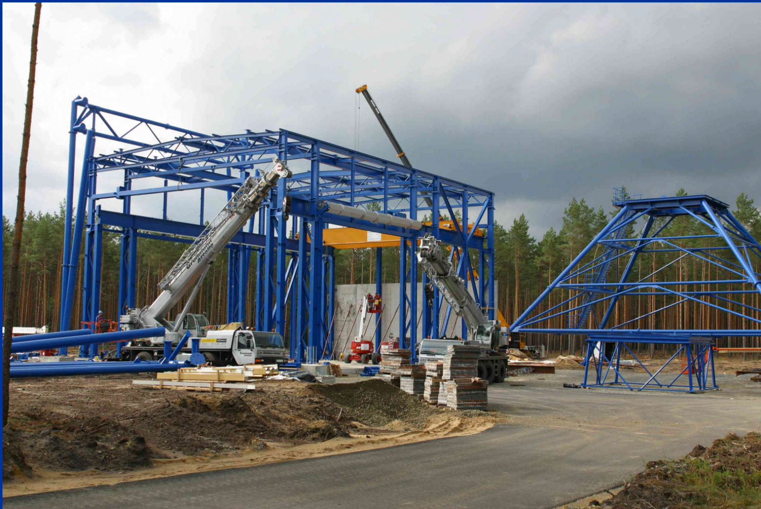
Finished skeleton of enclosed test building (left) and top of drop tower (right)