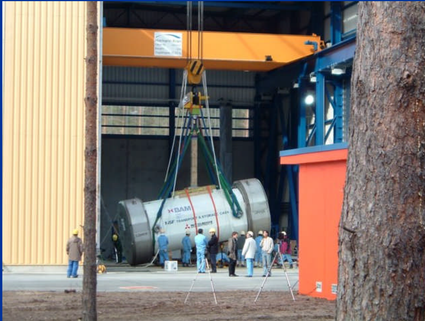
MHI-MSF69 BG Spent Fuel Cask being prepared for shallow angle drop test