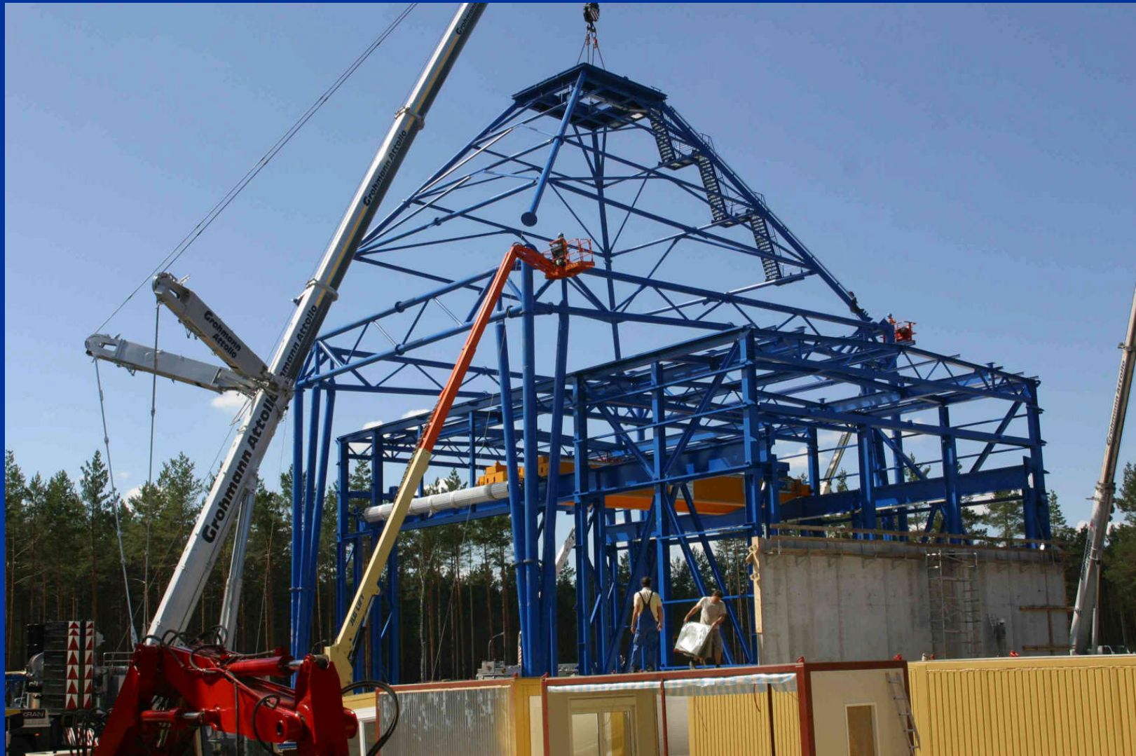
Top of drop tower being hoisted into place by an 80-ton portable crane.