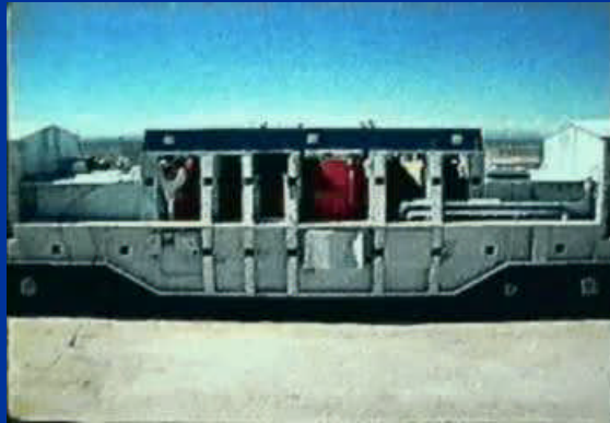
Rail Cask Collision - SANDIA