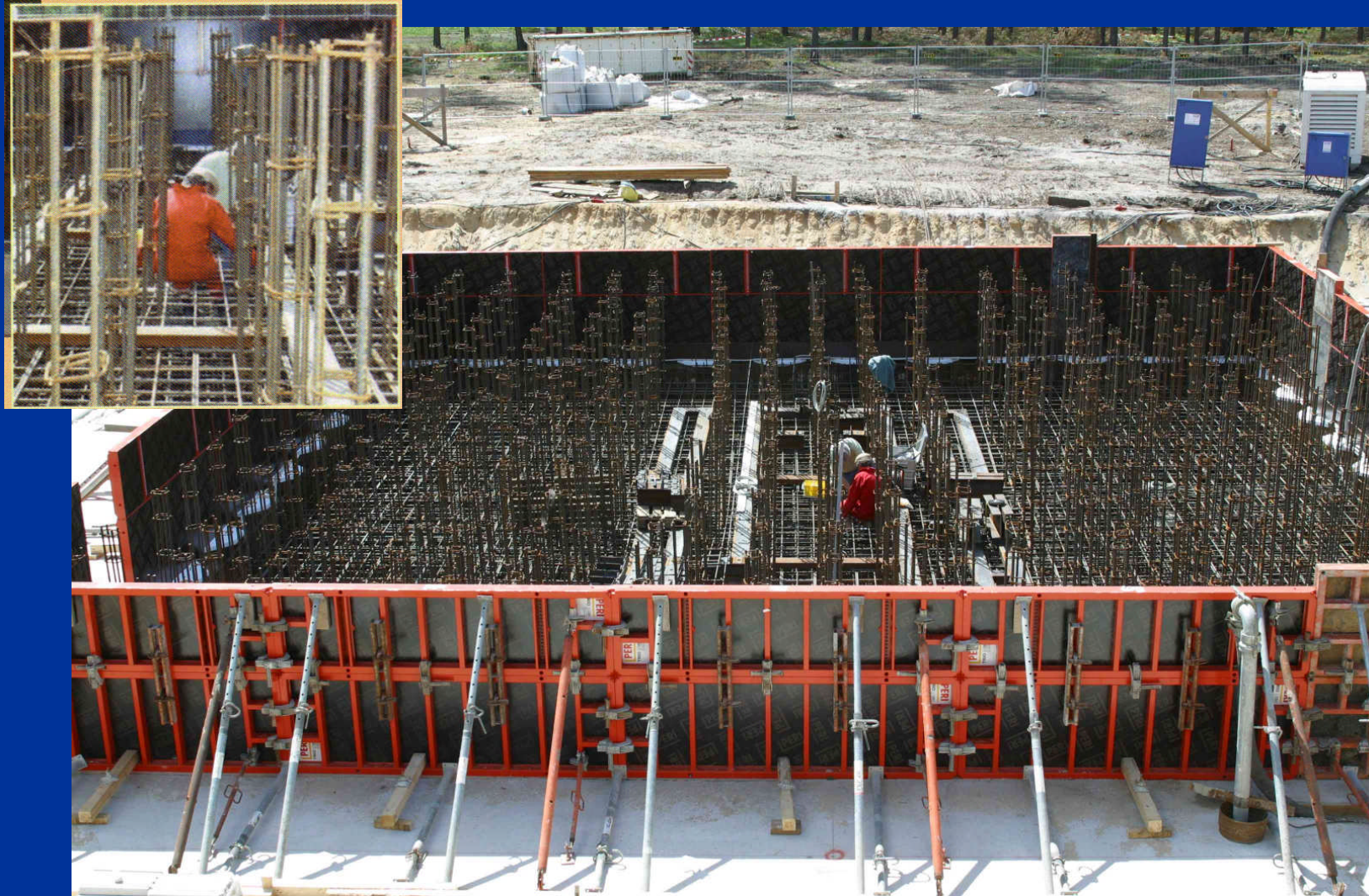
Placement of steel reinforcement bars, and test instrumentation (force and strain gauges)